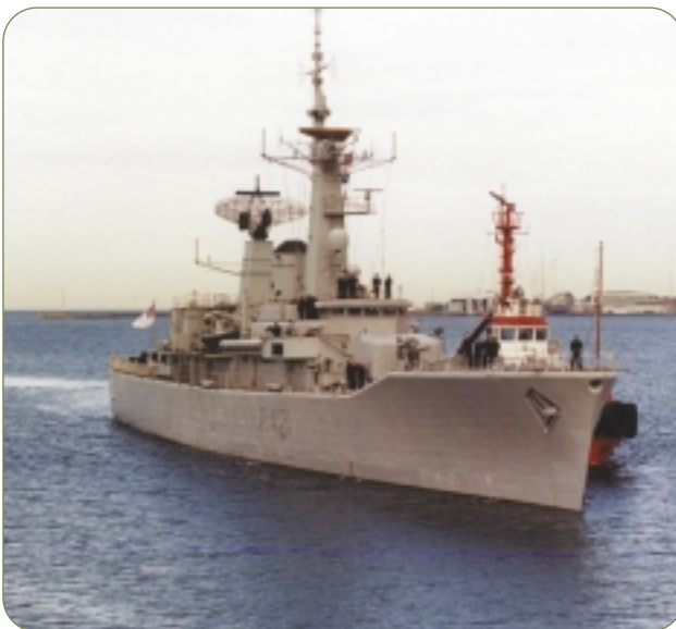
Ready to serve: HMNZS Canterbury .

The frigate completed sea tests to verify the safe and correct operation of its main switchboard, which distributes electrical power to the ship from two of the ship's four generators.