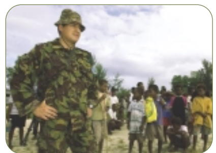
Spreading the word: New Zealand Air Force (left) and Army personnel at work in Solomon Islands.

Combined Task Force mission to restore stability to the area.