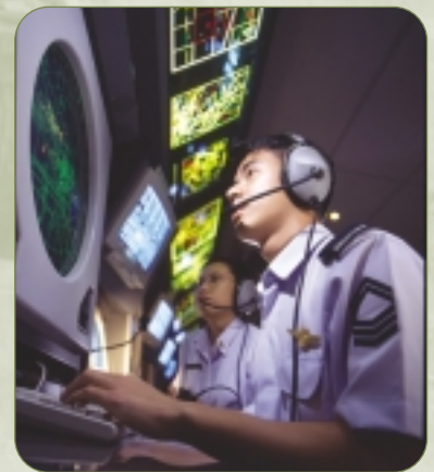
Well equipped: Singapore Armed Forces personnel (above and below).