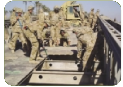
New Zealand Army engineers at work in Iraq.

Defence Minister Mark Burton said the government knew that the NZDF contribution in each of these theatres had been greatly respected and valued, and that "our forces will again acquit themselves with distinction.