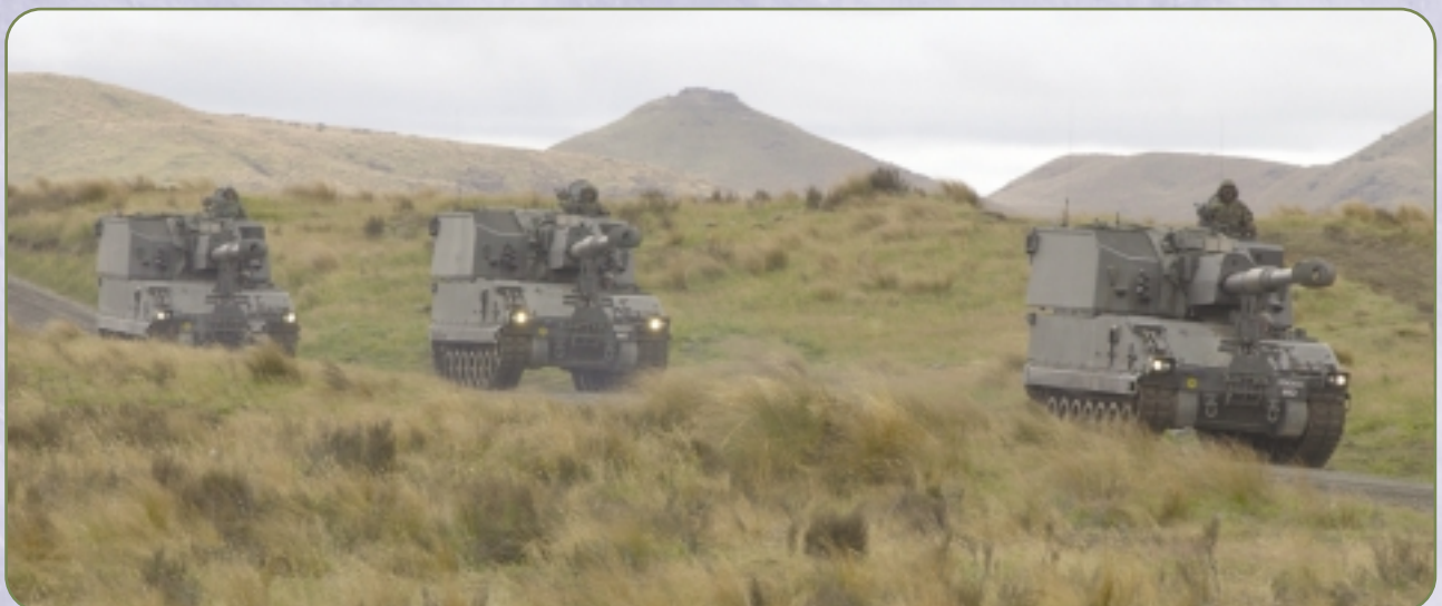
Training: Singapore's 155mm Howitzers train at Waiouru.

The pride and joy of the SAF, the self propelled howitzer is a new weapons system, manufactured in Singapore and publicly launched in November last year. Known as the Primus, the gun is the lightest and most responsive self-propelled howitzer of its class.