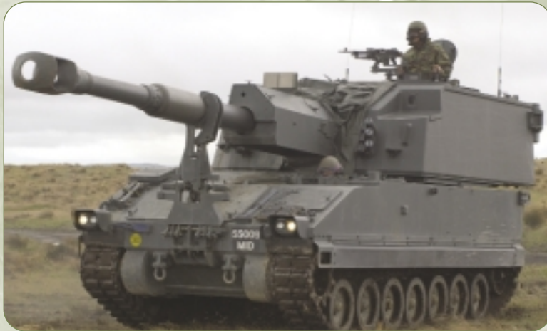
A Singapore Army howitzer on exercise in Waiouru.

"There will be inevitable spin-offs when those who train New Zealand on defence exercises return home and discuss the positive aspects of visiting New Zealand."