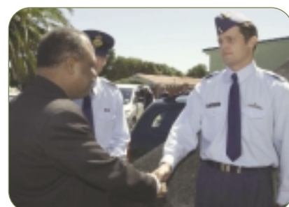
Thanks: Prime Minister Sir Allan Kemakeza is greeted by Flight Lieutenant Owen Rogers at No.3 Squadron