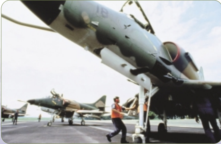
Royal Singapore Air Force maintainers prepare aircraft at their Singapore base.

When the six artillery guns owned by the Singapore Armed Forces arrived in Wellington recently, it was but one sign of a relationship that is developing rapidly and positively.