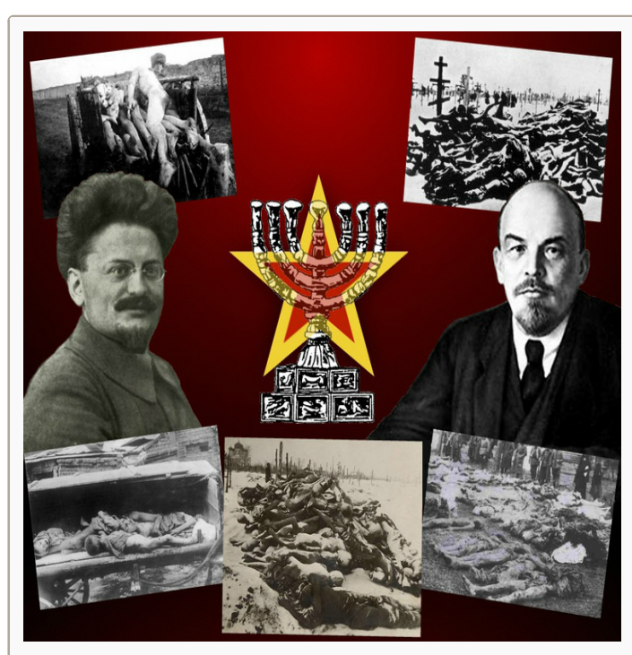
Death and destruction -- the legacy of Jewish Communism!

"After coming to power, Trotsky became Lenin's right-hand man. It was actually Trotsky who ruled Russia during Lenin's illness. He mercilessly caused the people suffering of a magnitude the world had never seen before. In the beginning Trotsky wanted to use the guillotine to execute people, but was scolded for this idea.