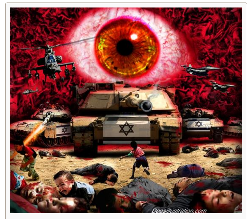
The treacherous terror of Zion permeates the globe!

"But of the cities of these people, which the LORD thy God doth give thee for