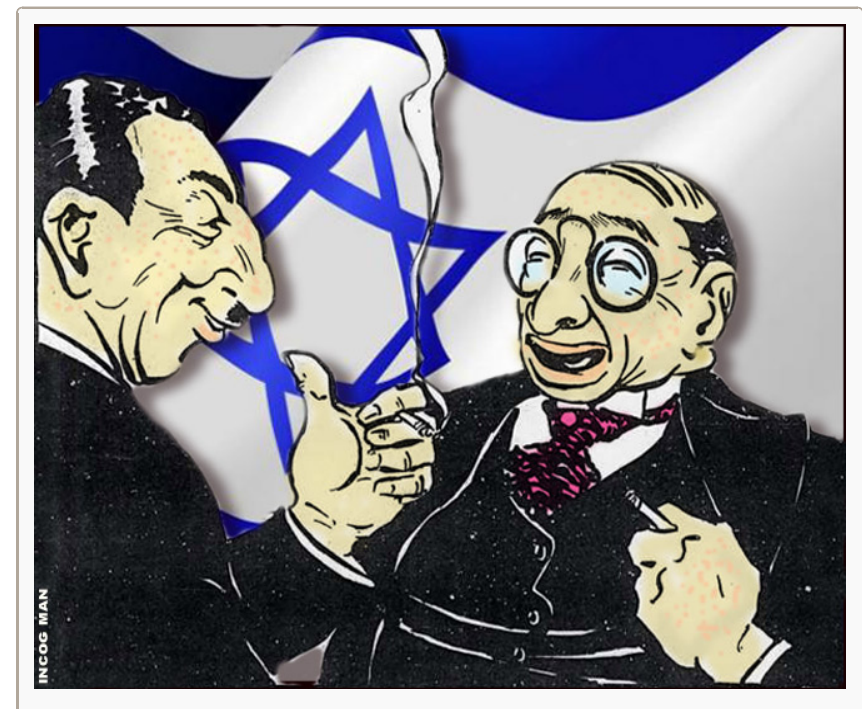
Zionism and Communism are but two arms of the Jewish World Swindle.

With the advent of Communism in the early 19th century, we saw the world plunge into a brutal chaos of social cataclysm and economic decay. Indeed, the goal of International Communism was never to "free the workers" from capitalist oppression. but rather to further enslave them to a small cadre of self-declared and selfperpetuating elite vanguards who ruled their subjects with an iron fist. From its inception, Communism and Socialism was a Jewish endeavor to usurp the remaining Gentile nations free from Jewish control, plunder their wealth, and enslave and murder the best of their people!