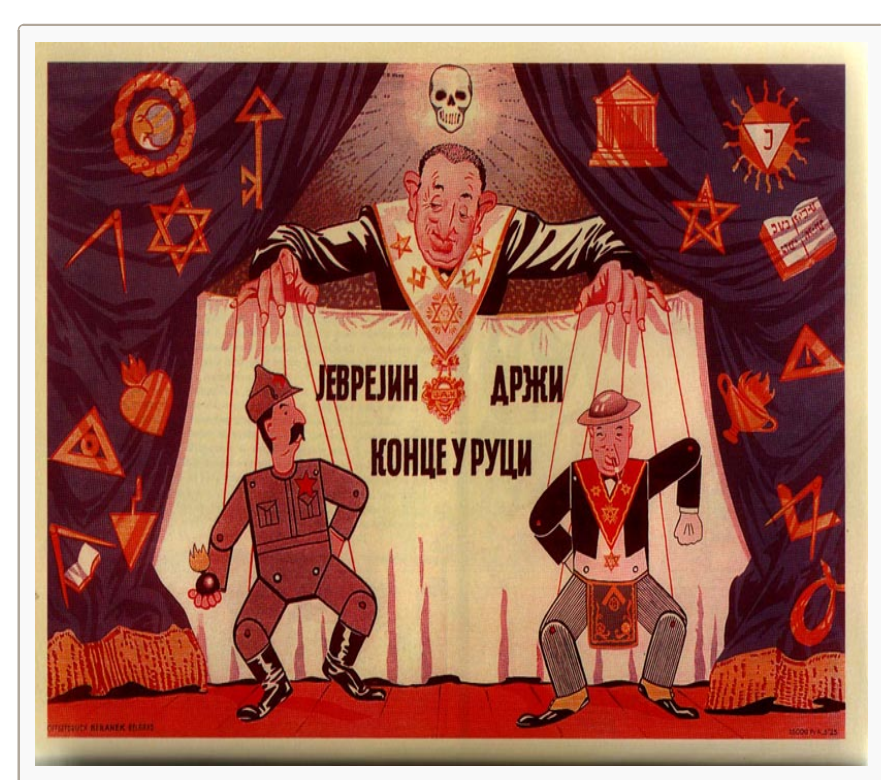
Communism is Jewish, Freemasonry is Jewish -- Gentile communists and freemasons are nothing more than the cat's paw of the International Jewish Money Power.

The Protocols of Zion make clear this intention to use subservient Gentiles (shabbas goyim) as scapegoats,