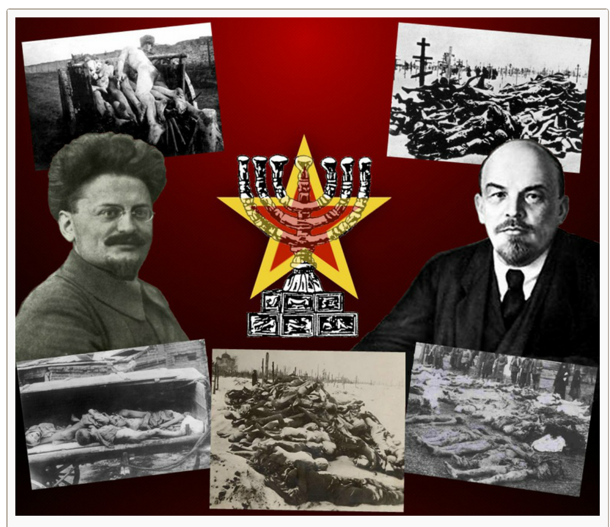
This is what awaits us in the Jewish New World Order, beware!