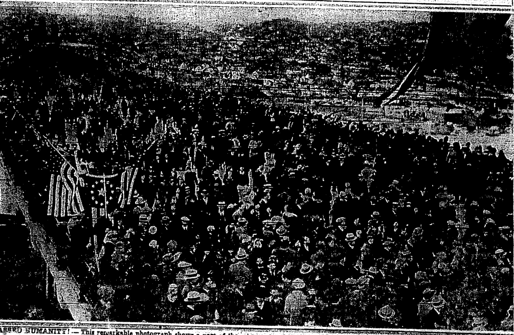
Representatives of Washington State and British Columbia sawed through a fire log barricade to open the new bridge serving as a new link between the two countries. Note the flag at upper right which was released when the President touched the key.