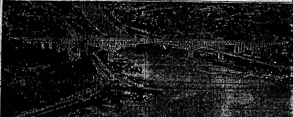
TO BE DEDICATED—National interest centers today on the new George Washington Memorial Bridge, where impressive ceremonies will mark its dedication on the 200th anniversary of George Washington's birth.