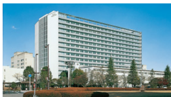
Head Office Technical Center (Toyota City, Aichi Prefecture, Japan)