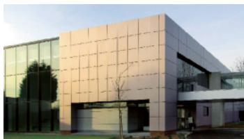
Toyota Motor Europe R&D/Manufacturing (Brussels, Belgium; Derby, U.K.)