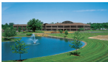
Toyota Motor Engineering & Manufacturing North America, Inc. (Ann Arbor, Michigan, U.S.A.)