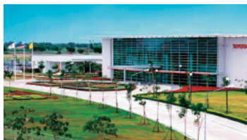
Toyota Motor Asia Pacific Engineering and Manufacturing Co., Ltd. (Samutprakan, Thailand)