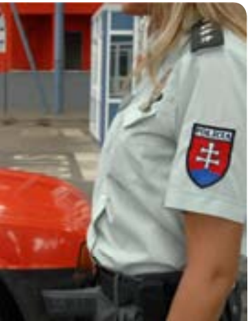
Slovak border guard checking at the Slovak-Ukrainian border