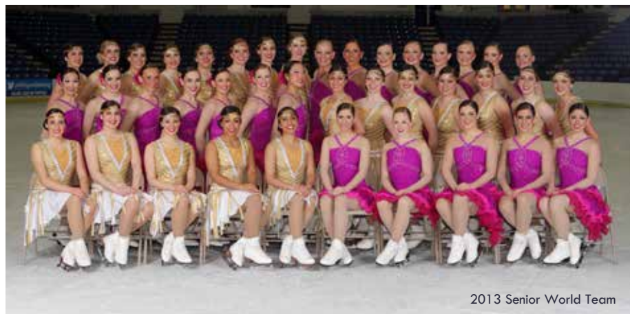
2013 Senior World Team