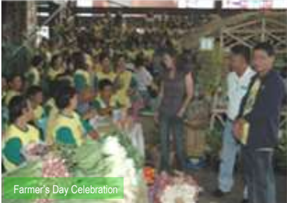
Farmer's Day Celebration