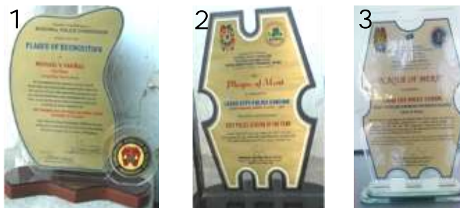
L-R: 1. Hall of Famer, Best Peace and Order Council in Region 1, Component City Category, 2002-2008; 2. Most Outstanding City Police Station of the Year, 2005, 2007 and 2008, 2009 & 2010; 3. Model Urban Police Station, 2004