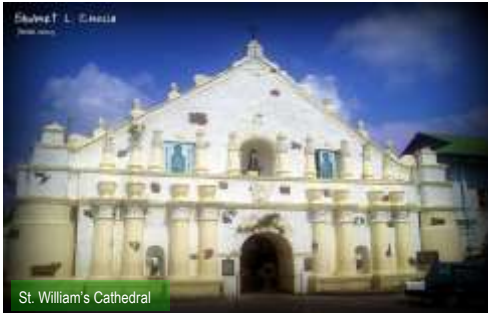
St. William's Cathedral