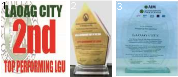
L-R: 1. 2010 2 nd Placer, Top Performing LGU in the Philippines, based on Local Governance Performance Monitoring System; 2. 4 th Most Livable City in the State of Competitiveness Survey of the Asian Institute of Management, 2008; 3. Plaque of Recognition, Apolinario Mabini Award Philippine Foundation for the Rehabilitation of the Disabled, Inc., 2005