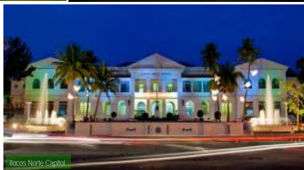
Ilocos Norte Capitol