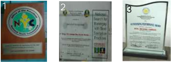
L-R: 1. Gawad Kampeon ng Kabataang Pilipino 2009, National Youth Commission; 2. National Winner for Barangay with Best Sanitation Practices, Barangay 27, Laoag City, DOH, 2008; 3. Outstanding Performance Award conferred to MVF. BSPOs in Natural Family Planning. Commission on Population, 2007;