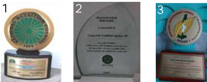
L-R: 1. Consistent Finalist, Regional Best Nutrition Council, 2000-2007. Champion, 2008; 2. Regional Achiever’s Award for Public Private Mix DOTS Facility: Laoag City Coalition Against Tuberculosis, 2009; 3. Most Outstanding LGU Coastal Resource Management Implementer CY 2009 City Category, Region I