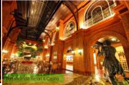
Fort Ilocandia Resort & Casino