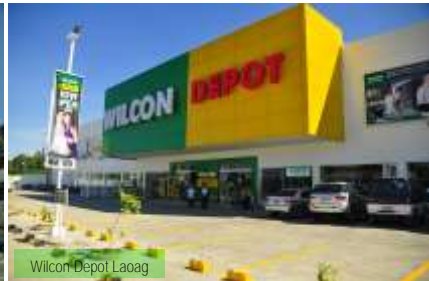
Wilcon Depot Laoag