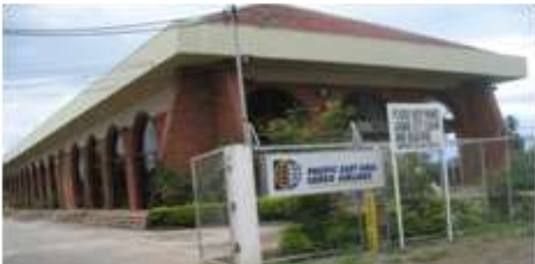
Laoag International Airport