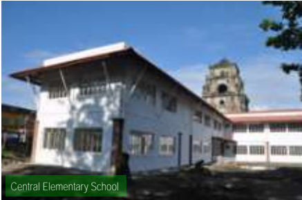
Central Elementary School