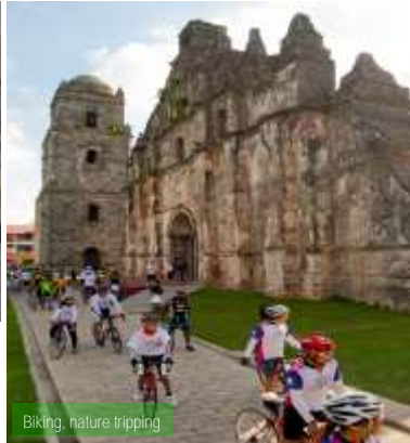
Biking, nature tripping