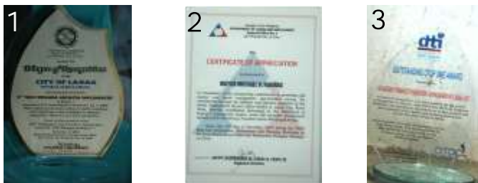
L-R: 1. 2 nd “Best Brigada Ahensya Implementer” in Region I, 2008; 2. Best Local Chief Executive Implementer of DOLE Programs and Services, 2008; 3. Outstanding OTOP SME Award. Department of Trade and Industry, 2009