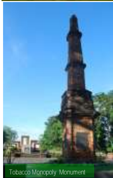
Tobacco Monopoly Monument