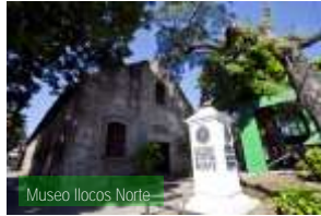
Museo Ilocos Norte