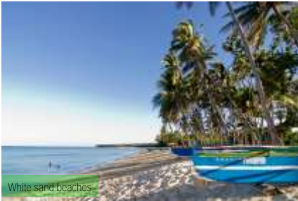
White sand beaches