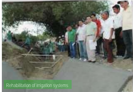
Rehabilitation of irrigation systems