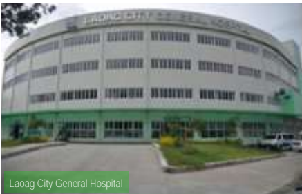
Laoag City General Hospital