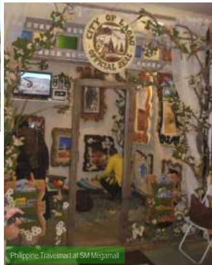
Philippine Travelmart at SM Megamall