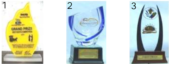
L-R: 1. Grand Winner. Best Booth Competition, Travelmart. 2004, 2005, 2007, 2008, 2009; 2. Christmasterpiece Bayanihang Pasko. Silver Award for 2005; Bronze Award for 2006; 3. Champion, Grand National Float Competition. Aliwan Festival, 2004, 2005, 2006, 2008 and 2009