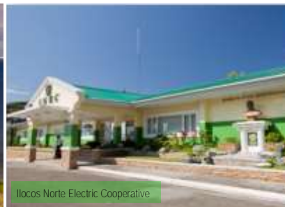
Ilocos Norte Electric Cooperative