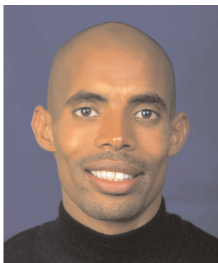
Victor Sailer / Photo Run (left & right photos)