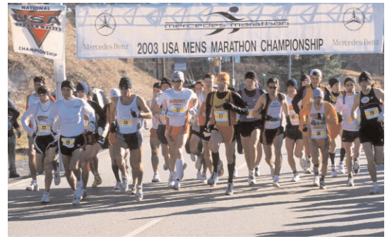
2003 Championship Start by Photo Run