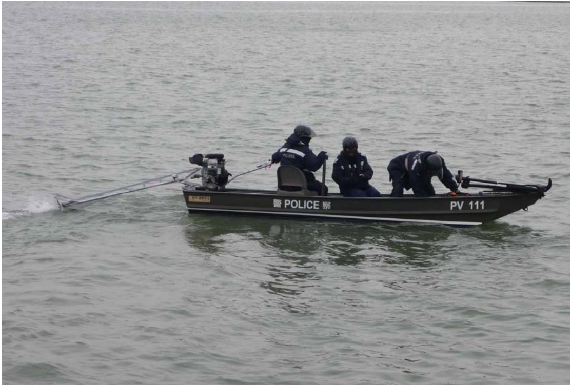
Police Vessel No. 111 Mudskipper (In service since 2010)