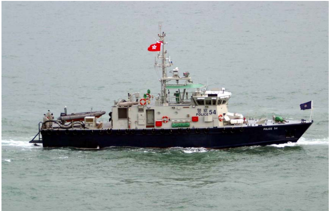
Police Launch No. 54 Protector Command Launch (In service since 1992)