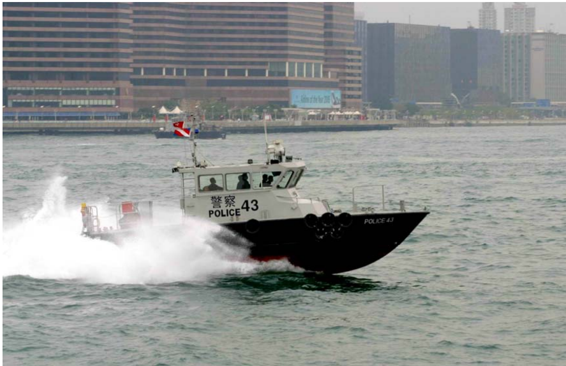
Police Launch No. 43 Cheoy Lee Inshore Patrol Craft (In service since 2000)