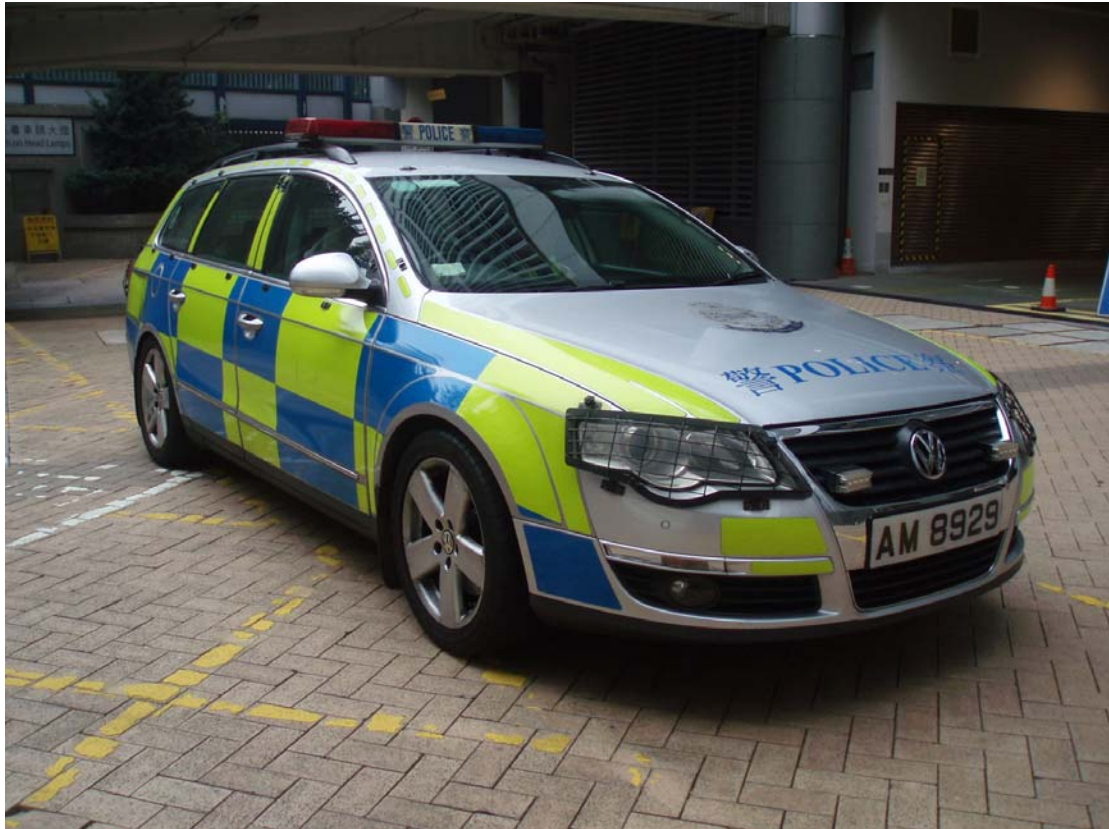
Estate Large – Volkswagen Passat Variant Used for patrol and traffic enforcement duties (2007 – 2015)