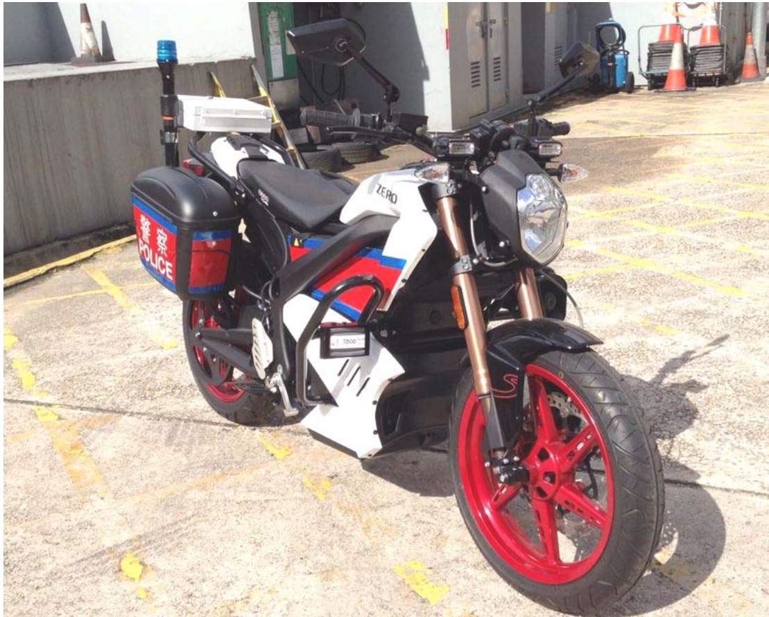
Motorcycle Small – Zero S ZF9 (Electric) Used for patrol and traffic enforcement duties (In service since August 2014)