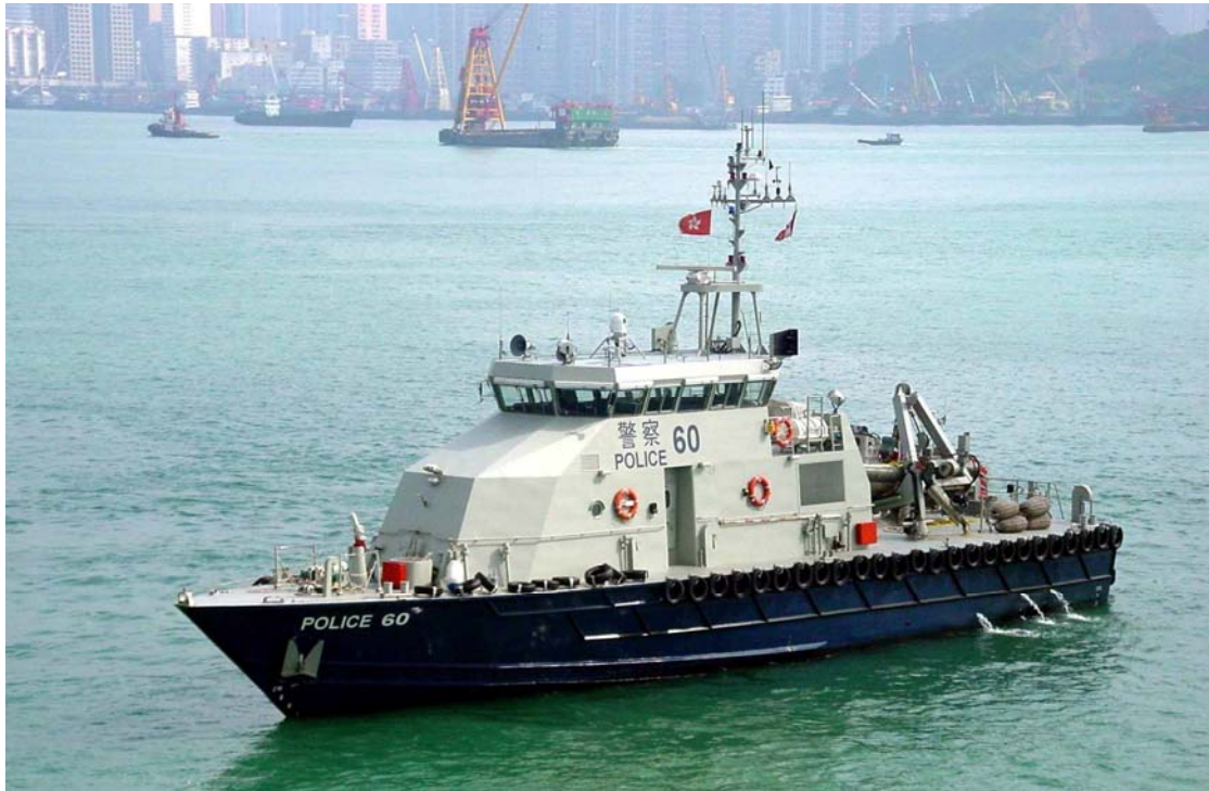
Police Launch No. 60 Keka Mark I Divisional Patrol Launch (In service since 2002)