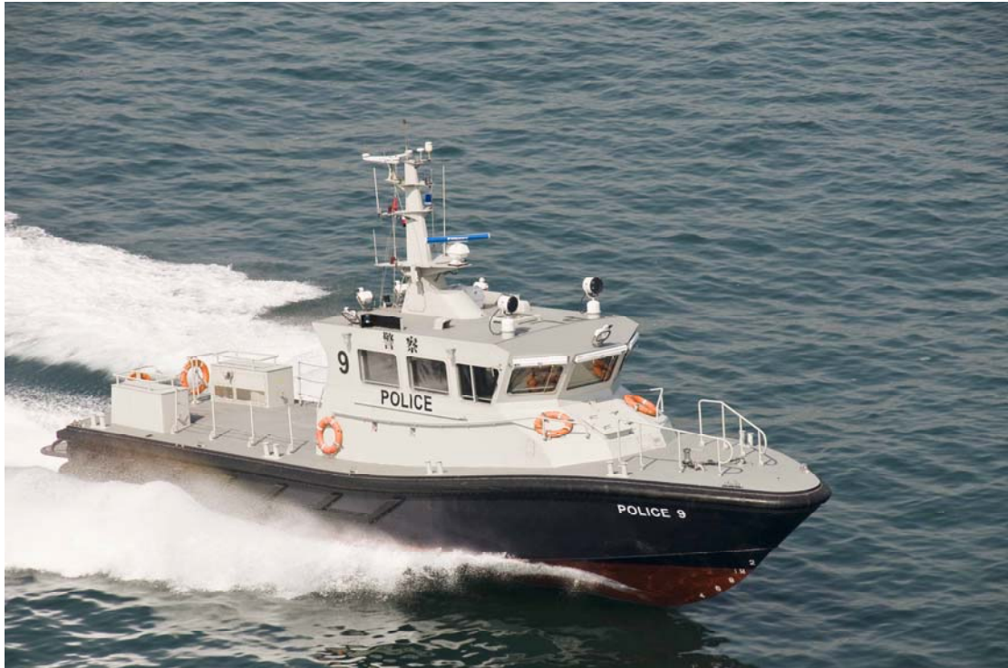
Police Launch No. 9 Medium Patrol Launch (In service since 2007)