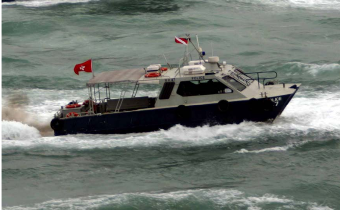
Police Launch No. 47 Seaspray Catamaran 11.4m Vessel Logistic Launch (In service since 1992)