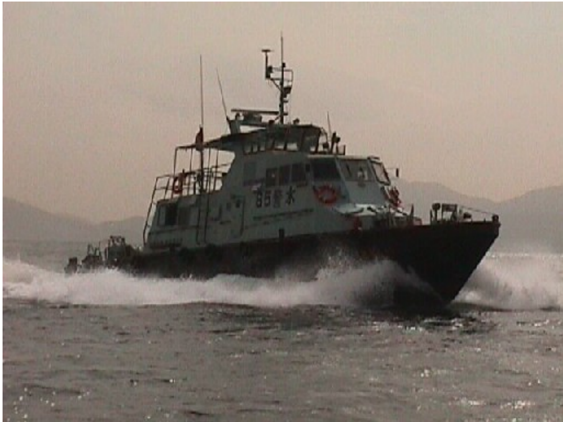
Police Launch No. 65 Dorado Damen Mark I Divisional Patrol Launch (1980 – 2004)