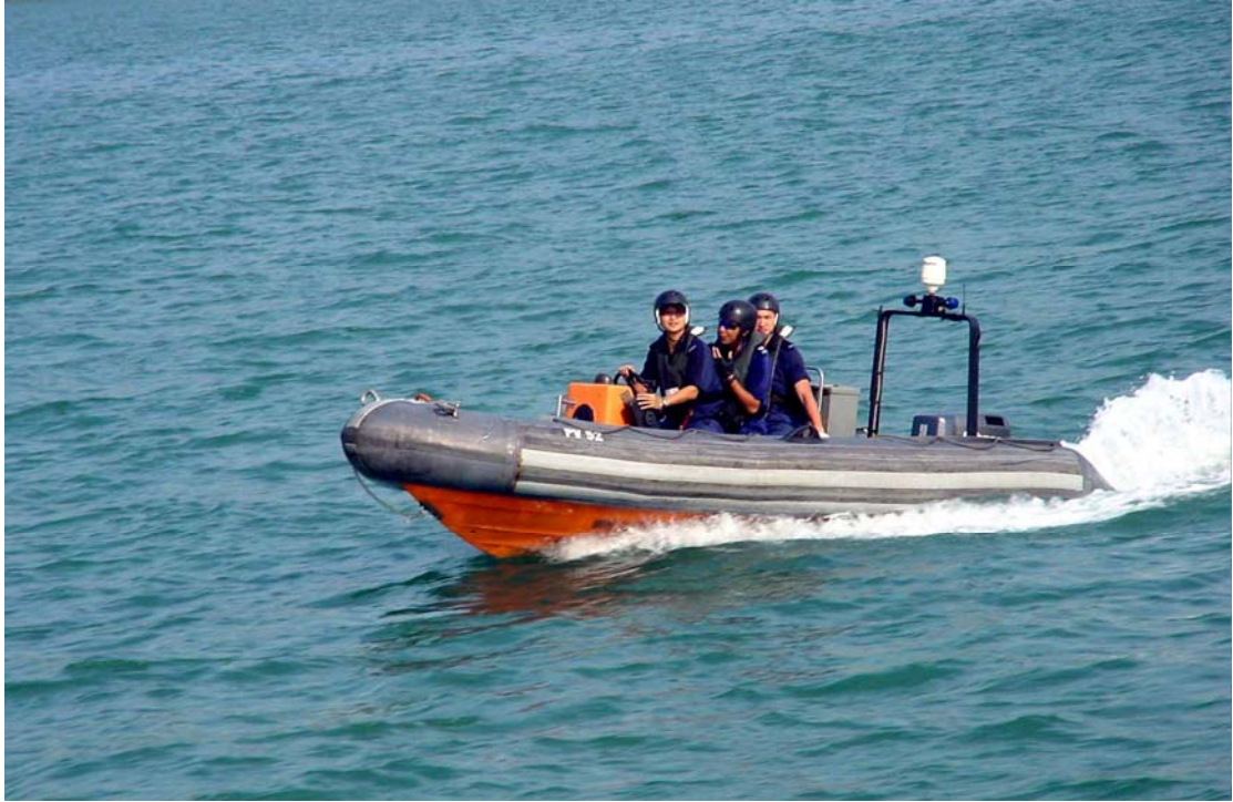
Police Vessel No. 52 Avon Searider Police Launch Tender (In service since 2002)