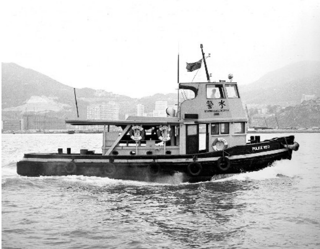
Police Launch No. 13 Harbour Patrol Launch (1946 – 1987)