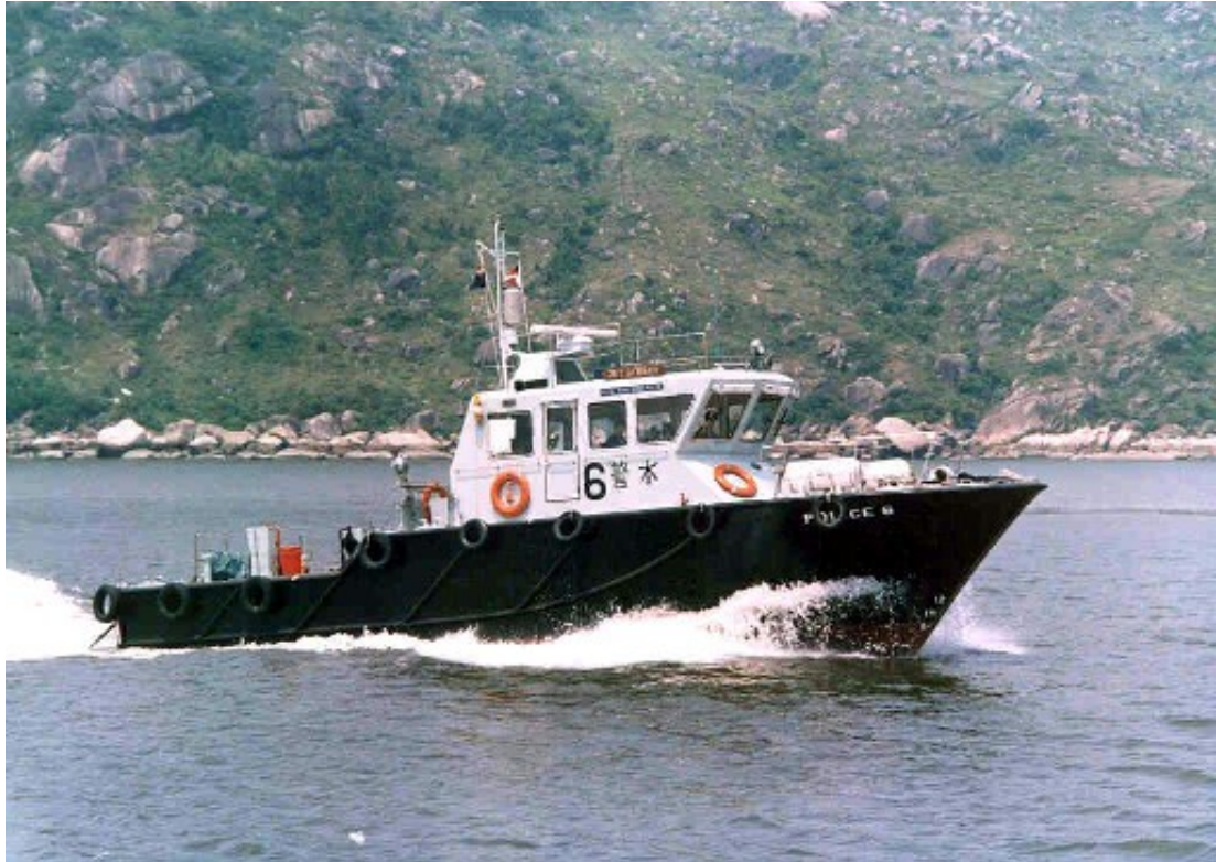
Police Launch No. 6 Jetstream Deep Bay Water Jet Boat (1986 – 2002)