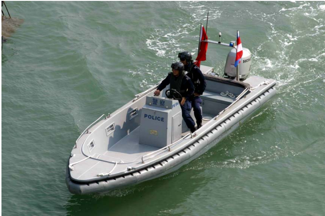
Police Vessel No. 94 Anda RH Shallow Water Patrol Craft (In service since 2003)