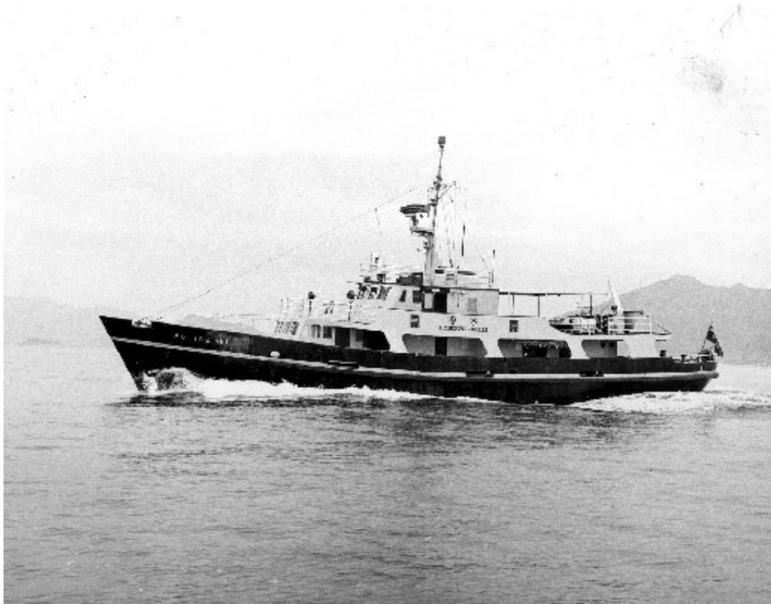
Police Launch No. 1 Sea Lion Command Launch (1965 – 1993)