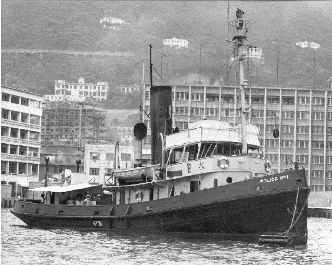
Police Launch No. 1 Empire Sam Command Launch (1946 – 1965)