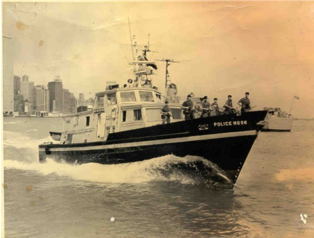
Police Launch No. 56 Sea Falcon Divisional Patrol Launch (1973 – 1992)