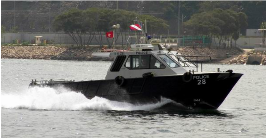
Police Launch No. 28 Seaspray Catamaran 9.9m Inshore Patrol Launch (In service since 1992)