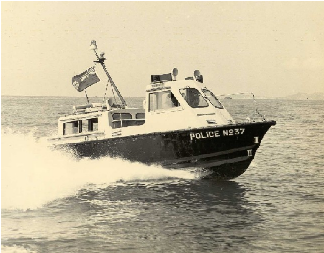
Police Launch No. 37 Javelin Police Motor Boat Inshore Patrol Launch (1972 – 1995)