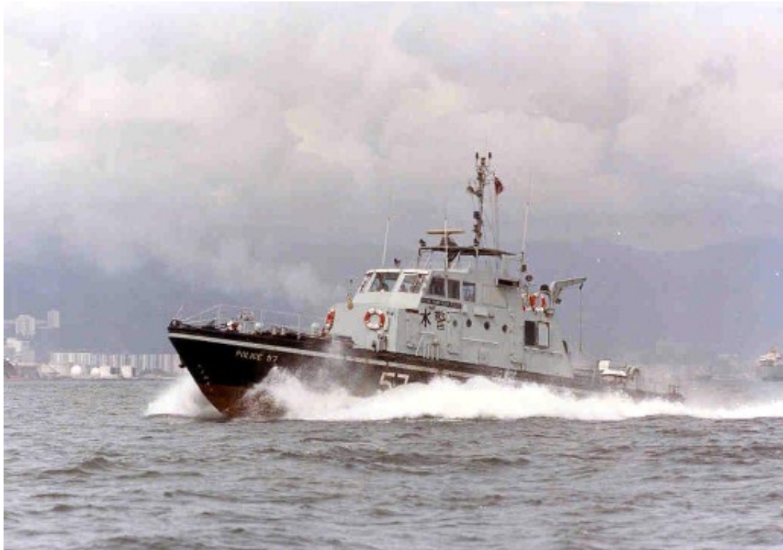
Police Launch No. 57 Mercury Damen Mark II Logistic/Emergency Launch (1982 – 1999)