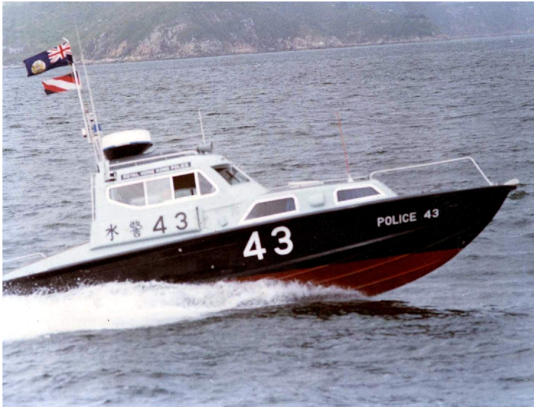
Police Launch No. 43 Fairey Spear Police Motor Boat Inshore Patrol Launch (1982 – 1992)