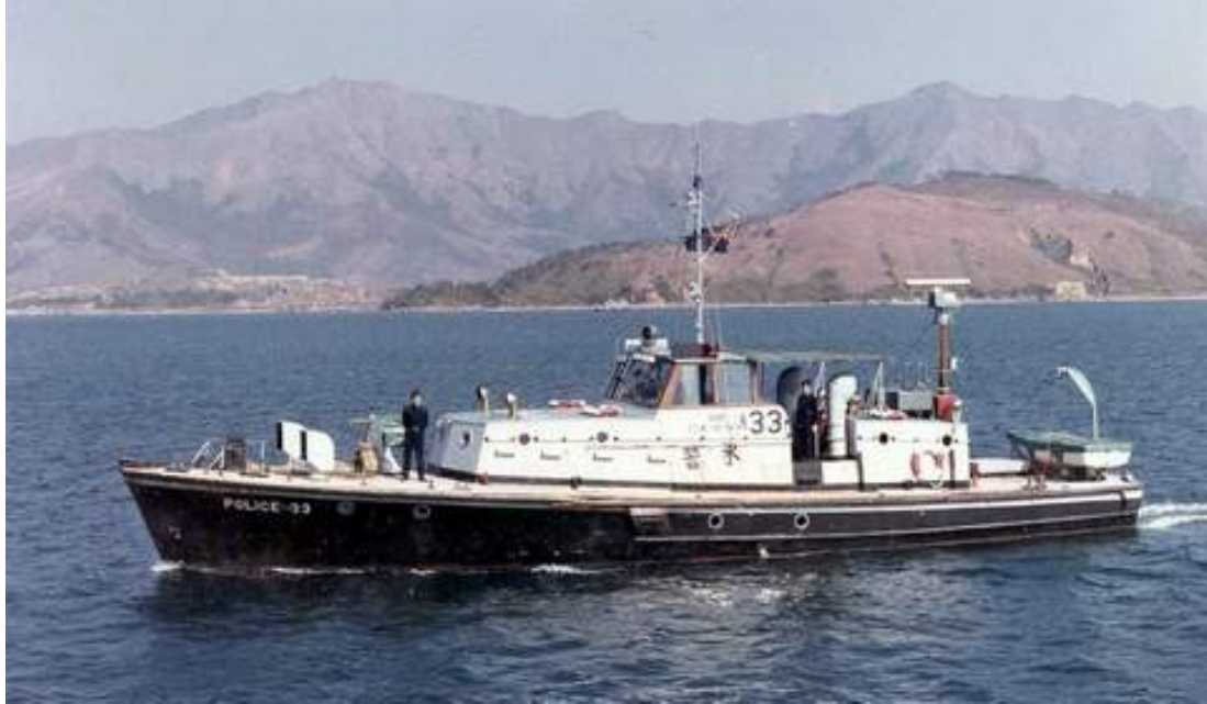
Police Launch No. 33 Sea Rescuer Divisional Patrol Launch (1962 – 1985)