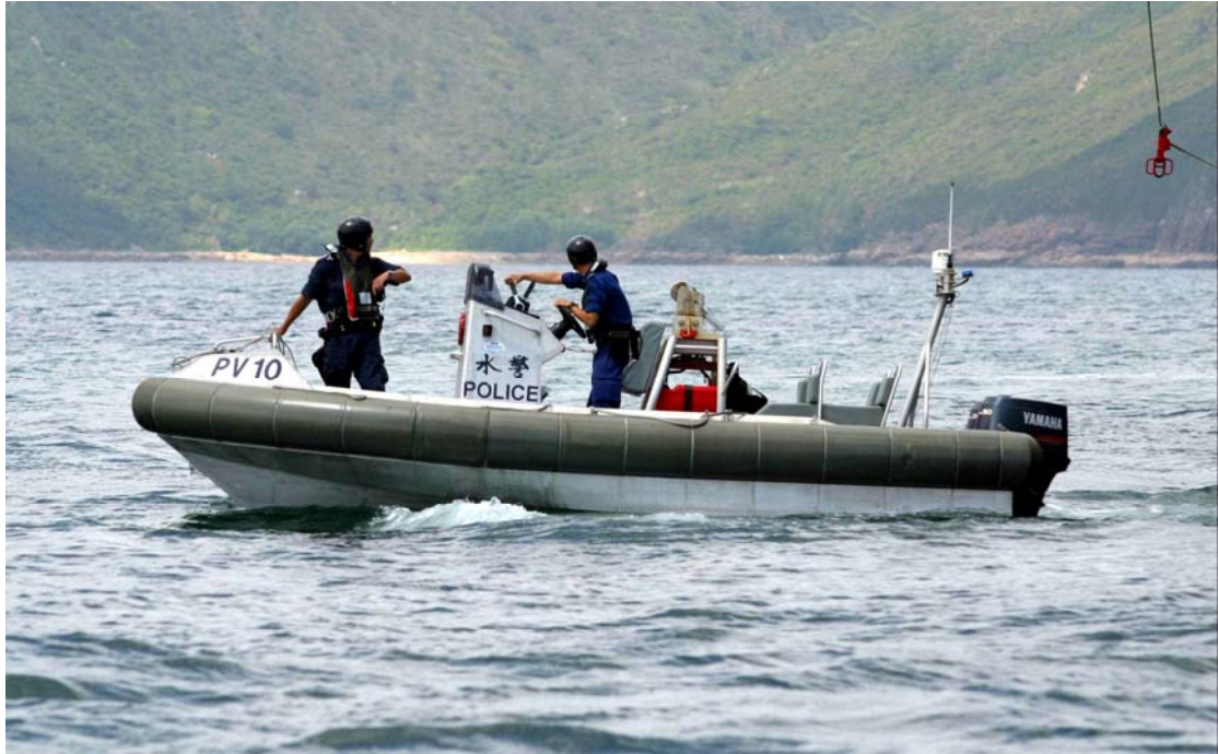
Police Vessel No. 10 Pursuit 640RH Police Launch Tender (In service since 2002)