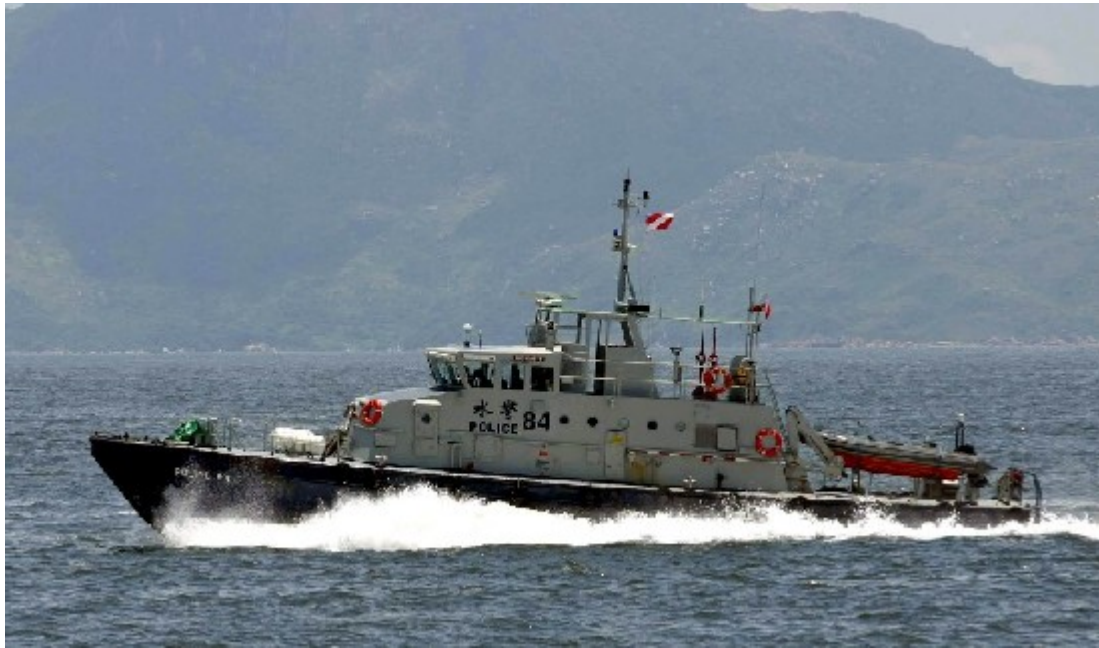
Police Launch No. 84 King Kan Damen Mark III Divisional Patrol Launch (1985 – 2010)