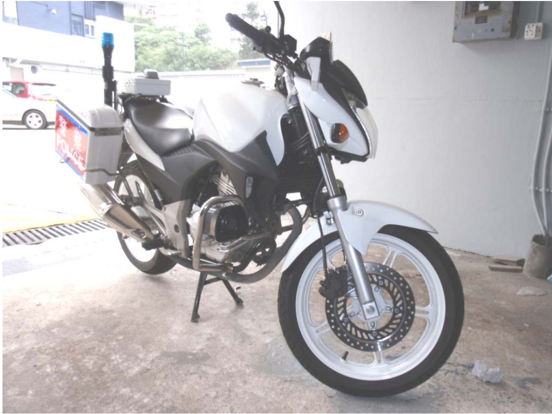
Motorcycle Small – Honda CB300R Used for patrol and traffic enforcement duties (In service since June 2011)