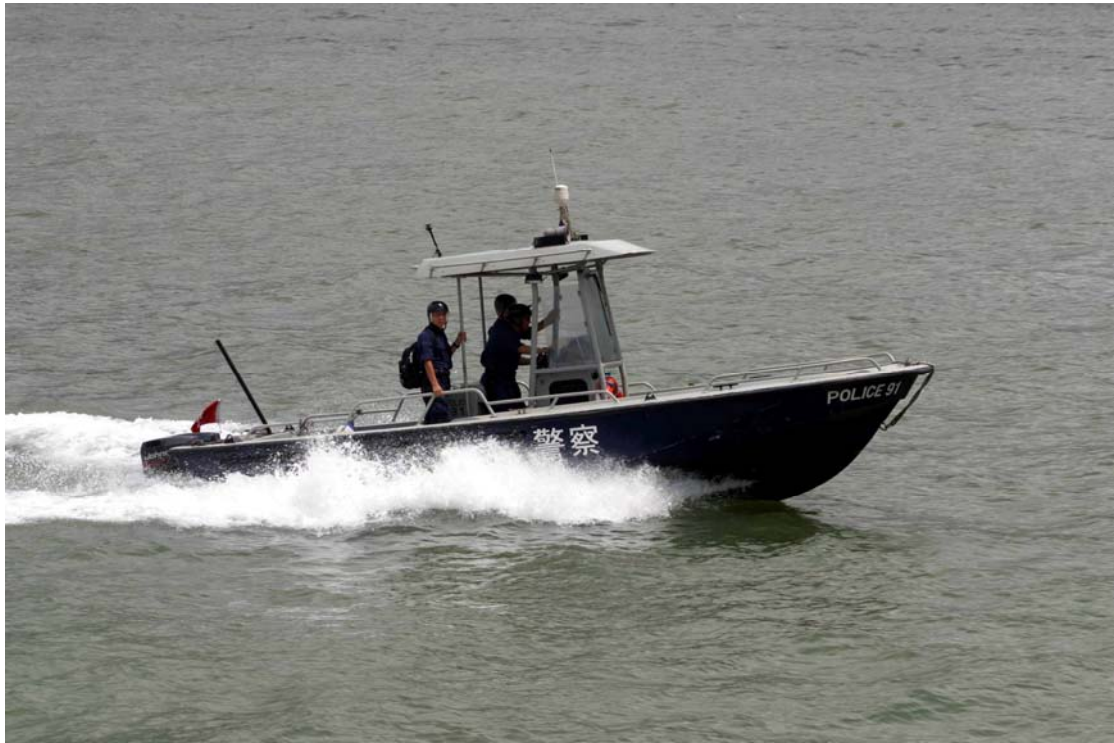
Police Launch No. 91 Boston Wharler 25' Inshore Patrol Launch (In service since 1997)