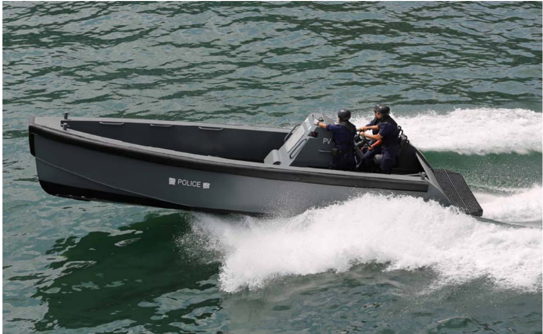
Police Launch No. 70 Shallow Water Craft (In service since 2015)