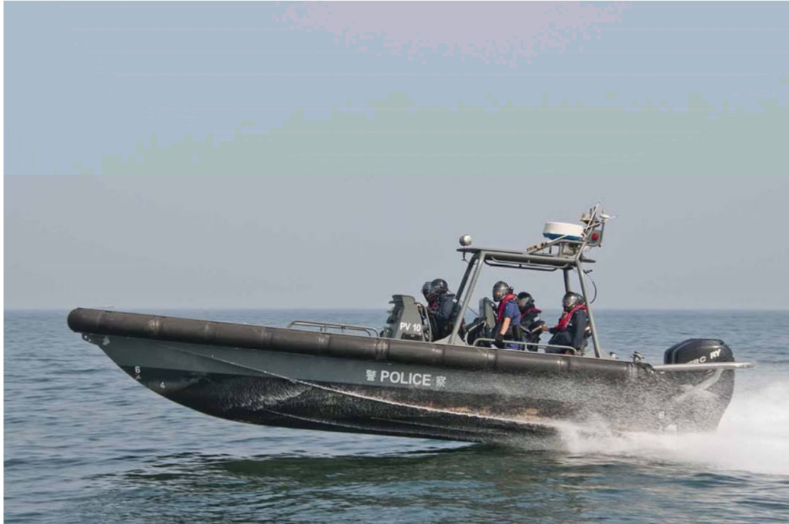
Police Vessel No. 10 Divisional Fast Patrol Craft (In service since 2008)