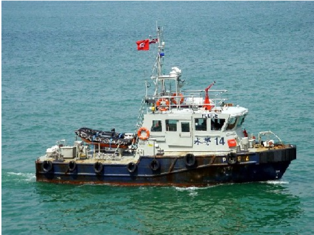
Police Launch No. 14 Tern Harbour Patrol Launch (1987 – 2010)