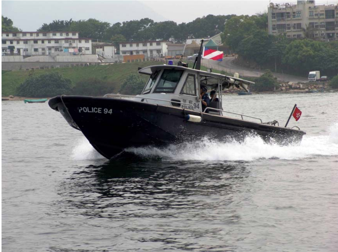
Police Launch No. 94 Boston Wharler 27' Inshore Patrol Launch (In service since 1997)