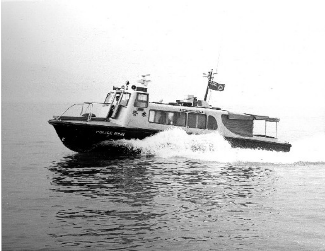
Police Launch No. 21 Swiftstream Deep Bay Water Jet Boat (1971 – 1986)