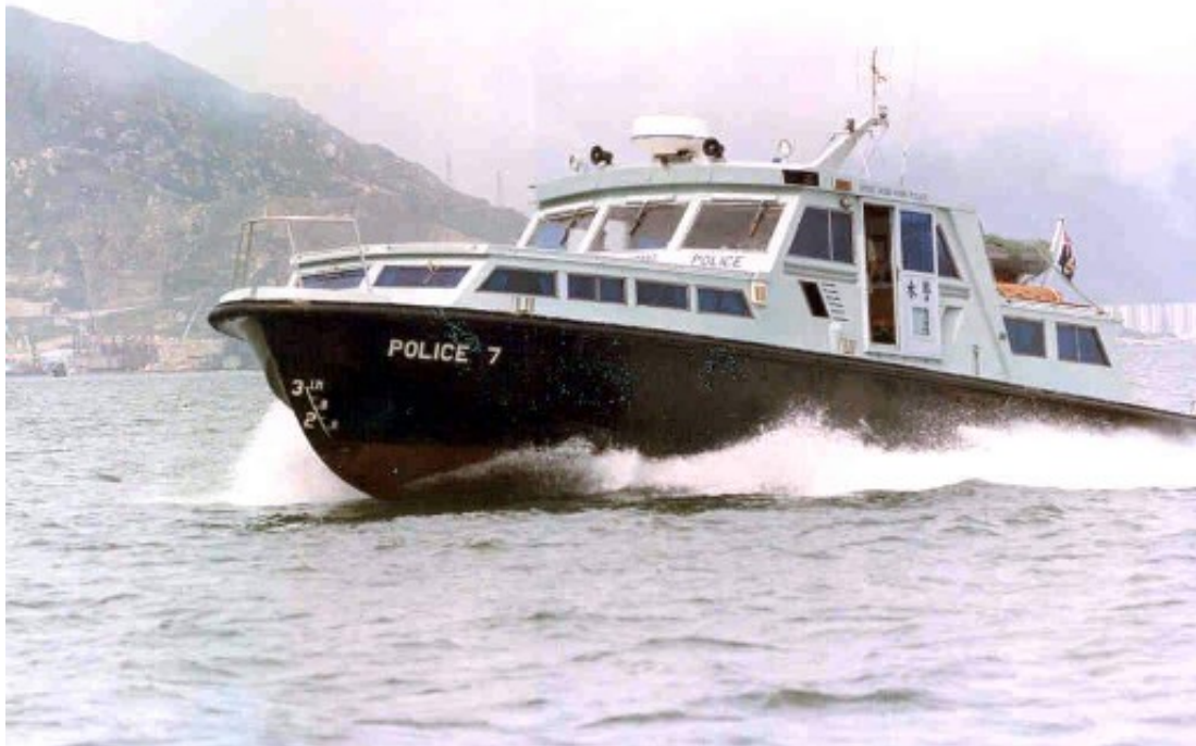
Police Launch No. 7 Dragon (The Commissioner's Barge) Logistic Launch (1975 – 1985)