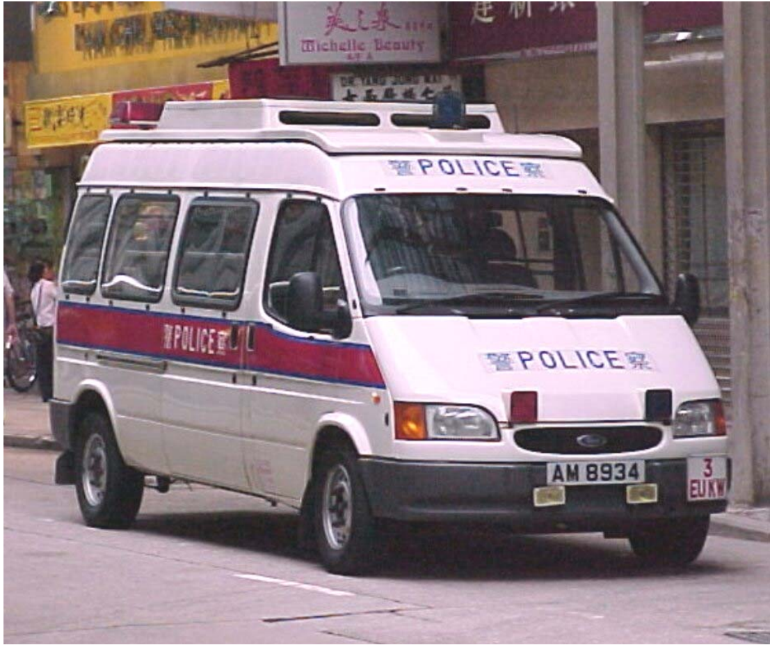
Van Large – Ford Transit 190 Used for patrol or operational duties (1998 – 2012)