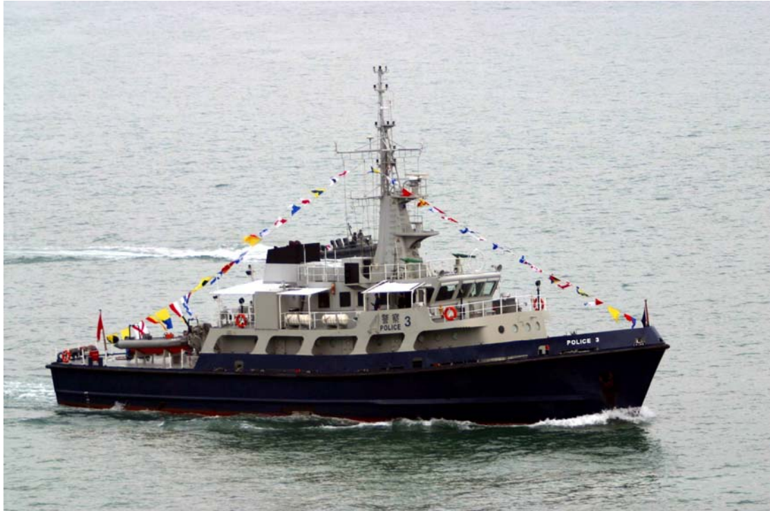
Police Launch No. 3 Sea Panther Training Launch (In service since 1987)