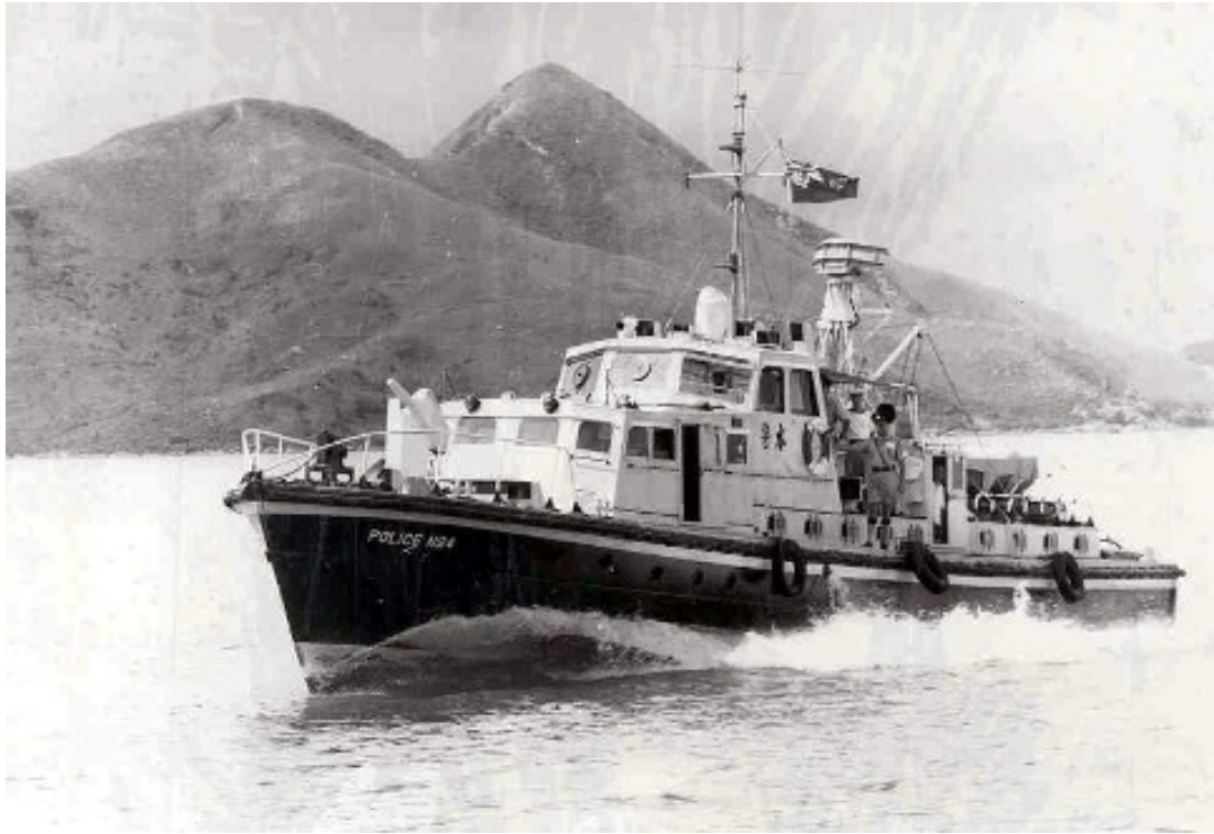
Police Launch No. 4 Sea Horse Command Launch (1958 – 1985)