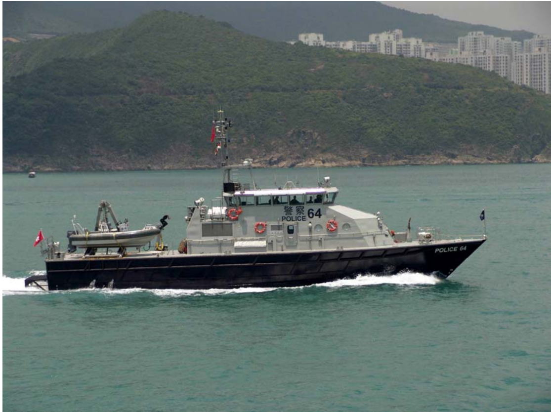
PL 64 Keka Mark II Divisional Patrol Launch (In service since 2005)