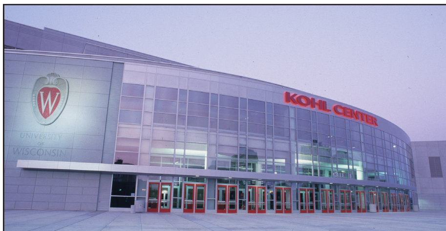
The Kohl Center at dusk