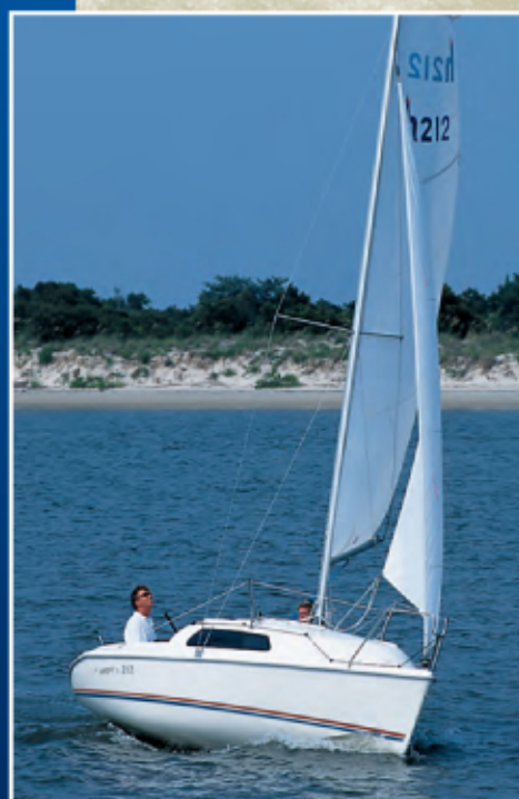
Easy To Sail with a Large Main and a Small Jib

Visit your nearest Hunter dealer and see how We Go The