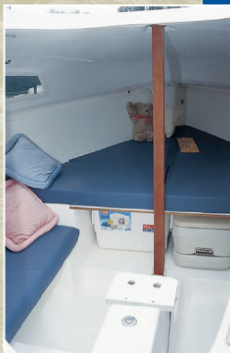
Sleeps Up To 4 — Options Include a Galley

T ake the rigging ease and performance of a daysailer, add the comfort and overnight capability of a mini-cruiser and make it easy to trailer: introducing the new Hunter 212. With the innovative, patented Advanced Composite Process, this new Hunter is both lightweight and extremely durable. Five times more impact resistant than fiberglass, this boat is tough, unsinkable and virtually maintenance free.