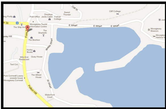
Figure 5 Mevagissey Harbour as shown on Google Maps (© Google, 2012)

In a report into the public accessibility of toilets, Knight and Bichard (2011) highlighted how, although information on the location of toilets is available, it is seldom available on common cartography (Figure 5) and is confined to specialist guides and/or maps. Currently, no publicly available professional information on accessible toilets is available for Mevagissey. However, over recent years there has been a surge of interest in county councils making this information available through open data, meaning that members of the public may access and utilise the information as they see fit, without paying any fees, yet cannot edit the data itself. This has led to the development of websites such as The Great British Public Toilet Map (Knight and Bichard, 2012) presenting open data on accessible public toilets, a model which in all feasibility could be made available on a national rather than regional level; see Figure 6.