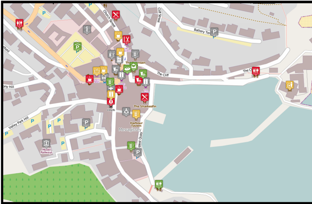
Figure 7 A Wheelchair Specific Access Map; Mevagissey, Cornwall (WheelMap, 2012)

In recent years, VGI projects such as ToiletMap ( www.toiletmap.co.uk ) and WheelMap ( www.wheelmap.org ) which address such issues have begun to emerge. Here, members of the public (predominantly wheelchair users) tag facilities and amenities for their accessibility and ability to provide toilet facilities via the criteria set out in Table 4.