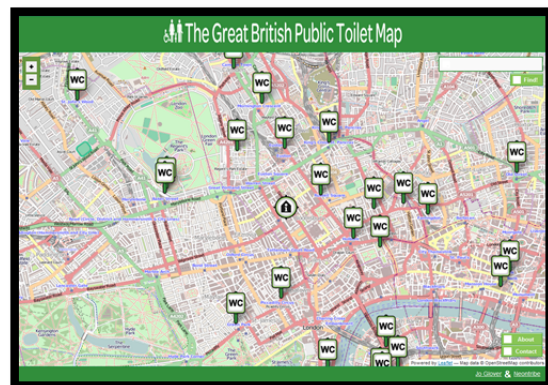
Figure 6 Wheelchair accessible toilets in London as shown on The Great British Public Toilet Map; TGBPTM (Knight and Bichard, 2012)

Knight and Bichard (2011) highlighted how the access to the toilet facilities extends beyond the facility itself and into the surrounding area (e.g. barriers preventing access to the toilet), the condition of the toilet facilities (e.g. cleanliness) and their entrance fee. Many cafes and stores also provide accessible toilets, and being privately operated would not appear on professional information data sets. Additionally, the number and condition of toilets change over time. When this is considered alongside the often limited currency of the professional information (Parker et al., 2012a), it shows the traditional reliance on professional data sources may be of limited utility in this specific instance.