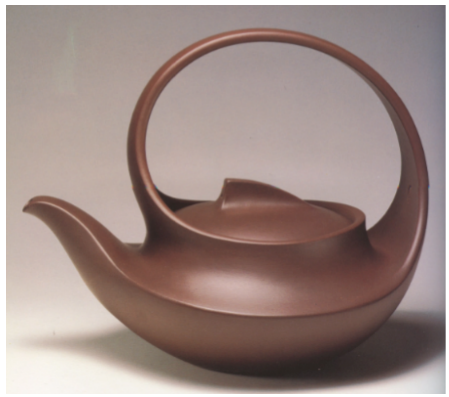
Figure 9. Curve Teapot, Wang Yinxian and Zhang Shouzhi, 1988

the material of purple clay gives me great possibility and freedom to pursue a variety of creative themes and a tool to express my feelings."56