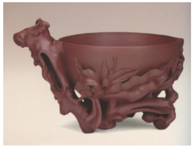
Figure 7. Peach Cup, Wang Yinxian, 1974 (Image courtesy of the artist)