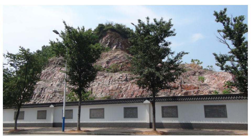
Figure 2. Yellow Dragon Mountain The protected mining site of purple clay material in Dingshu Town, Yixing

whole body of the pot giving Yixing purple clay teapots their unique "absorbing" and heat retention properties. Because of these characteristics, all utensils made with this source of clay command a higher premium than normal clay. Beside the permeability of the material, this particular clay found in Yixing also comes in a variety of rustic colors in purple, red, white, yellow and green. The most commonly found ore is a light purple or brownish red color, which is why all clays with this property are referred to as 'purple clay.' The unique material qualities have made purple clay a special commodity.