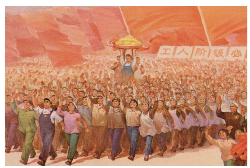
Figure 6. Chairman Mao's Mangoes poster, 1968

about Mao showing his symbolic support to the workers by gifting them mangoes to end the factional fighting among the Red Guards in 1968.<sup>46</sup> In demonstration of Mao's power and favor, worshiping the mangoes given by Mao became the strangest mass rallies and parades during the Cultural Revolution. The mango propaganda posters and badges of Chairman Mao and the workers' fanatical worship and responses transformed the mango into a strangely powerful symbol during this time.<sup>47</sup> Despite using the mango's image, Jiang Rong's Mango Teapot is more parody than promotion. The pot comments on the shifting social beliefs from the ideological fetishism of Mao's era to the commodity fetishism of post-Mao China. Jiang Rong's Mango Teapot quietly but subversively forces viewers to critically reflect on Chinese history and Mao's revolutions.