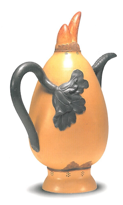
Figure 4. Lotus Wine Vessel, Jiang Rong, 1965

- 2008) aims to encapsulate relationships between humanity and nature by employing imagery from the natural world. Yixing purple clay pottery has been dominated by the geometric style (favoured by the scholarly elite class since the Ming dynasty), and minimalistic pottery was often considered high art, while naturalistic pottery was deemed low art filtered through common taste. <sup>44</sup> Jiang Rong spent a lifetime challenging these stereotypes with her works. As the only female master potter in Yixing during the 1950s and the 1960s, Jiang Rong unflinchingly and enthusiastically created her naturalistic works and theatrical narratives inspired by the environment around her: the lotus flowers, frogs, cattle, pumpkin, water chestnut, fruits, butterflies, and toads.