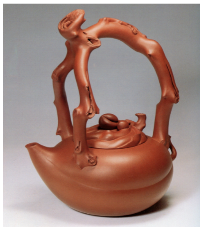
Figure 8. Peach Teapot, Wang Yinxian, 1990