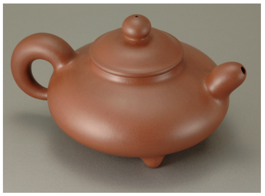
Figure 12. Tripod Teapot, He Daohong, 2004

spout and knob contrast the aerodynamic handle. The entire form is composed with the contradictions between open and closed, tension and relaxation, centralization and decentralization. Cute and subversive, the teapot beckons users with wit, irony, and visual charm.