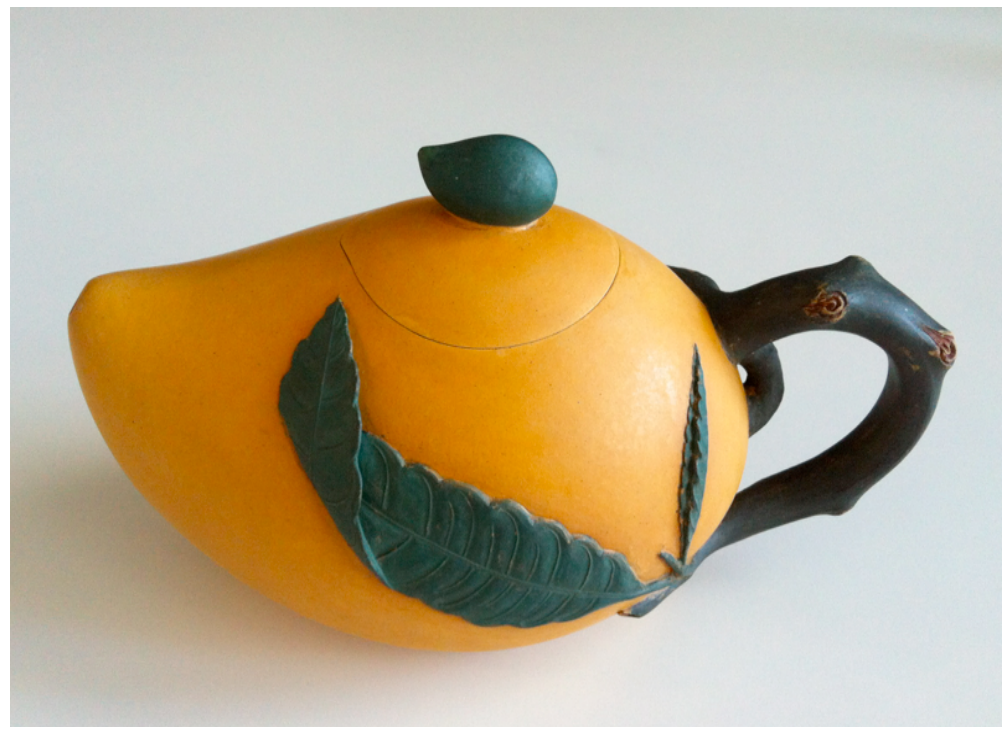
Figure 5. Mango Teapot, Jiang Rong, 1991

adding water onto Chinese ink stones during calligraphy and painting. Jiang Rong borrowed an old idea to create a newly designed wine vessel, which provides an elegant and playful experience for its beholders.