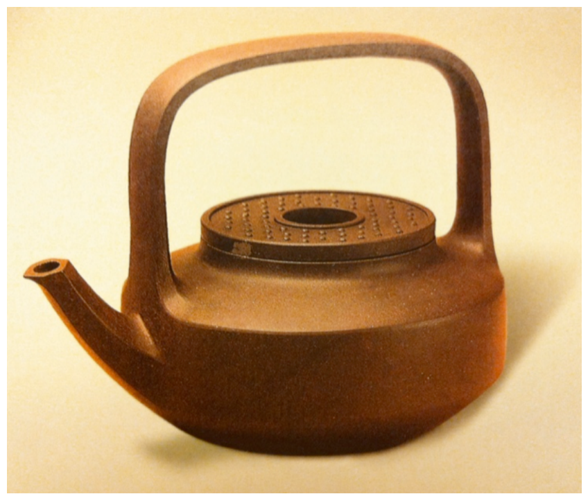
Figure 3. Wheel Jade Teapot, Gu Jingzhou, 1979

Inspired by the design of ancient wheel jade, the body, lid, and knob of the teapot compose the circles on the flat surface of a wheel jade but in functional three-dimensional form. The design of an overhead handle reinforces the effectiveness of the wheel jade from the viewer's perspective while holding and examining the work from above. At the same time, the loop handle creates a negative space with rounded corner framing the most elegant part of the design: the lid and the empty hole as the knob popping up from the body. This humble object evokes a feeling of balance and tranquility, a Chinese pastoral aesthetics that is rooted in the pre-modern agricultural and handicraft society. Intellectuals and scholars influenced by ancient Chinese philosophies believed that the ideal personality of human should be akin to the admired natural qualities of jade: gentle