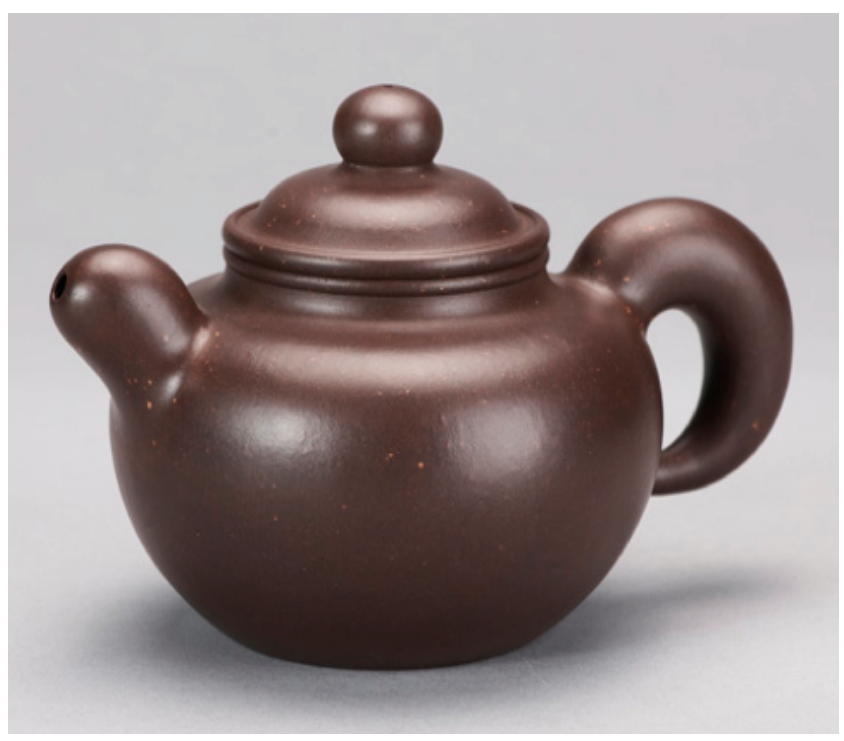
Figure 11. Di-li Teapot, He Daohong, 1990

eagerness in forms full of energy and accelerated motion. Unlike the traditional works that represent a delicate balance or a feeling of tranquility rooted in imperial taste, this work represents a break with the past and symbolizes a sense of openness, ambitiousness, and masculinity reflective of contemporary China.