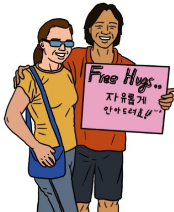
FREE HUGS KOREA

Hebrew: חיבוקים חינם Hungarian: Ingyen ölelés Icelandic: Ókeypis Faðmlög Indonesian: Pelukan Gratis Irish: Barróg Saor Italian: Abbracci Gratis Japanese: フリーハグズ Korean: 자유롭게 안아드려요.