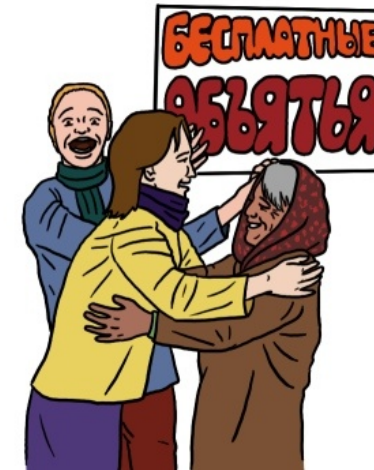
FREE HUGS RUSSIA

Russian: Бесплатные объятия Slovak: Objatie zadarmo Slovenian: Brezplačni objemi Spanish: Abrazos gratis Swedish: Gratis Kramar Tagalog: Libreng Yakap Thai: กอดฟรี Turkish: Bedava Kucaklama Ukrainian: Безкоштовні обійми Vietnamese : Ôm miễn phí/ Ôm tự do Welsh (Cymraeg): Cwtsh am Ddim