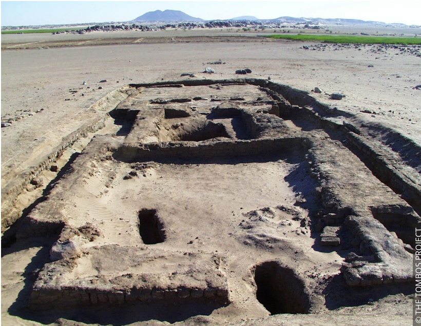
The foundations of Siamun's pyramid; one of ten in the elite Tombos cemetery.