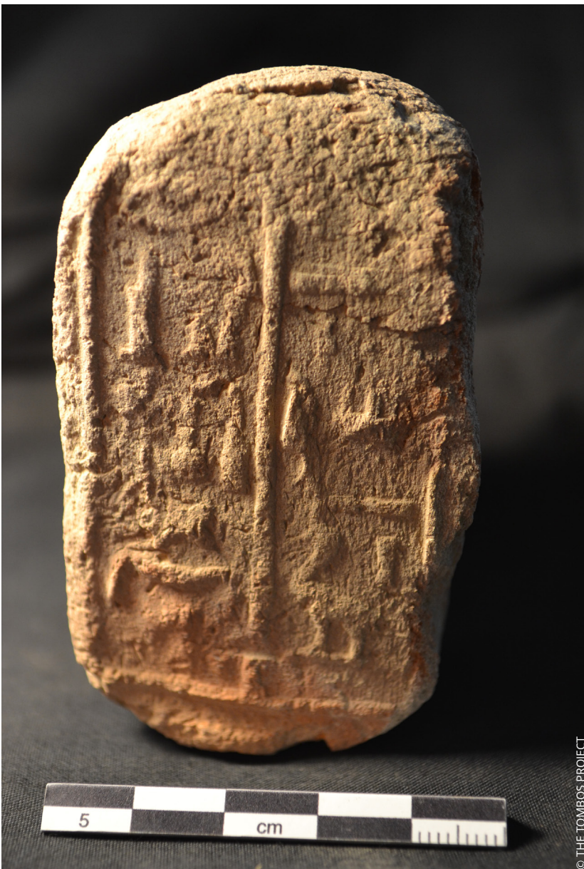
A rectangular funerary "cone" belonging to the Tombos official, Siamun.

As soon as pyramids fell out of royal favour (at the start of the New Kingdom, around 1550 B.C.), wealthy nobles began to include mud brick pyramids as a part of their tombs. The practice quickly spread to Nubia as colonies were established, further and further south. The first pyramids at Tombos were built in the mid-18th Dynasty when the colony was founded, around the reign of Thutmose III.