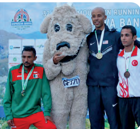
Individual senior men