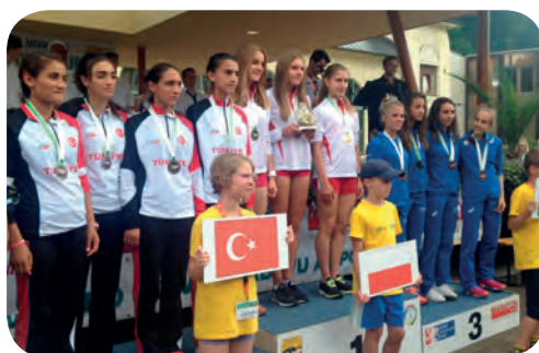
Girls team podium

positions. The group of Turkish run most part of the race all together and at the end the first four places finished with a total gap less than half minute. Winner Alkanoglu clocked 26:19; Orhan Ozturk, second, finished with time of 26:21; İbrahim Ozevin, third, with time of 26:40 and Veysel Tumincin finished fourth with time of 26:43.