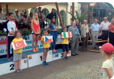
Girls individual podium