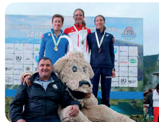
Individual senior women