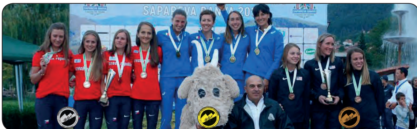
Senior Women Teams, from left to right: CZE (2nd), ITA (1st), USA (3rd)