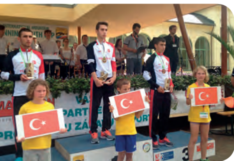
Boys individual podium