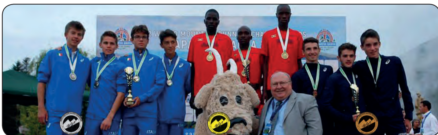
Junior Men Teams, from left to right: ITA (2nd), UGA (1st), FRA (3rd)