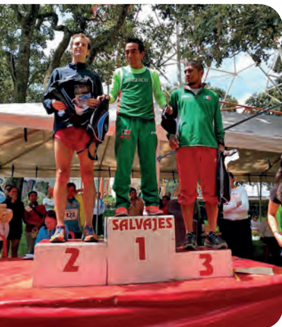
Mens Winners Podium