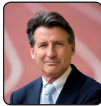
Sebastian Coe