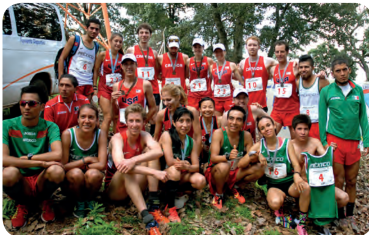
National teams participating