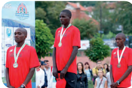
Individual junior men