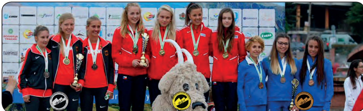
Junior Women Teams, from left to right: GER (2nd), CZE (1st), ITA (3rd)