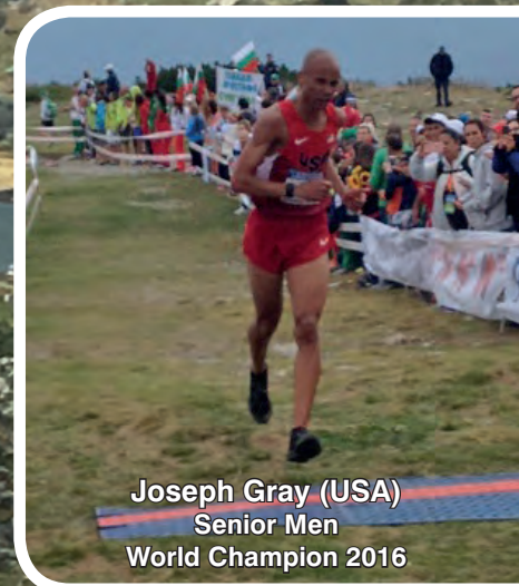
Joseph Gray (USA) Senior Men World Champion 2016