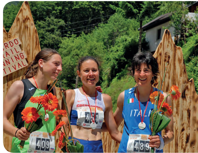
Women flower ceremony