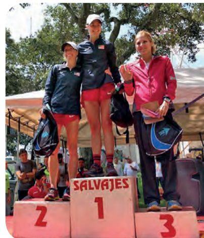
Womens Winners Podium