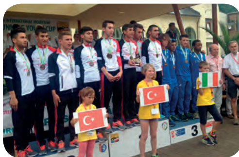
Boys team podium