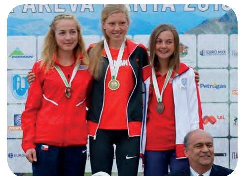
Individual junior women