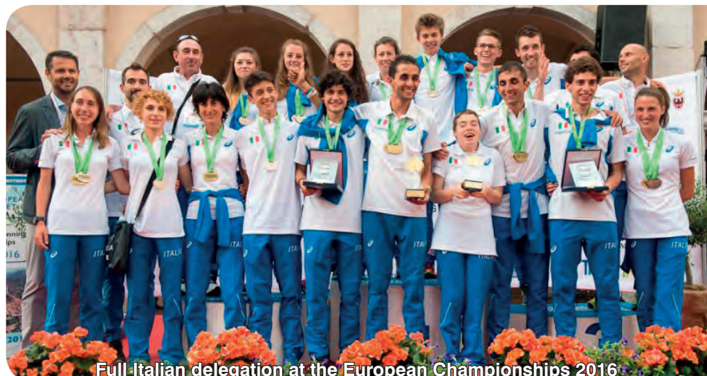
Full Italian delegation at the European Championships 2016