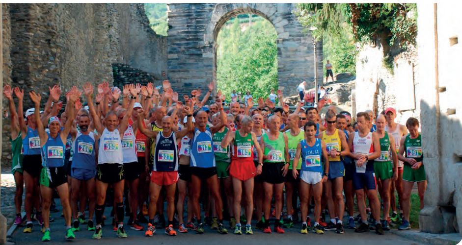
Start of M55-60