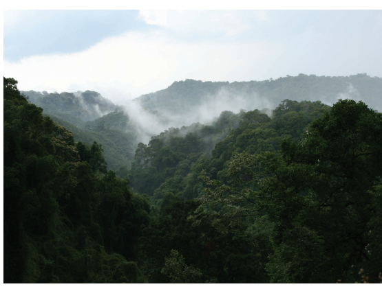
Forest in Xieng Khouang