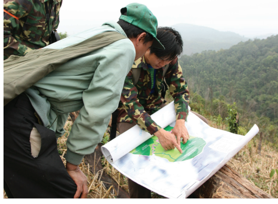
Village forest management planning in Ban Lou, Samneua District, Houphan Province

Implemented by the Lao Ministry of Agriculture and Forestry, the project is one of the first in Laos to introduce REDD+. While Germany is among the main providers of bilateral incentives within the context of REDD+, funds derived from results-based mechanisms are expected eventually to replace this support.