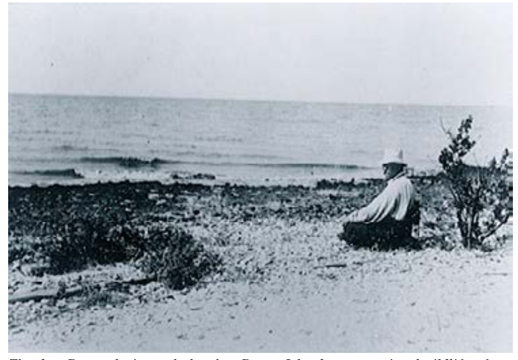
Theodore Roosevelt sits on the beach at Breton Island, now a national wildlife refuge in Louisiana.

ALASKA, NORTH AMERICA'S SERENGETI ||1983 The state of Alaska dwarfs the rest of the country's biggest states by a magnitude of five or more. Before statehood in 1959, Alaska contained a few parcels that were designated as wildlife reserves for sea birds, waterfowl, and moose. But the majority of the state's vast tracts of untouched boreal forests, bogs, mountain peaks, and tundra had yet to be fully explored. Land settlement was widely disputed during the state's infancy and in an effort to settle the state, Congress passed the Alaska Native Claims Settlement Act of 1971 (ANCSA), an outgrowth of the Alaska Statehood Act. This law incidentally became of enormous importance to the NWRS. Among numerous other provisions, it authorized the addition of immense acreages of highly productive, internationally significant wildlife lands to the NWRS. Specific lands to be added to the Refuge System. along with other far-reaching resource protection measures for Alaska, came later in 1980 with the passage of the Alaska National Interest Lands Conservation Act (ANILCA).