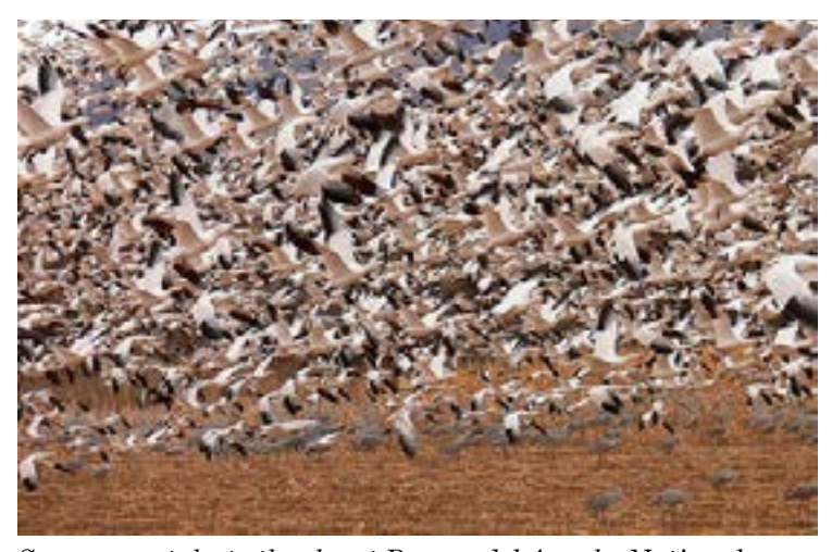
Snow geese take to the sky at Bosque del Apache National Wildlife Refuge, New Mexico.

REFUGE RECREACTION ACT, (16 U.S.C. 460K-460K-4). PUBLIC LAW 87-714, APPROVED SEPTEMBER 28, 1962, (76 STAT. 653) AS AMENDED BY PUBLIC LAW 89-669, APPROVED OCTOBER 14, 1966, (80STAT.930) AND PUBLIC LAW 92-534, APPROVED OCTOBER 23, 1972, (86 STAT. 1063). Authorizes the Secretary of the Interior to administer refuges, hatcheries and other conservation areas for recreational use, when such uses do not interfere with the areas primary purposes.