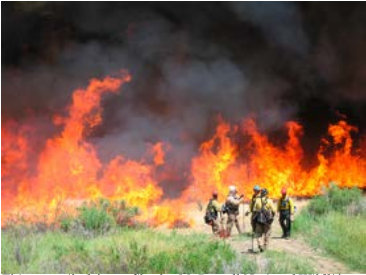
This prescribed fire at Charles M. Russell National Wildlife Refuge in Montana is part of a fire management strategy to conserve and enhance wildlife habitat.

fire. We employ about 360 permanent fire professionals, along with about 100 seasonal and temporary fire employees during fire season. More than 1,400 Service employees are qualified to assist with wildland fire management activities. The annual fire program budget is approximately $60 million.