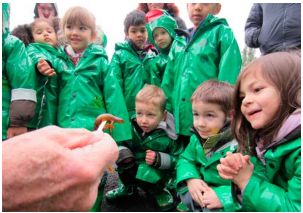
Children at Tualatin River National Wildlife Refuge in Oregon meet a rough-skinned newt.

No matter your background, interests, or geographic location, the Refuge System invites you to join us in stewarding refuges through volunteering, joining a Friends organization, or becoming part of a community partnership effort.