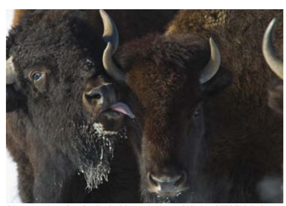
Bison were introduced to Rocky Mountain Arsenal National Wildlife Refuge, Colorado, in 2007.

Providing a healthy and complete National Wildlife Refuge System, as envisioned by past generations of conservationists, would stand as a treasured testament to the nation's ability to pass on a lasting natural legacy to future generations. We invite you to join us as we strive to make the National Wildlife Refuge System the best that it can be.