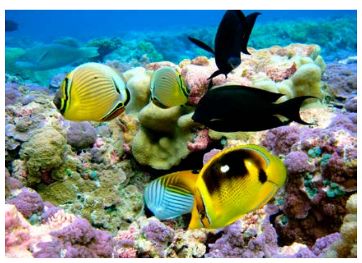
Butterfly fish, tangs, and parrot fish swim around coral at the marine national monuments managed by the Refuge System in the Pacific Ocean.

FY 2014 HIGHLIGHT The Refuge System's 12th decade began with the same emphasis of decade 11, namely the protection of marine environments in the Pacific. On September 25, 2014, President Obama issued Proclamation 9173, which expanded the Pacific Remote Islands Marine National Monument. This expanded protection of Marine National Monuments from about 212 million acres to a more expansive 473 million acres. This includes 54.7 million acres within 12 national wildlife refuges and 418 million acres outside national wildlife refuge boundaries. The 418 million acres of marine national monument located outside refuge boundaries are managed by the Service in consultation with the Department of Commerce and the State of Hawaii.