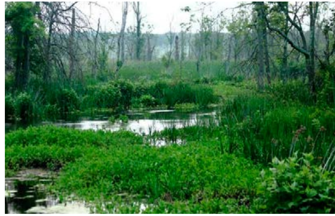
Great Swamp National Wildlife Refuge Wilderness in New Jersey was the first designated wilderness in the Refuge System under the Wilderness Act of 1964.

By the end of the Refuge System's 8th decade, this collection of conservation lands was strengthened by being entrusted with immense world class conservation treasures within Alaska, including the international Porcupine caribou herd of Arctic National Wildlife Refuge, the teaming seabird populations of Alaska Maritime National Wildlife Refuge, and the world-class sport salmon fishery on Alaska Peninsula and Kenai National Wildlife Refuges. By the end of its 8th decade, the Refuge System had grown to include 625 units (418 refuges, 149 waterfowl production area counties in 29 wetland management districts, and 58 coordination areas) in 50 states and four territories. The NWRS protected a total of 88.9 million acres of lands and waters including 12.4 million acres in the lower 48 states and 76 million acres in Alaska.