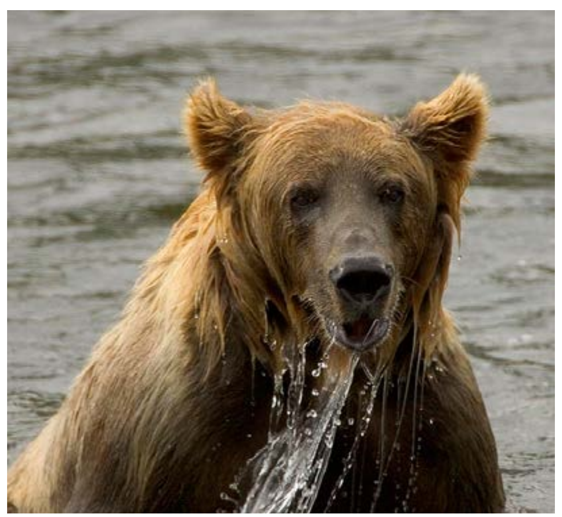
A brown bear emerges from salmon fishing in the Kodiak National Wildlife Refuge in Alaska.

WORLD HERITAGE SITES: World Heritage Sites are designated by the United Nations Educational, Scientific and Cultural Organization (UNESCO), which seeks to encourage the identification, protection and preservation of cultural and natural heritage sites around the world that are considered of outstanding value to humanity. This is embodied in an international treaty called the Convention Concerning the Protection of the World Cultural and Natural Heritage, adopted by UNESCO in 1972. There are 1,007 designated World Heritage sites and 22 in the U.S.