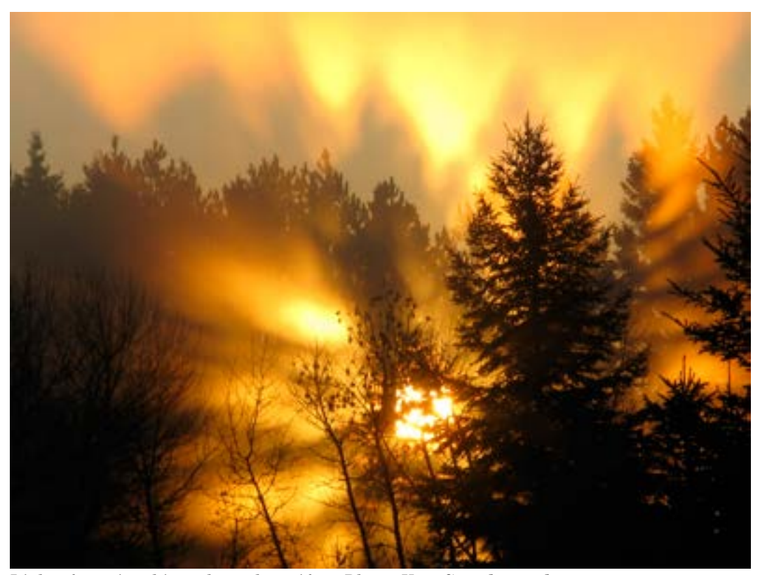
Light of sunrise shines through conifers.

Between 2008 and 2010, the NWRS embarked on a strategic visioning process to identify new ways to accomplish our mission amid broad social, political, and economic changes. The process resulted in development of 24 recommendations, which are contained in Conserving the Future: Wildlife Refuges and the Next Generation , completed in 2010. Every partner, program, and refuge plays a dynamic role in implementing the recommendations. The strategic vision provides a path forward over the next decade and is crafted around three central themes: wildlife and wildlands; a connected conservation constituency; and leading conservation into the future. The Conserving the Future document and associated materials may be accessed at www.fws.gov/refuges/vision