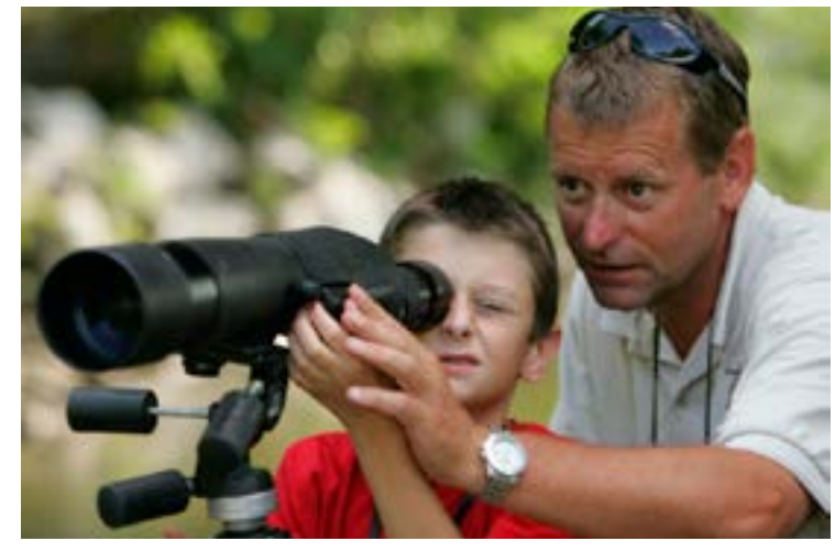
Father and son birdwatchers use a spotting scope at Big Muddy National Wildlife Refuge, Missouri.

REFUGE LAW ENFORCEMENT: The Refuge System employs a cadre of professional law enforcement officers dedicated to natural resource protection and public safety. The Refuge Law Enforcement function provides training, equipment, and management of the System's full-time officers, collateral duty officers, and regional and Headquarters management support staff. Federal wildlife officers also contribute to community policing, environmental education and outreach, and protection of native subsistence rights, as well as other activities supporting the Service's conservation mission. Federal wildlife officers are routinely involved with the greater law enforcement community in cooperative efforts to combat the nation's drug problems, address border security issues, and respond to emergencies such as major hurricanes and other pressing challenges.