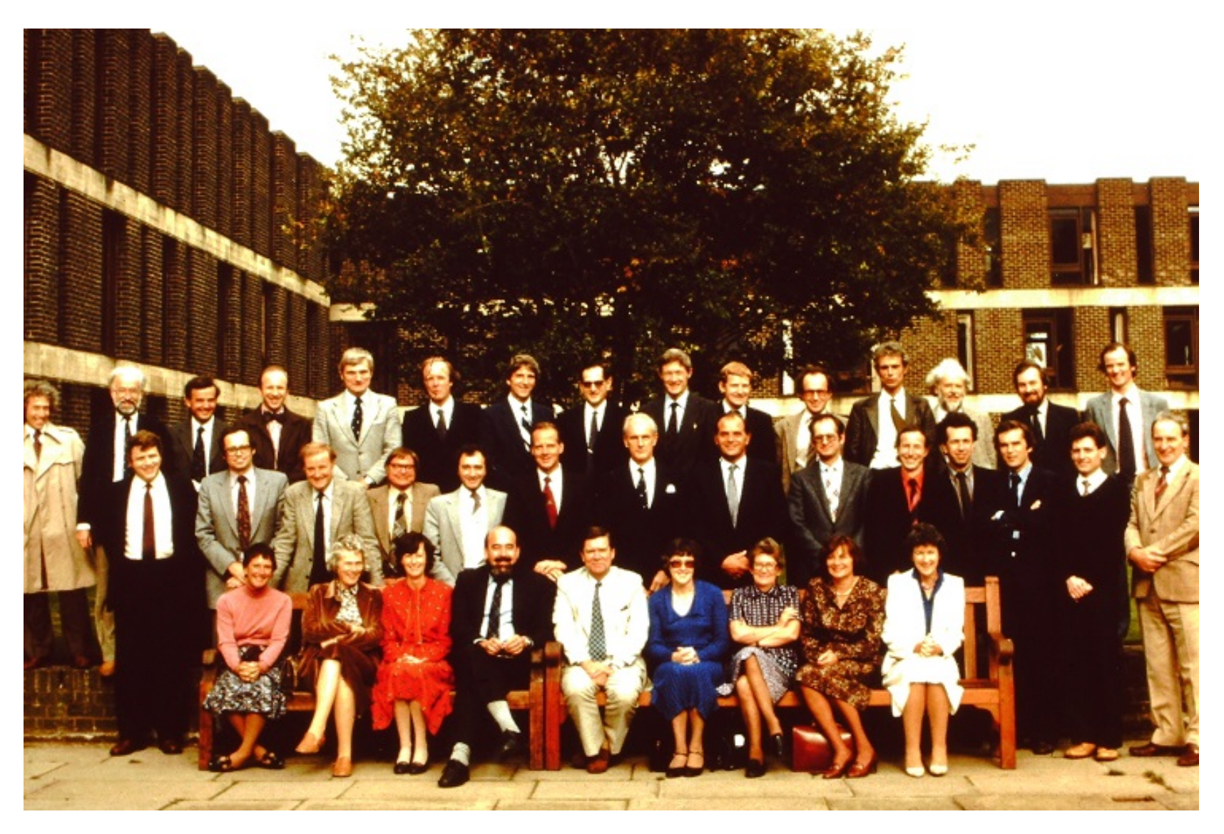
Figure 3. BAPM Officers and Council Members, Cambridge, 1981

Founding the British Association of Perinatal Medicine in Bristol in 1976* WEMJ Volume 116 No.1 Article 2 March 2017