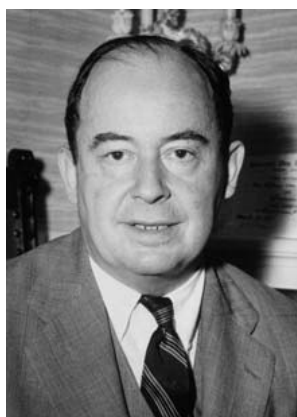
John von Neumann, elected 1944.

Career description: Applied mathematician; Aerodynamicist; Educator; Research institution administrator