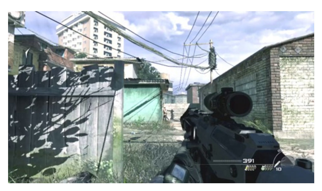
Ducking between the city's densely connected buildings while under heavy gun fire. Call of Duty: Modern Warfare 2 (Infinity Ward, 2009).

Max Payne (Remedy Entertainment, 2001), a game in which the player travels on foot, follows the classic video game structure of the level-based labyrinth. Scholars who have written about the arrangement of game space commonly refer to this kind of labyrinth or maze in their work. Often conflated, a functional distinction can be made between the two. The labyrinth can be seen as a winding path which delays travel to a geographically near location, while the maze is a challenge of spatial navigation.<sup>28</sup> In the two-dimensional screen of cinema, the labyrinth is turned into the locations of action such as car chases, shootouts, and the linear arrangement of obstacles.<sup>29</sup> They are spaces with a single exit and single resolution. While some games follow this path, others employ a different arrangement. Nitsche lists Umberto Eco's three labyrinth types—linear (unicurusal), branching (multicursural), and rhizomatic—while introducing a new type unique to video games: the logical maze of changing access in which following procedures opens up new paths.<sup>30</sup>