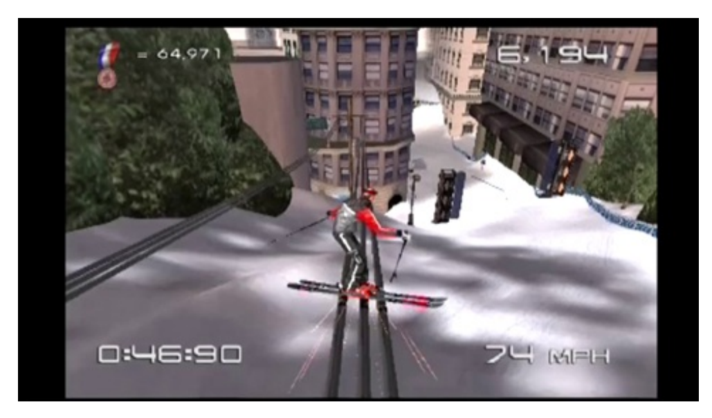
An amalgam of San Francisco's landmarks and notable architecture, repurposed for downhill jamming on skis. Jonny Moseley's Mad Trix (3DO, 2001).

using the spaces they create. This results in, among other things, hideous architectural alterations intended to prevent skating."52 Videogames cities are worlds that re-enable skateboarding mobilities.