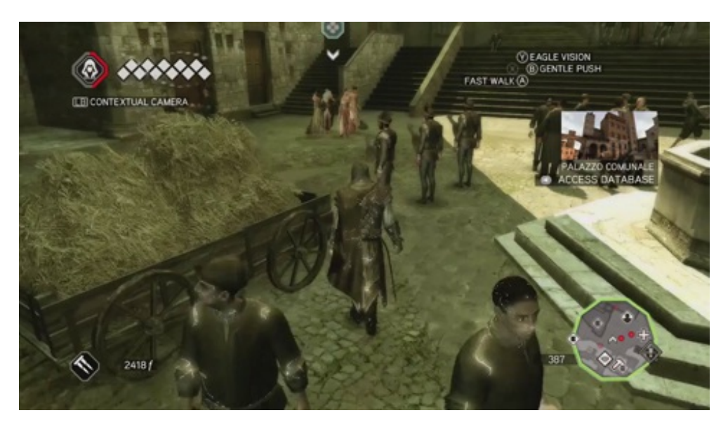
The player navigates their way through the sea of pedestrians. Assassin's Creed II (Ubisoft Montreal, 2009).

are no longer applicable, the prosaic act of walking normally subverts the player's exceptionalism. The player, in these cases, experiences the same streets as the wandering crowds of A.I. characters.