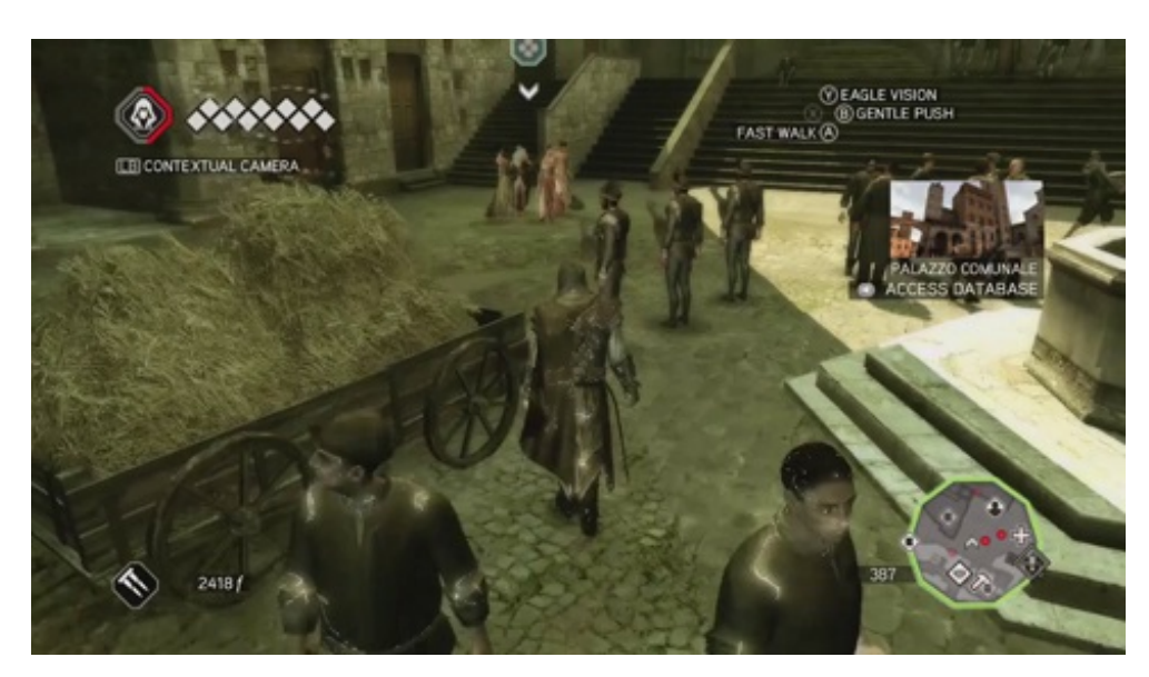
Trane scales elevated subway girders to tag a surface with high visibility. Mark Ecko's Getting Up: Contents Under Pressure (Atari, 2006).

Climbing to specified vantage points around the city also lets the player create an image of the environment. The game indicates that from the top of these towers, church steeples, and guardposts the player is able to take in the surrounding view. Players then "synchronize" with the space and the area around them is filled in on their map. This process runs contrary to de Certeau's criticisms that it is not atop the World Trade Center that New York reveals itself but on its sidewalks and streets.<sup>59</sup> While perching precariously and synchronizing with the surroundings may not reveal much about the culture or people, from a mapping standpoint it is reasonable to assume that surveying a space creates an image of the geography and architecture. While the average person may be able to take the stairs or an elevator to enjoy the vistas of tall buildings, it's the acrobatic parkour mobilities of the Assassin's Creed protagonists that turn every ledge into a stepping-stone and every wall into a ladder.