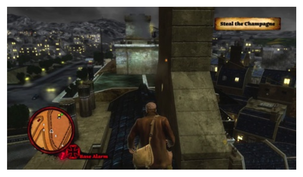
Nazi occupied Paris becomes a city about moving around without attracting attention. Climbing buildings and sneaking through the streets are the motilities of resistance. The Saboteur (Pandemic, 2009).

Motility affects expectations of the organization of in-game activities: racing across town to break up a drug deal, climbing a building to get a view of the area, skateboard grinding a telephone wire, parachuting onto the roof of a moving subway car. It enables (or constrains) where the player can go and what they can do. Game designers often use space to guide the experience of important portions of games<sup>13</sup> such that the organization of where activities take place significantly impacts the perception of space. Not only do players map spaces geographically, but more importantly, they map them in terms of activity flow (the juxtaposition of accessible areas and pursuit of game goals). <sup>14</sup> Kevin Lynch explains the urban experience similarly, identifying the "pattern of a whole" as problematic: