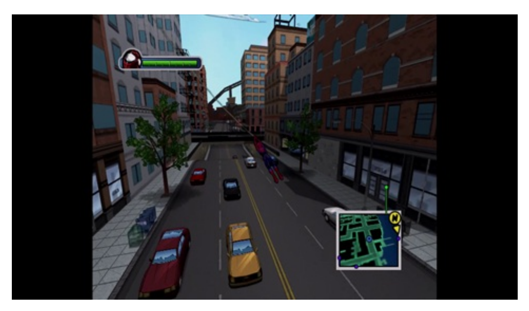
The player swings through the streets of New York City on the way to the next mission. Ultimate Spider-Man (Treyarch, 2005).

Spider-Man can also web-zip, a technique in which the player shoots a line of web straight ahead and pulls themselves quickly toward that point. This can be used on the surface level street to move faster, on the tops of roofs to help jump from one to the next, or on the sides of buildings as the player scales them vertically. Swinging and web-zipping are fast modes of movement: the player can travel at rates faster than the cars on the ground. These skills also re-orient the perspective of the player a city-dweller. Moving between two points along the streets of Manhattan requires making multiple turns, but Spider-Man's body is capable of ascending to the rooftops where he can follow a more direct route in which buildings are no longer barriers. The player learns a new language for traversing the city that extends from Spider-Man's motility, occupying familiar space in a new way.