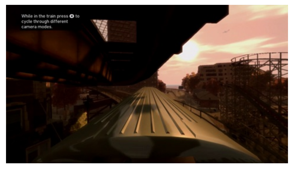
Niko Bellic takes the subway while the player cycles through camera views. Grand Theft Auto IV

Turning back to automated forms of travel that are grounded in game bodies, it is an unusual circumstance to have something else move the player in a game where they are normally in control. In Grand Theft Auto IV , the player can hop in the back of a taxi and direct the driver to a destination, choosing to either sit and experience the full drive or skip instantaneously to the desired location. Some cabbies will converse with Niko Bellic, while others just let the radio play. Sitting in the back seat, the player, in a first person perspective, can move their head around to look out the windows or over the front seats across the hood. Unlike other vehicles, which require concentration on the road, this provides an opportunity for the player to take in the sights of the city. While not meaningful in terms of the specific use of these traveled spaces, observation helps form a cohesive image of the city and its