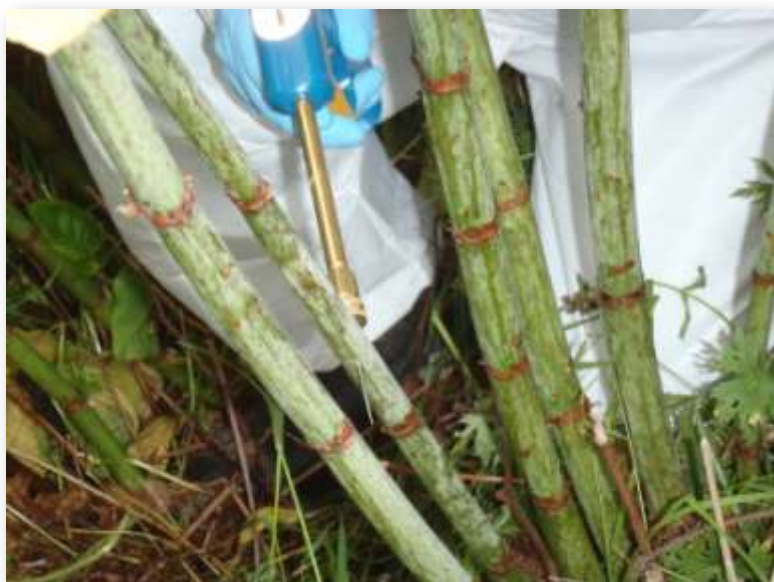
Site 1 - Stem injection type A