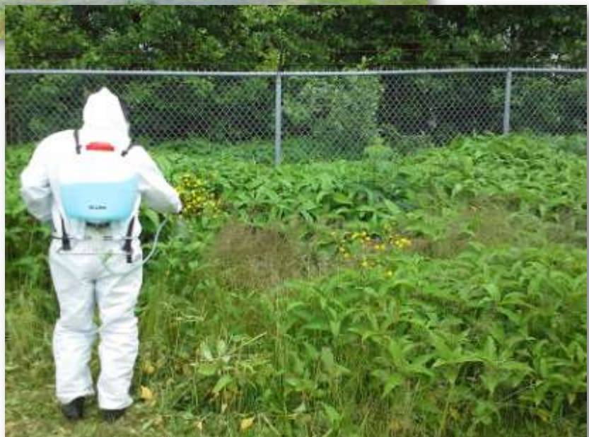
Site 3 - Foliar spray