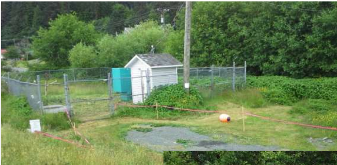
Site 3 - ribboned off