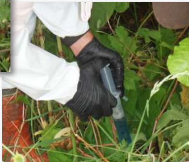
Site 1 - Stem injection type B