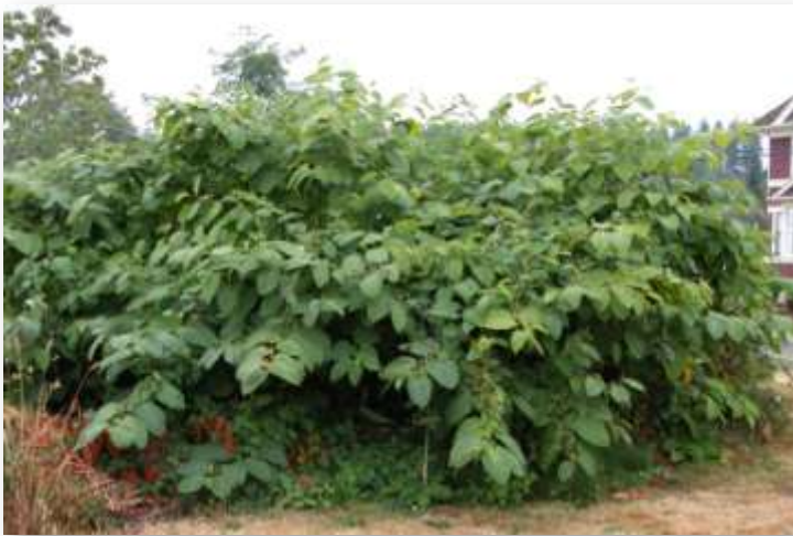
Japanese knotweed infestation

Knotweed species have been reported to be present on Haida Gwaii since 1957 (Mike Cheney 2007). The species present include Himalayan Knotweed ( Polygonum polystachyum ), Japanese knotweed ( Fallopia japonica ) and recently confirmed Bohemian knotweed ( F. x bohemica ). Infestations of knotweed are found mainly in the settled areas of Haida Gwaii on private, federal and provincial Crown lands. These sites threaten both infrastructure and the environment on Haida Gwaii as many of the sites are located directly adjacent to roadways, utilities (water and sewer lines and pumping stations) and waterways.