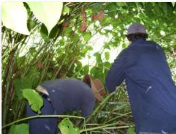
Cutting knotweed has not been an effective control measure

point where the plants could no longer tolerate it and they died. Salt water treatments outside of the shoreline are not practical due to distance and not suitable for non-shoreline sites as the soil will be negatively affected by the increased salt concentration. A number of different techniques to smother the plants were also attempted. These treatments have suppressed the knotweed beneath the covering but plants continue to appear on the edges. Mowing and cutting techniques have had little to no effect on the plants.