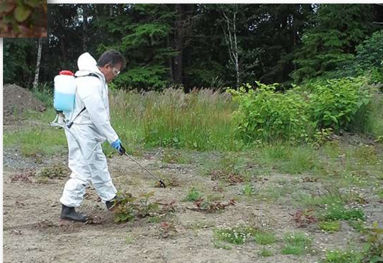
Site 1 - Foliar spray