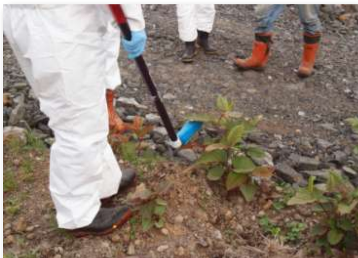
Site 1 - Wipe-on