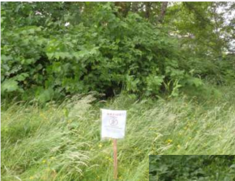
Sign posted at Site 2