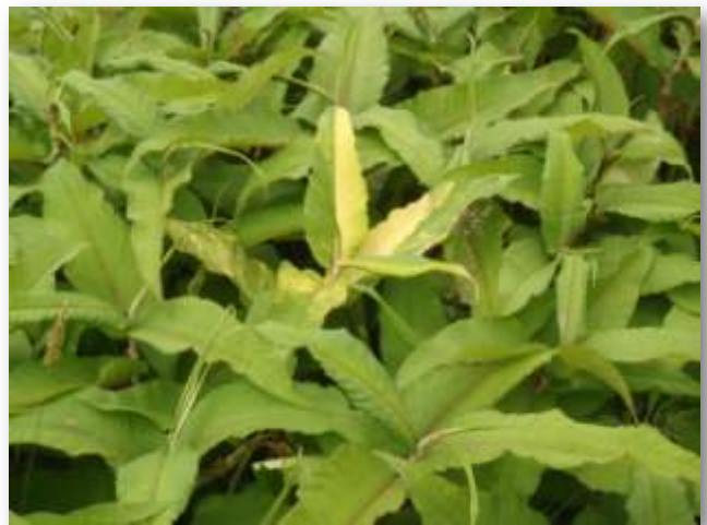
Himalayan knotweed infestation in Haida Gwaii

The knotweed species are of particular concern wherever they establish. Not only do they have the ability to spread rapidly and quickly, knotweed roots have the ability to push through cracks in pipes, roads and building foundations. Knotweed shoots can re-sprout after cutting and 1 cm root pieces can also re-sprout. Roots are prolific and extensive and extremely difficult to remove once established.