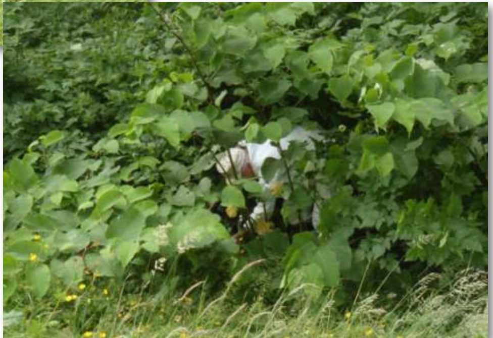
Site 2 - Stem injection