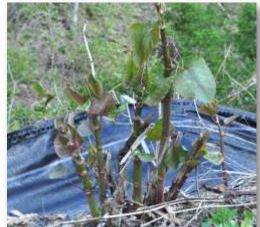
Attempted smothering of knotweed

The manual work tested on knotweed has had variable success. Treatments with sea water to saturate the soil on sites next to the shore were successful on Himalayan knotweed but not on Japanese or Bohemian. The salt water treatments changed the salinity of the soil to a