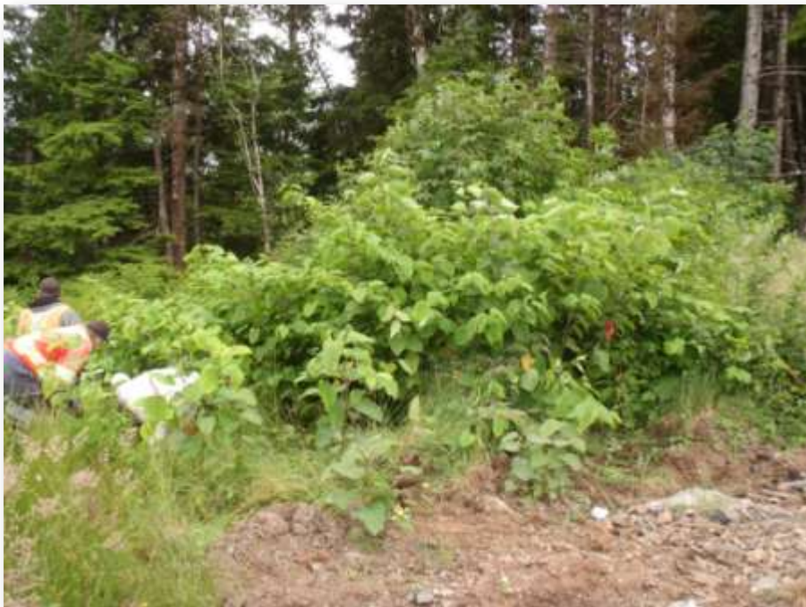
Bohemian knotweed at Village of Queen Charlotte empty lot (Site 1)

Three treatment sites were selected based on suitability for demonstration, the size of the infestation and species of knotweed, and threat to infrastructure. All sites had been previously mapped and infestation size recorded on the Provincial Invasive Alien Plant Program (IAPP) application ( http://www.for.gov.bc.ca/hra/Plants/application.htm ).