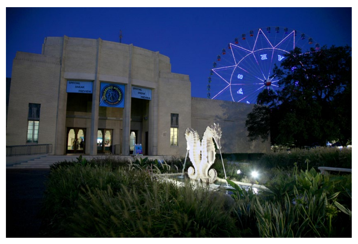
The Children's Aquarium at Fair Park, Dallas, Texas, is home to six Alligator Gar cultured at Natchitoches NFH.

A wise man once said "We should tell the Truth to our family, neighbors, and everyone we meet" and, in order to spread the Truth about Alligator Gar, Natchitoches NFH partnered up in August with the Caldwell Zoo in Tyler Texas, The Children's Aquarium at Fair Park in Dallas Texas, and Bass Pro Shops to help carry our message to a greater number of people than we would encounter at the hatchery alone. At the end of our Alligator Gar production season, the hatchery still had 171, 14 to 16 inch Alligator Gar. We proceeded to call any Zoo and Aquarium within a 4 hour driving