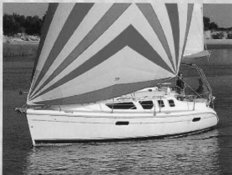
The 320 sports a long waterline giving her superb performance both on and off the wind. A low profile keeps her stable while the boom is high and out of the way.