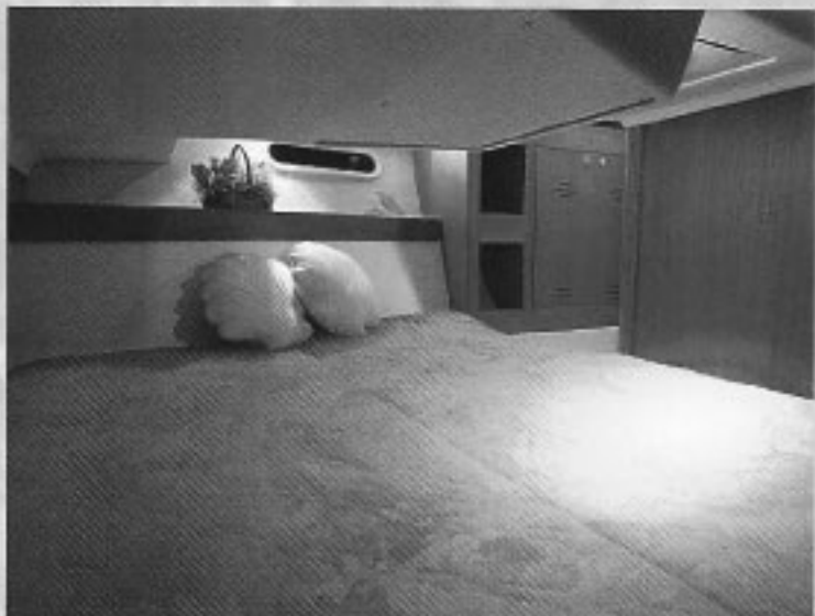
Headroom in the master stateroom is excellent. The queen-size berth is accompanied by two hanging lockers and plenty of stowage.