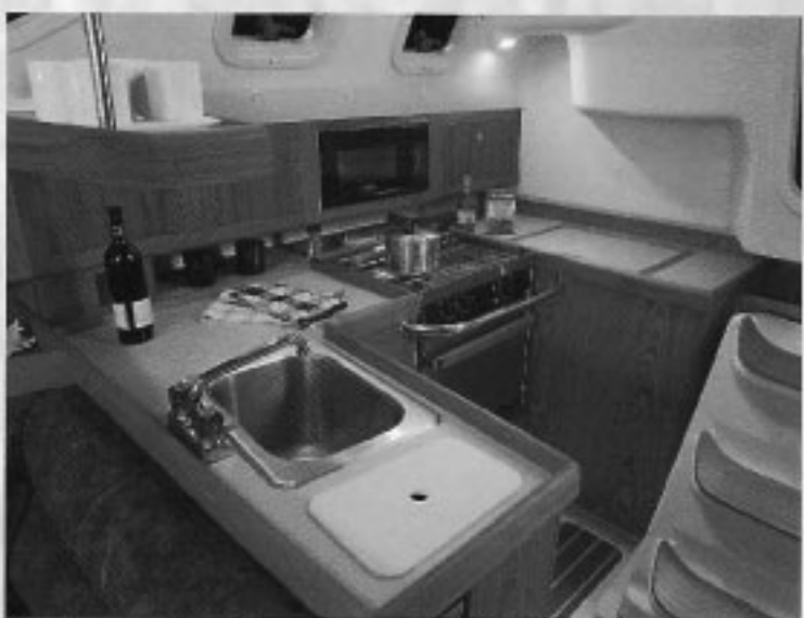
Normally, galleys like this are only found on 36-footers. Removable trash bin, large stainless steel sink, two-burner range, microwave and a deep icebox are all at hand. Stowage is both above and below the generous countertops.