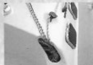
Coaming wells keep the halyards and sheets neat and organized. All lines lead aft to the cockpit to make short-handed sailing easier.