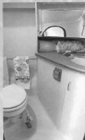
Corian® counters and easily maintained surfaces make this large head easy to use with the standard hot shower and marine head.