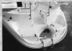
Swimming, diving, or just loading the tender is easy from the walkthrough transom and swim platform.