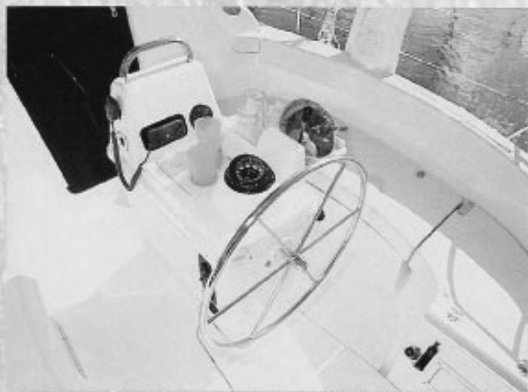
Custom consoles provide added space for instruments and the drop leaf table is perfect for entertaining.