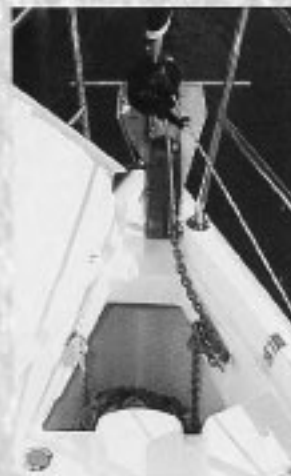
The deep anchor well can hold plenty of rode and chain and provides a mount point for the optional windlass as well as the standard anchor roller.