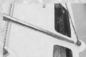
Attachment of the mast struts are secure and inboard to keep the sidedecks free and clear.