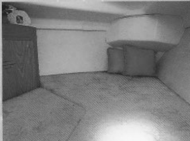
Forward, the guest stateroom is totally private and will hold all the gear your family or friends would need.