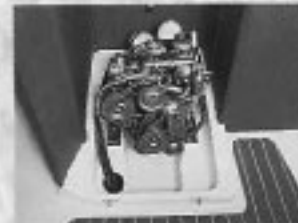
Engine access is quick and complete with the lift out and removable insulated engine cover. The 18 HP Yanmar is powerful, economical, and reliable.

While everyone else was complaining about the high cost of marine hardware and accessories, Hunter was doing something about it. The Hunter Cruise Pac® was developed to make all the accessories and hardware you need standard equipment. We buy top-quality gear in very large quantities. The result? Equally large savings. The Hunter 320 Cruise Pac® isn't just sails, winches, and running rigging – it's things like galley, anchor, fire extinguisher, running lights, life jackets – even a copy of US Sailing's Basic Cruising Manual . We invite you to compare the Standard Equipment list below with that of any other manufacturer. You'll discover that Hunter is going the distance for you with more – and better gear. For less.