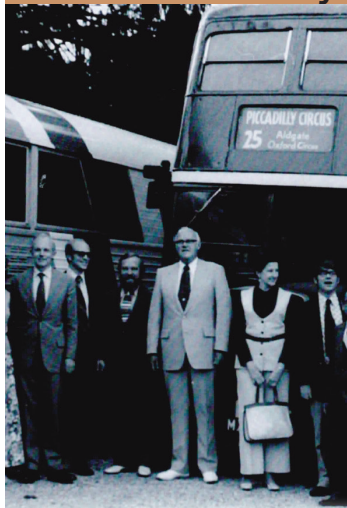
Advocates lead bus tour during hearings.