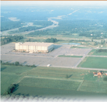
Park advocates objected to the construction of the Richfield Coliseum.

Although regional parks safeguarded certain places, by the 1960s local citizens feared that urban sprawl would overwhelm the Cuyahoga Valley's quiet beauty. Early efforts to slow development focused on fighting individual projects and rarely met with success.