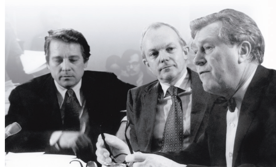
Congressmen Regula (left) and Seiberling (center) at CVNRA hearings.

of Cuyahoga Valley National Park Association (CVNPA). Along with the Cuyahoga Valley Park Federation, CVA generated the crucial support that pushed park legislation through Congress. Seiberling, freshman Congressman Ralph Regula from Navarre, former Republican National Committee Chairman Ray Bliss from Akron, and other Ohio leaders encouraged a reluctant President Gerald Ford to sign the bill. Ford, on a holiday ski vacation, did so on December 27, 1974, establishing Cuyahoga Valley National Recreation Area (CVNRA).