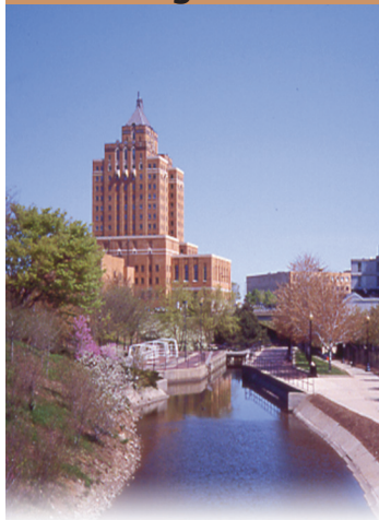
Canal in Akron.

At the 1974 hearings, Congressman Regula said, "...we could be the architects in preserving this heritage for future generations, it goes far beyond today in terms of the potential." This has proved true. In 1996 Regula sponsored legislation to create the Ohio & Erie Canalway, a 110-mile national heritage area from Cleveland to New Philadelphia that extends the Towpath Trail and Cuyahoga Valley Scenic Railroad. The Canalway physically connects CVNP to local parks and 40 communities.