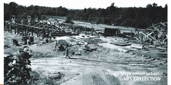
Happy Days construction.

In subsequent decades, private recreational venues such as ski resorts, golf courses, scout camps, and Blossom Music Center opened.