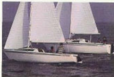
HUNTER 19 HUNTER 22