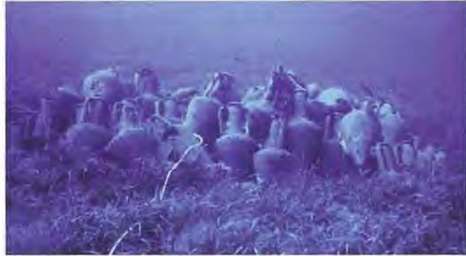
The Hellenistic wreck site lay less than a mile from Kyrenia harbor at a depth of ninety feet.