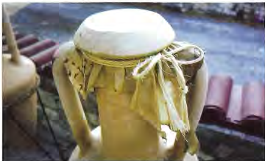
After several experiments to determine what material might have sealed the amphorae, we found goat skin to work. Tied on wet, the goat skin shrank tight as a drum as it dried.

I have touched on the first of our experiments aimed at learning some of the practical aspects of life on board. The final excavation report, when published, will include the results of these as well as additional innovative experiments, including finding surprising uses for wooden toggles at a sailmaker's in Maine, grinding grains with Kyrenia millstones, and sinking wine-filled amphorae stoppered with corks and skins to watch the seals implode. Our understanding of the excavated material will be all the richer for it as the old ship makes her final journey towards publication.