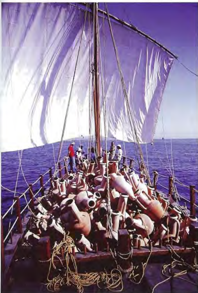
From the stern steering deck, imagine how top heavy the ship would be if these amphoras were full.

A far more efficient technique, we discovered, was to hoist each amphora or millstone using the lifting boom called a "mast derrick" mounted at the base of the mast on Kerynia Liberty. An iron hook identical to one found in the excavation hung down from the derrick to grab a simple rope sling around each item. Now one man dockside could slip a sling under the two handles and simply guide the hanging amphora to a second crewman standing on a crossbeam, who, in turn, guided it to the stower below. A fourth man, our captain, positioned near the mast, worked the ropes and pulleys like a modern crane operator. This operation took only twenty seconds from lift-off dockside to touch down in the hold. We cannot say convincingly that