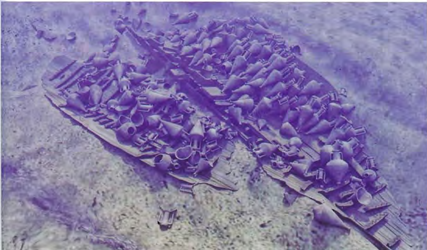
Computer imaging shows the two lowest layers of amphorae as they lay within the collapsed hull. Notice in this view from the bow how the ship has split apart along the keel. Over the keel on the port side some of the three rows of rectangular millstones are seen, with amphorae piled over them. Imaging such as this is a step towards visualizing how the ship fell apart after sinking.