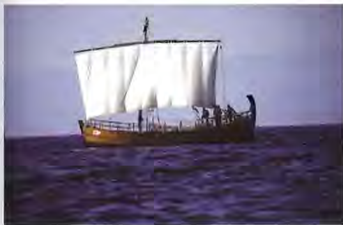
The replica, Kyrenia II, on a voyage between Cyprus and Athens. Her single broad square sail, typical of those seen in ancient vase painting and relief sculpture, was raised upwards like a Venetian blind by the vertical lines seen here. The lines ran through rings sewn to the sail. Over 150 such lead rings were found in the excavation.