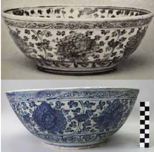
Top after: R. Krahl, Chinese Ceramics in the Topkapi Saray Museum: A complete catalogue , vol. 2, London, 1986, p. 554; bottom, photo 1998: Ph. Sebirot.