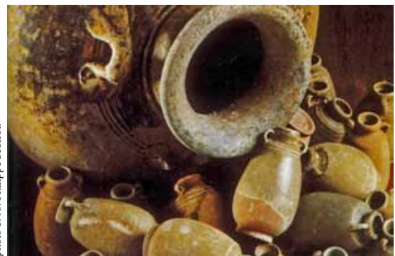
After: La Mémoire, Précis scientifique, p. 95