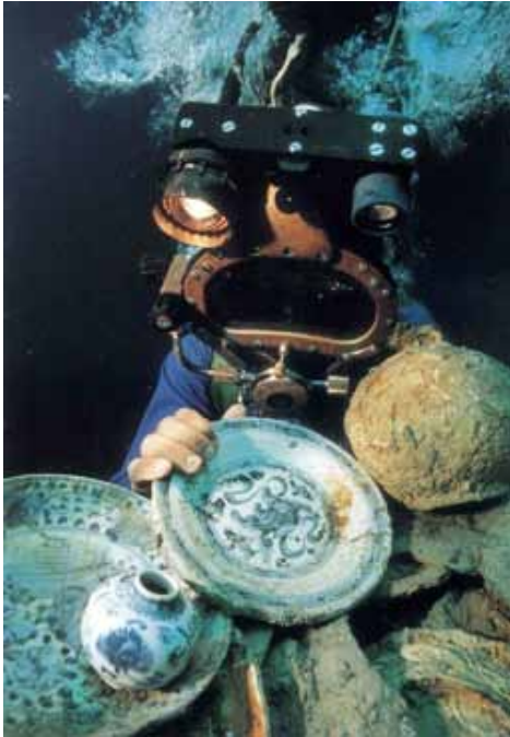
After: La Mémoire, Cahier de fouille, p. 75