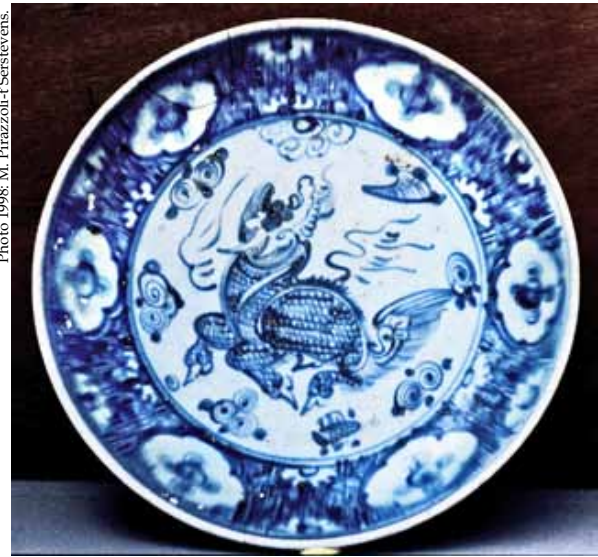
Fig. 10. Chinese blue and white porcelain with a decor of qilin, Bru 484.

After La Mémoire , Carnet de dessins, p. 10 (drawing by Marie-Noëlle Baudrand); photo 1998; Ph. Sebirot.