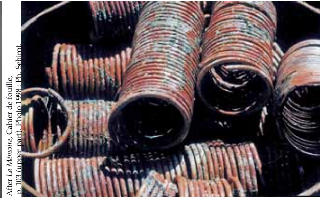
After La Mémoire , Cahier de fouille, p. 103 (upper part), Photo 1998 : Ph. Sebirot.