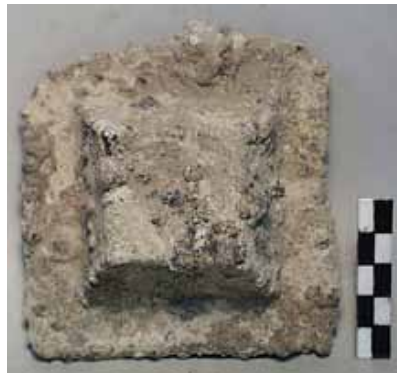
Fig. 13. Malaysian tin ingot, Bru 166 P1.