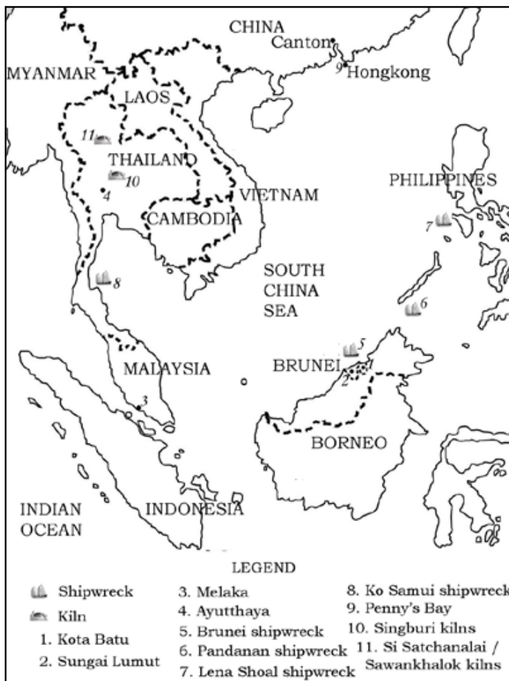
Fig. 1. Map showing locations mentioned in text.

Following the survey report, a salvage excavation was scheduled. The operation lasted two months, from the end of May to the end of July 1998. It was one of the first shipwreck excavations in the region to have only scientific aims and which was not motivated by commercial purposes. The excavation was made very difficult at first by natural conditions. The shipwreck lay at a depth of 63 meters in a volatile mud constantly washed in a turbid sea, which created very poor conditions of visibility. The site is 24 m long and 18 m wide. Moreover the field work had to be conducted quickly first because the risk of looting is so high in the region, and also because of the pressure and conditions laid down by the sponsors of the project, in the first instance TotalFinaElf.