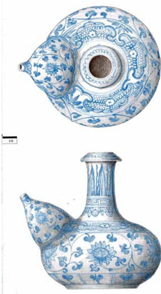
Fig. 9. Drawing of a Chinese blue and white porcelain kendi Bru 1945.

This is not the first quality porcelain made in official kilns, but an ordinary production made in private kilns ( minyao 民窑) from Jiangxi province, Jingdezhen, but also maybe in several cases Linjiang 臨江 kilns (see Kaogu xuebao 1995/2, pp. 243–74, esp. Fig. 18/2, p. 269, similar to Bru 919). This production was for the domestic market as well as for export. 8 The decoration is typically Chinese, with floral motifs, mythical animals such as qilins [Fig. 10], dragons, phoenix, and Buddhist symbols (such as Chinese lion-dogs playing with the pearl of wisdom). No motif is really intended for Muslim customers. Nevertheless, the cargo's blue and white porcelain is similar to that which litters the site of Kota Batu, the ancient capital of the Brunei Sultanate from 14 th to 17 th century, even if we also find at Kota Batu high quality pieces (Harrison 1970). I shall come back to the