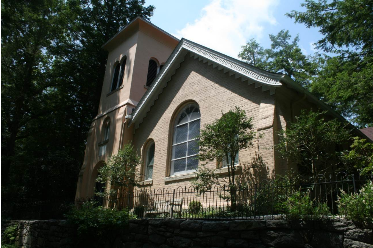
Saint John in the Wilderness Church