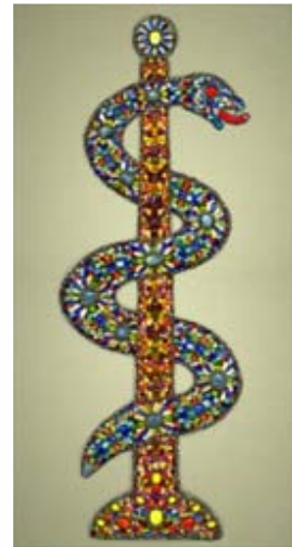
Rod of Asclepius