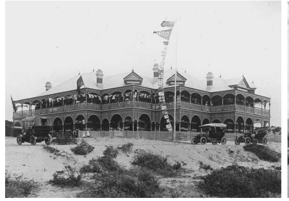
Ocean Beach Hotel (WAMBEJ, 25 Jan 1908, p.17)