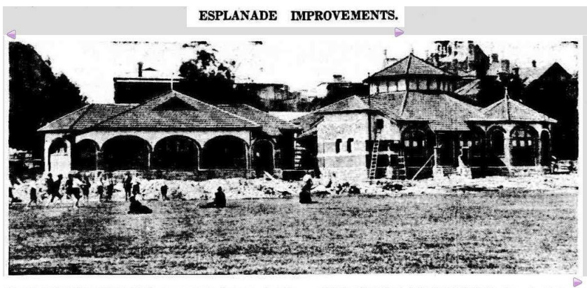
The ortagonal refreshment kiesk and dressing rooms (five for men and one for women) facing the Esplanade, close to Barrack-street. The contract price was £5,581. Tenders are being called for the leasing of the premiser, which the council is confident will return more than interest on the expenditure, notwithstanding adverse eritism. The architect was Mr. L.B. Campston.

Kiosk and sports dressing rooms, The Esplanade, Perth (The West Australian, 23 October 1928, p.16)