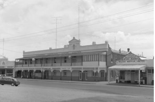
Cunderdin Hotel (SLWA 280926PD)