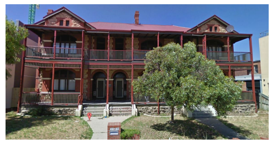
Tom Burke House, 191-195 Newcastle St, Northbridge