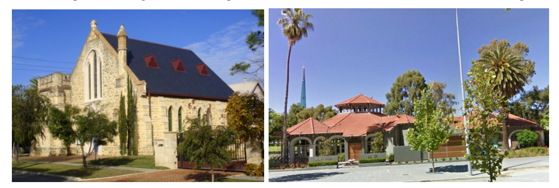
St Columba's Church, Peppermint Grove (Neil Cumpston) Kiosk, The Esplanade, Perth (Google 2012)

Kiosk and sports dressing rooms, The Esplanade, Perth (The West Australian, 23 October 1928, p.16)