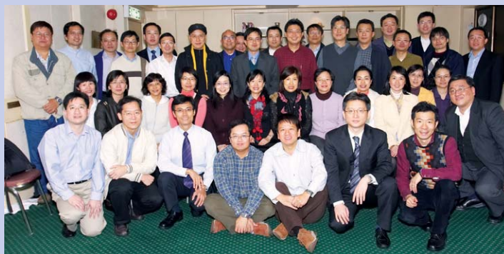
Science Class of 1986