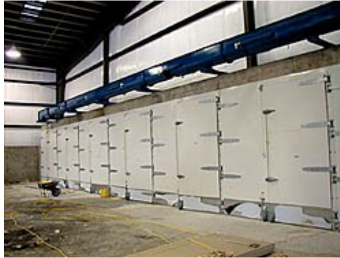
West Yellowstone Compost Facility