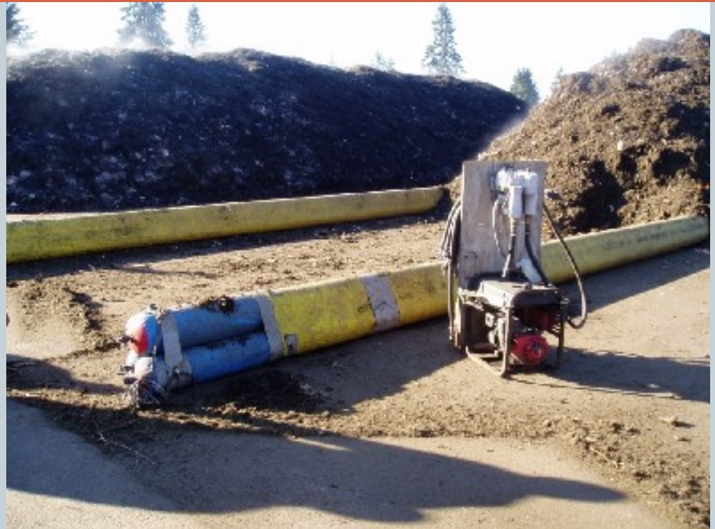
Silver Springs Organics, Tenino, Washington