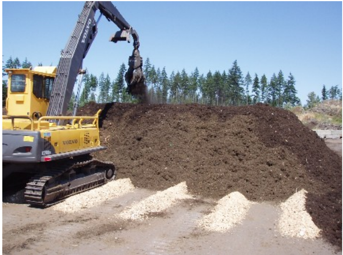
Positive Aeration North Mason Fiber, Silverdale WA

Smaller individual blowers per pile can improve efficiency