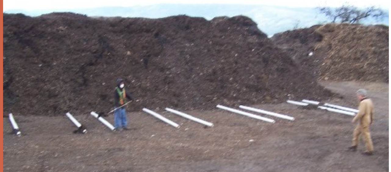
Cold Creek Compost, Ukiah, CA