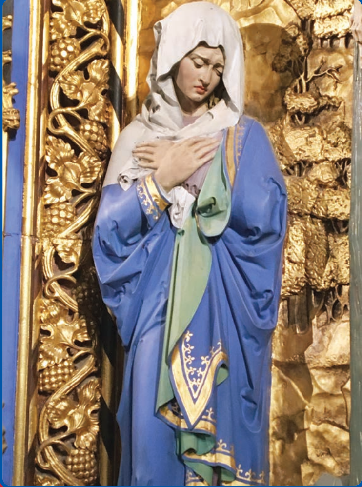
Our Lady at the foot of the Cross, Christ Church Cathedral, Oxford

The Superior-General, the Chaplain-General, Officers and General-Council of the Society wish you all a Happy Christmaside.