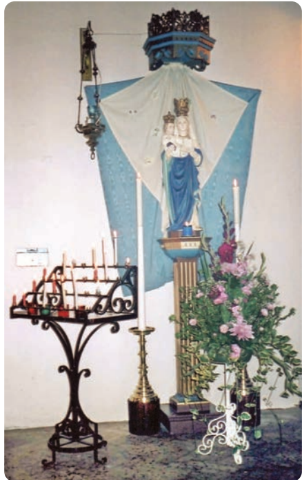
■ The Shrine of Our Lady of Aberdeen in S. Augustine’s, Grimsby.