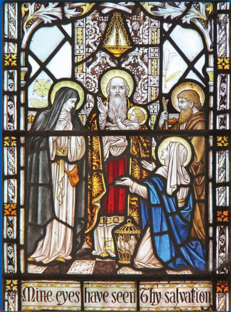
Presentation Window at S. Peter and S. Paul, Heydon, Norfolk