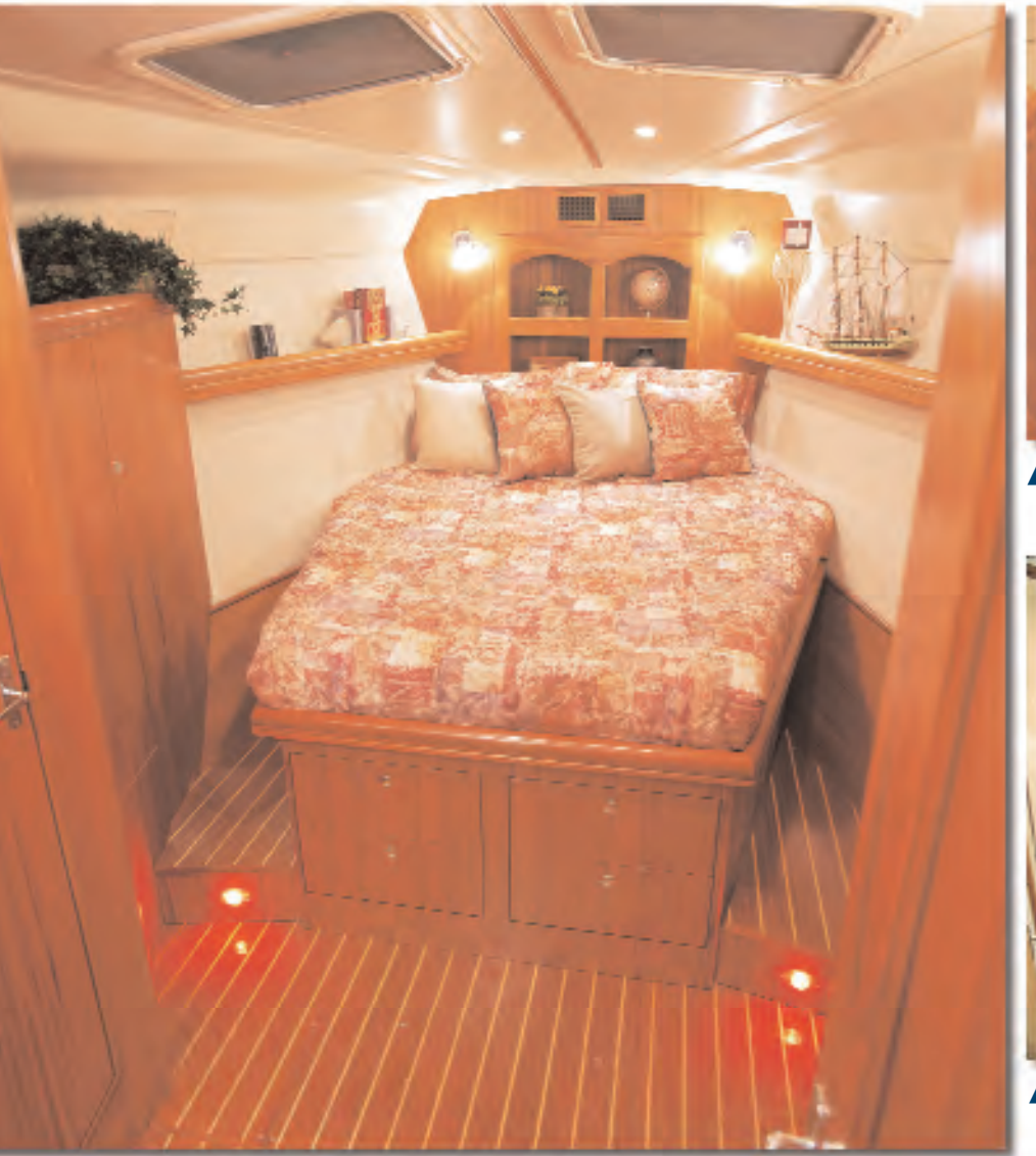
▲ The forward master stateroom rivals yachts twice her size. Twin hanging lockers and lots of drawers make staying aboard easy and a great night's sleep is guaranteed by the inner-spring mattress.