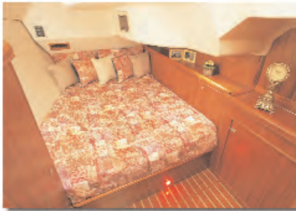
▲ Aft starboard, you'll find the guest stateroom with a full-size double berth, hanging locker plus immediate access to the head with shower.