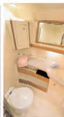
▲ The master head provides plenty of storage under the Corian®topped vanity. A separate stall shower is located to starboard.