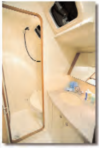
▲ The day and guest head is convenient to the guest staterooms and salon and includes a shower as well.