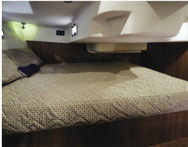
In the aft cabin, the queen berth is positioned across the boat allowing for full height at the head of the boat.

nically at 7.5 to 8 knots. The concave shape of the bow section of the hull is intended to reduce pitching by helping to cut through the waves. The chine carried from the beam all the way aft helps to provide stability. In those conditions we were heeled 10-15° with about 10° of weather helm rudder carrying full sail area. The B&R designed rig has no backstay eliminating interference with the roach on the main. There