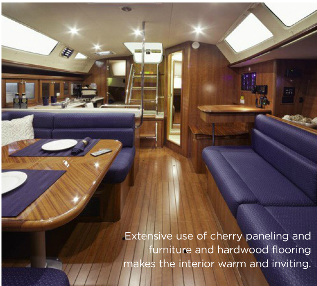
Extensive use of cherry paneling and furniture and hardwood flooring makes the interior warm and inviting.

Pass through the starboard side galley to enter the aft cabin. The queen-sized berth is positioned across the boat allowing for full height at the head of the bed allowing the