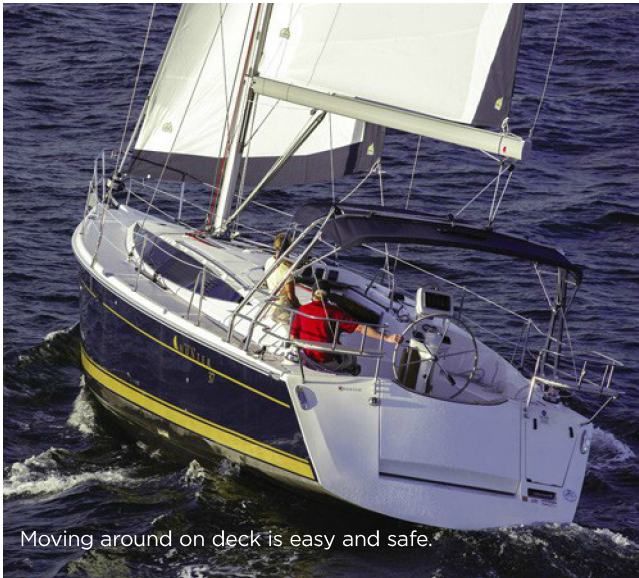
Moving around on deck is easy and safe.

opening hatches with screens, small side ports and LED lighting provide an abundance of light. The Nav desk is on the port side, with a contoured wooden bench, an Icom VHF with DSC and a remote mic at the helm, and a JVC stereo. The electrical panel includes tank level indicators.