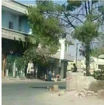
Fig 2: A man selling black-market fuel in Salamiyah.

The official price for one liter of diesel is approximately 130 Syrian pounds and the price for a liter of gasoline is 160. The price of both can be double that or more on the black market and ordinary citizens are being forced to buy them illicitly as they are not available at gas stations.