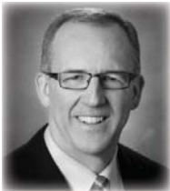
GREG SANKEY Commissioner