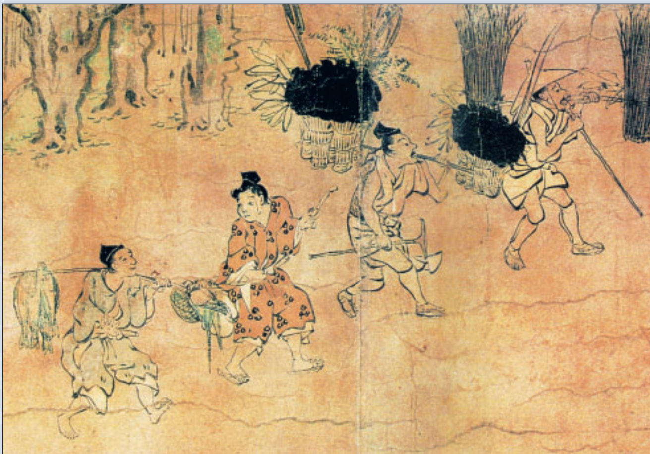
Charcoal and seafood peddlers traversing the streets of Kyoto. Dried somen was also sold by peddlers like those seen in this illustration.