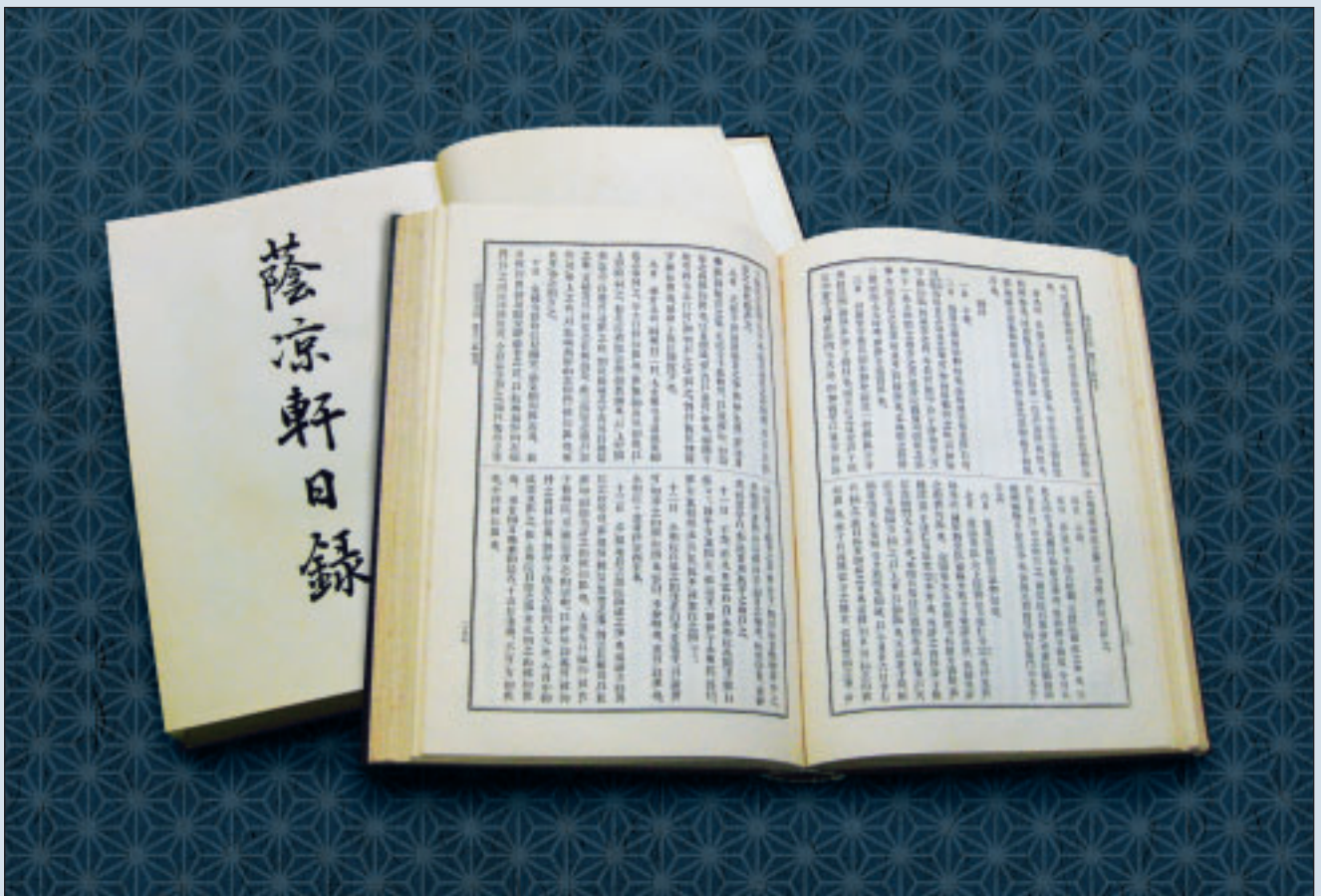
The inside cover page and text from Onryo-ken Nichiroku (Eitoku-sha, 1953)

Likely due to the fact that it served as an official record, Onryo-ken Nichiroku does not include descriptions of the noodles served to its monks on