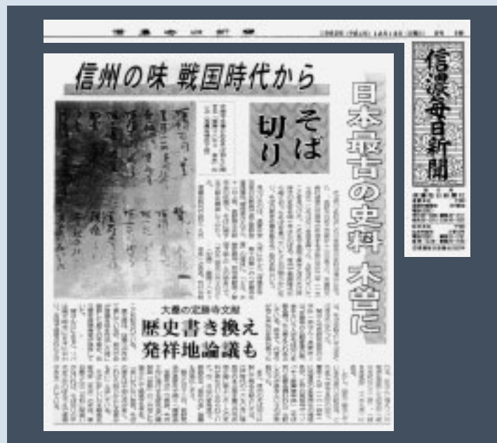
A newspaper article reporting the discovery of historical materials proving that sobakiri was eaten by common people during the Tensho era (1573-1593; The Shinano Mainichi Shimbun, December 13, 1992)