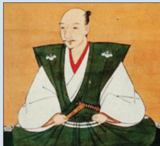
Nobunaga’s open-market, open-guild policy eliminated monopolies on distribution, as well as many taxes, to promote economic activities in castle town markets.

The Osawas, who wrote Yamashina-ke Raiki ,