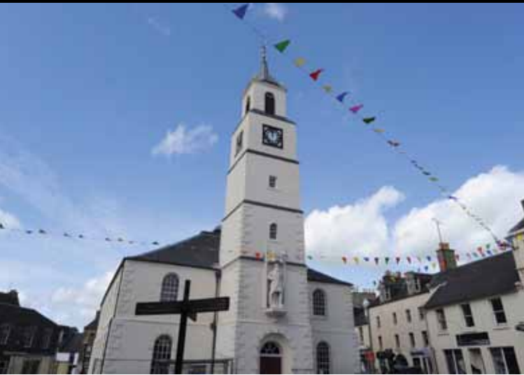
St Nicholas Church