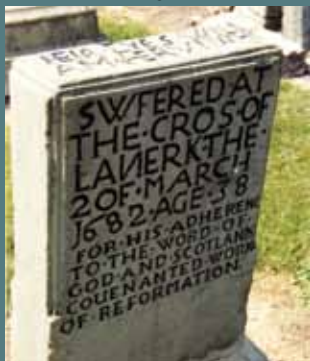
The Martyrs Stone