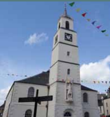
William Wallace statue