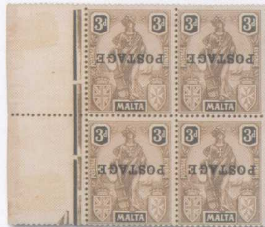
Fig. 2. Examples of the 'POSTAGE' inverted 3d stamp.