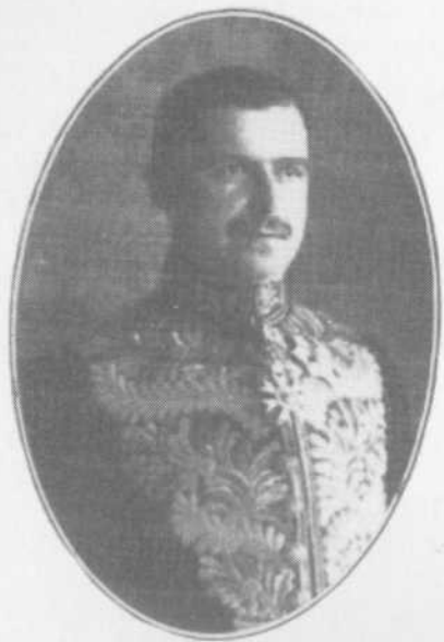
Fig. 4. Count Gerald Strickland.