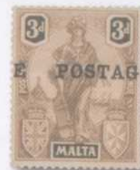
Fig. 3. An example of the 'E POSTAG' 3d stamp.