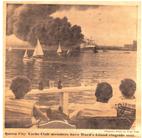
July 22, 1965: Toronto Telegram the Orient Trader burning off Ward's island as viewed from the balcony of QCYC.

McKenzie. Unfortunately, or maybe fortunately, the day the freighter, Orient Trader caught fire, the only active engagement by the fire boat, he was off duty and watched it all with other club members from the east balcony of QCYC.