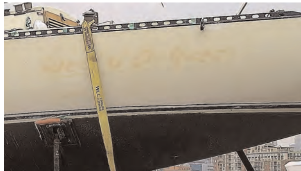
Staining left on topsides after removal of vinyl lettering...awaits oven cleaner.

OK, boat naming blues. Now the best British blues