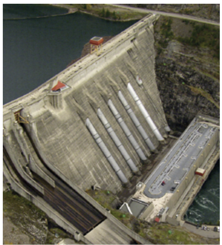
Revelstoke Generating Station