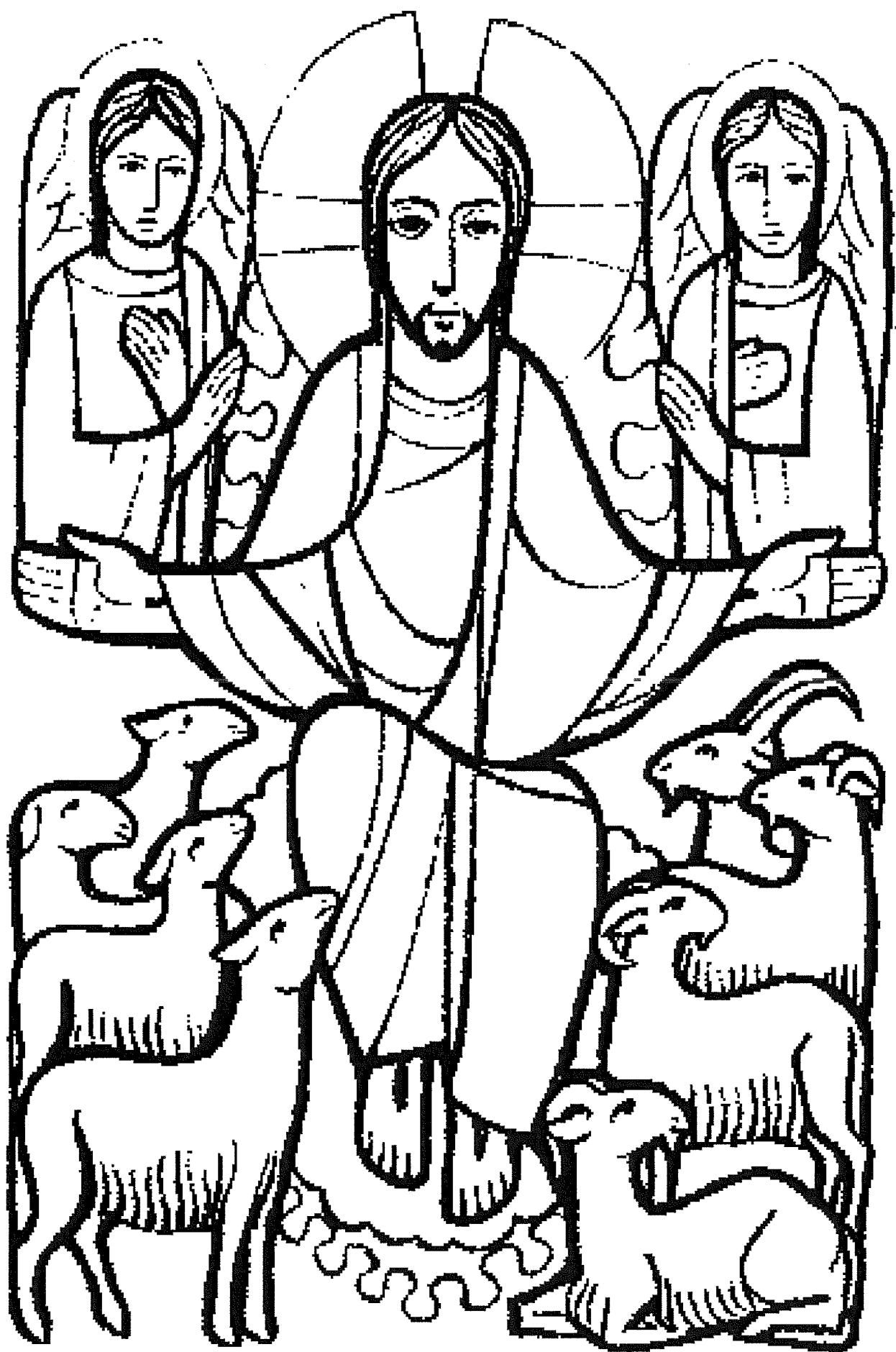
The Solemnity of Our Lord, Jesus Christ the King