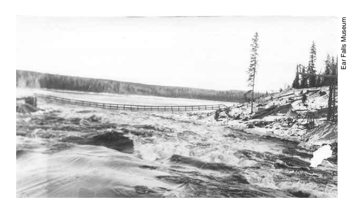
Lower Ear Falls before dam construction 1928.