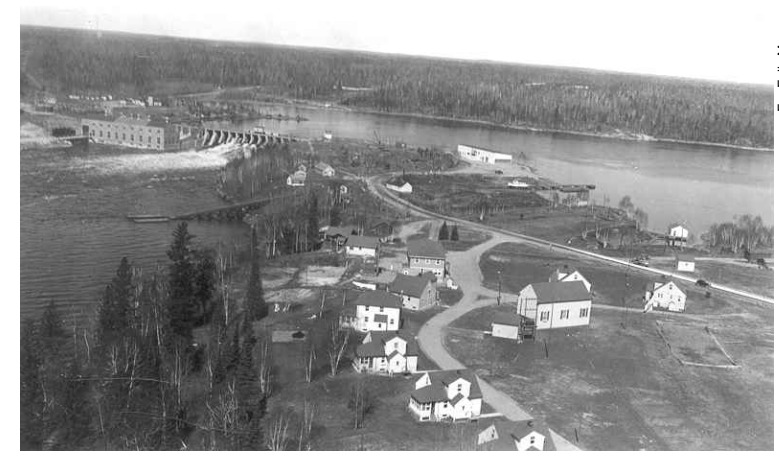
Ear Falls in the 1940s, Hydro Colony in forground. A boat is being transported over the marine railway to the lower English River.

Between 1915 and 1917 the Water Power Branch of the Department of the Interior began a survey of the English River. The purpose of the survey was to investigate potential sites for power generation along the waterway. In 1929 construction was started on the Ear Falls conservation dam which would regulate the discharge of waters from Lac Seul into the English River. A powerhouse was added the same year and soon power was being generated for the mining operations to the north at Red Lake. Additional generating units were installed in 1937, 1940 and 1948, providing a steady flow of electricity to the northwestern power grid.