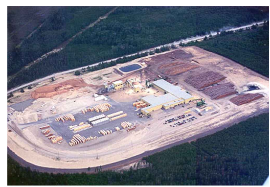
Ear Falls Sawmill Weyerhaeuser Canada

A modern community set within the beauty of Northwestern Ontario's Sunset Country makes Ear Falls a great place to live work and play