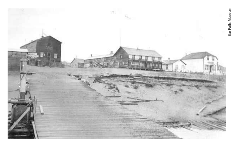
Goldpines at its peak in 1929, the Hudson's Bay Company Store is on the right. This photo was taken before the rise in water levels on Lac Seul.

Ear Falls is situated on the English River at the northwest corner of Lac Seul, Ontario's second largest lake. The areas abundance of fish and game and its location on a major waterway has made Ear Falls a natural travel and trading center since mankind first inhabited the region some 7500 years ago.