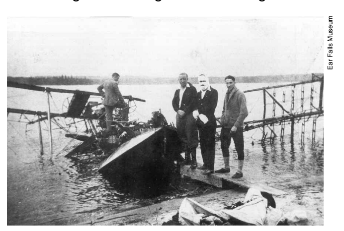
The dangers of bush flying. Fire destroys a Ontario Air Service "flying boat" G-CAOF at Goldpines in 1928.

Goldpines remained the main settlement in the area until 1929, when the dam was built at Ear Falls. With the dam came the workers who moved into the construction camp close to the dam. Others moved from Goldpines to the area downstream of the dam known as "Little Canada". That same year the Department of Lands and Forests moved its operations from Goldpines to Goose Island. In the years to follow the decline of mining activity at Woman Lake and the development of the mechanical portages at Ear Falls proved to be the final blow for this little community at the mouth of the English River. For Goldpines the gold rush was over. On a visit to Goldpines today you can still see some of the relics of days gone by as some of the original buildings are still being used.