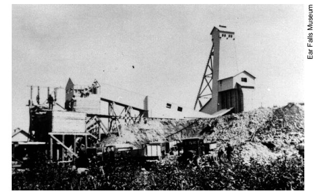
Uchi Lake Mine 1938

The area became a bee hive of activity in 1926 and 1927 with numerous mining companies at Clearwater Lake, Woman Lake, Jackson-Manion, Duncan, Bojo, Bathurst and other properties transporting equipment to and setting up camps while trenching and drilling their properties for mineral potential. The areas remote location made the transport of men and materials extremely difficult and costly. Air transportation from Pine Ridge was expensive and could not fly in large equipment which had to be brought in by horse or tractor. The area also did not have the luxury of having a major navigable waterway like the Chukuni River which provided relatively easy access to the Red Lake area.