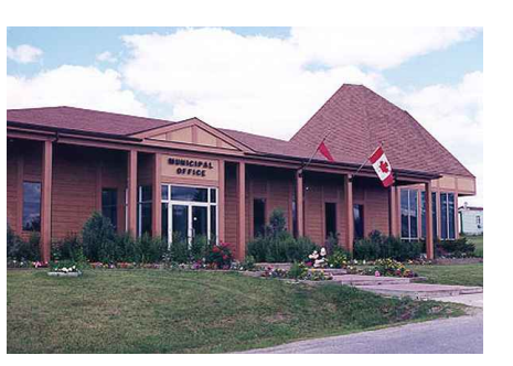
Ear FallsTownship Office