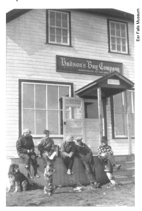
The HBC store at Goldpines, 1929.