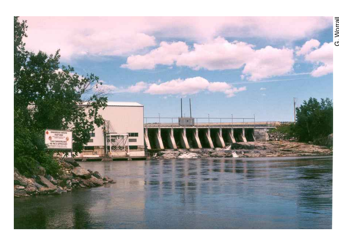
Downstream from the Ear Falls Dam and Generating Station.

Ear Falls is situated on the English River at the northwest corner of Lac Seul, Ontario's second largest lake. The areas abundance of fish and game and its location on a major waterway has made Ear Falls a natural travel and trading center since mankind first inhabited the region some 7500 years ago.