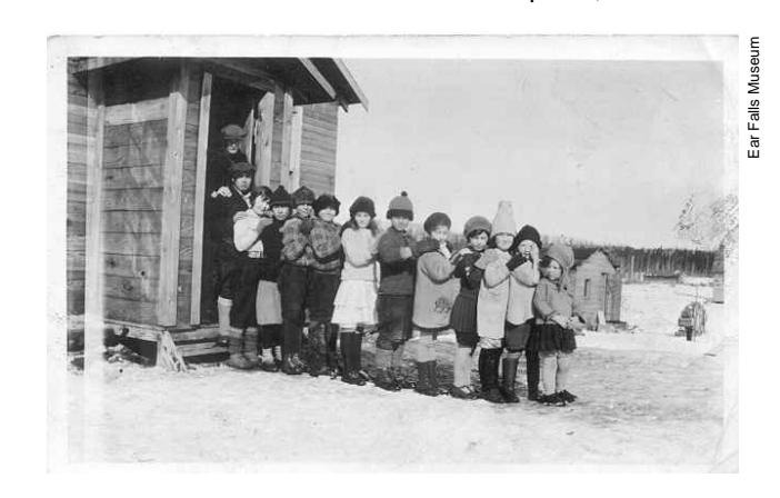
Children at school in Goldpines, 1929