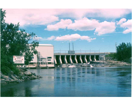
Ear Falls Dam

In 1996 the Township was successful in attracting a sawmill, and in 1997 Avenor began production at its 60 million dollar facility which is presently owned and operated by Weyerhaeuser Canada. The high-tech mill produces dimentional lumber products for markets in Canada, the U.S. and abroad.