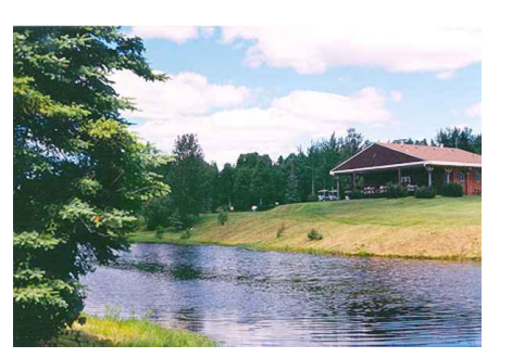
Ear Falls Golf Course

Pakwash Provincial Park, 20km north of Ear Falls is co-managed by Ear Falls 2000 (a local community group), and the Provincial Government. The Park features 1.5km of beautiful sandy beach, tent and trailer sites, a group camping site, nature trail and observation tower, public showers and washrooms, trailer dump station, a boat launch and a beautiful view of Pakwash Lake.