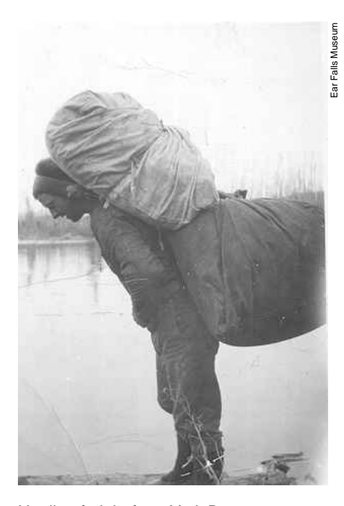
Hauling freight from York Boats at Goldpines in 1926.