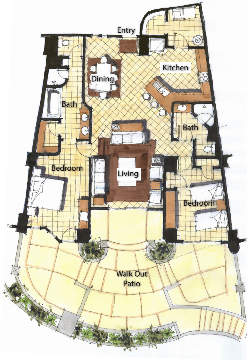
Two Bedroom Unit Abulon Tower