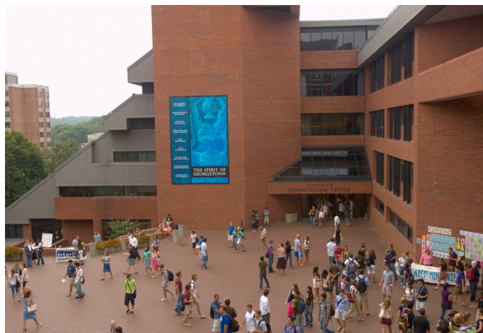
Bunn Intercultural Center (ICC)

Consultant, Georgetown Leadership Seminar, Institute for the Study of Diplomacy, School of Foreign Service, Georgetown University