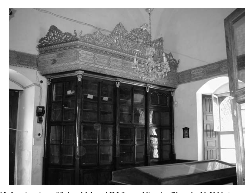
Fig. 13: Interior view of Sultan Mahmud II Library, Nicosia.