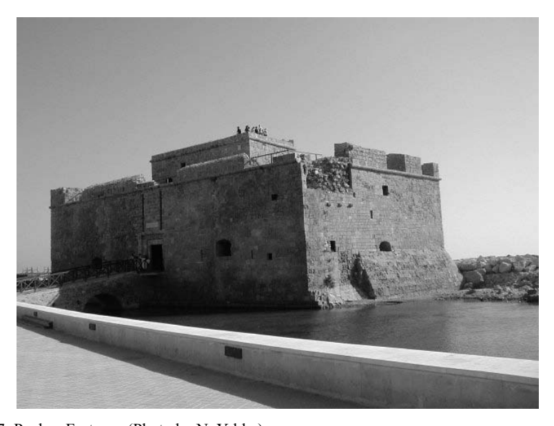
Fig. 7: Paphos Fortress.