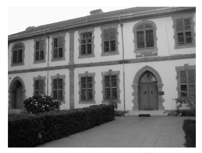
Fig. 1: Cyprus Turkish Vakf Administration (Kıbrıs Türk Vakıflar İdaresi), Nicosia.

the South of Nicosia, as well as the Bekir Paşa Aqueduct and Hala Sultan Tekke in Larnaca. ^{166}\,