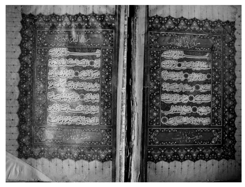
Fig. 15: Kuran-ı Kerim, Vakf of Sultan Süleyman II to Aya Sofya Vakf. (Inv. Mev. 134)