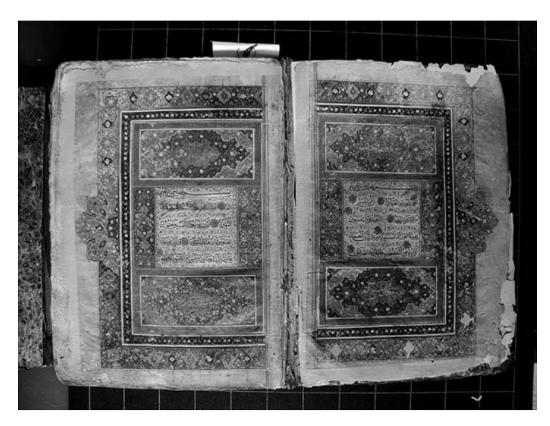
Fig. 14: Kuran-ı Kerim, Vakf of Lala Mustafa Paşa. (National Archive, Girne; Inv. Mev. T. 135)