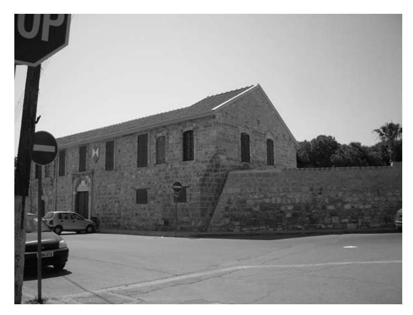
Fig. 8: Larnaka Castle.