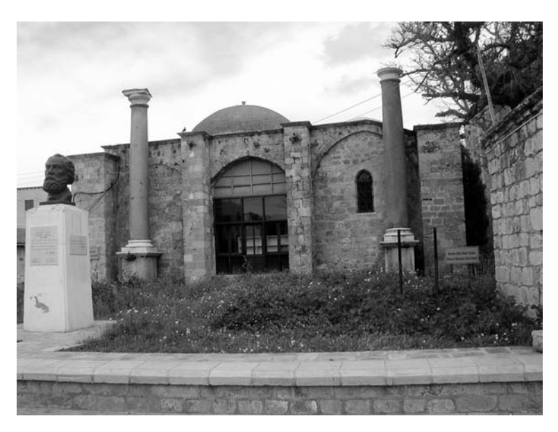
Fig. 10: Medrese, Famagusta.