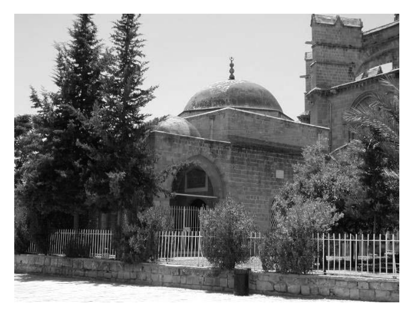
Fig. 12: Sultan Mahmud II Library, Nicosia.