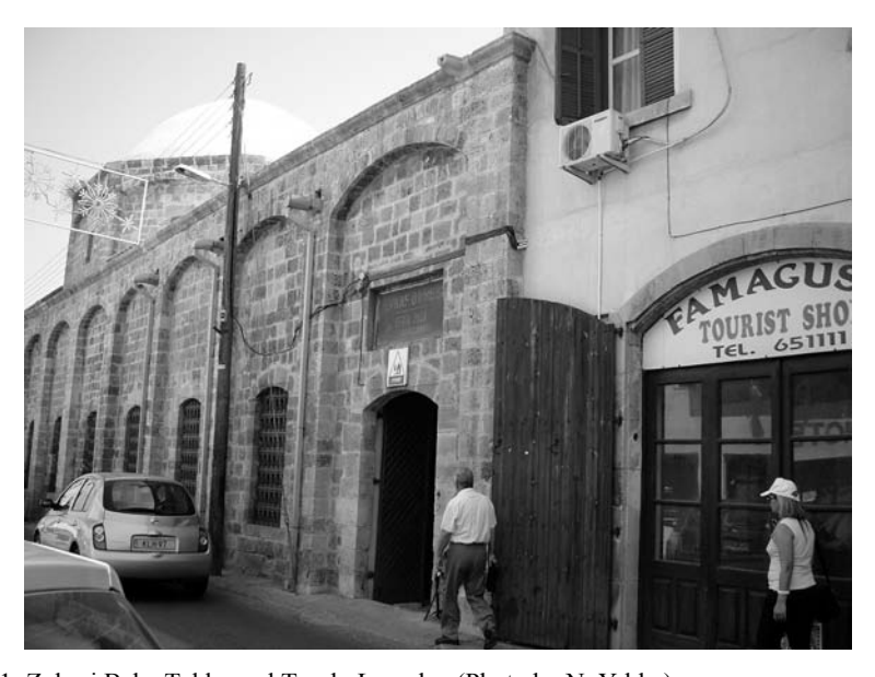
Fig 11: Zuhuri Baba Tekke and Tomb, Larnaka.