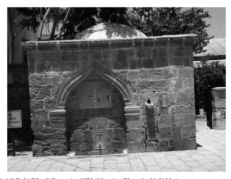
Fig. 9: Ali Ruhi Efendi Fountain, 1828, Nicosia.