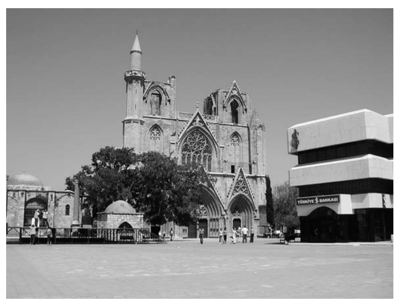
Fig. 3: Lala Mustafa Paşa Cami'i (St. Nicholas / Aya Sofya Mosque), Nicosia.