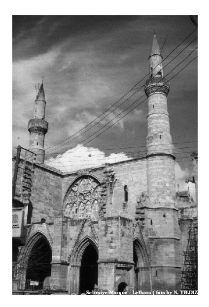
Fig. 2: Selimiye Mosque (Aya Sofya Mosque), Nicosia.