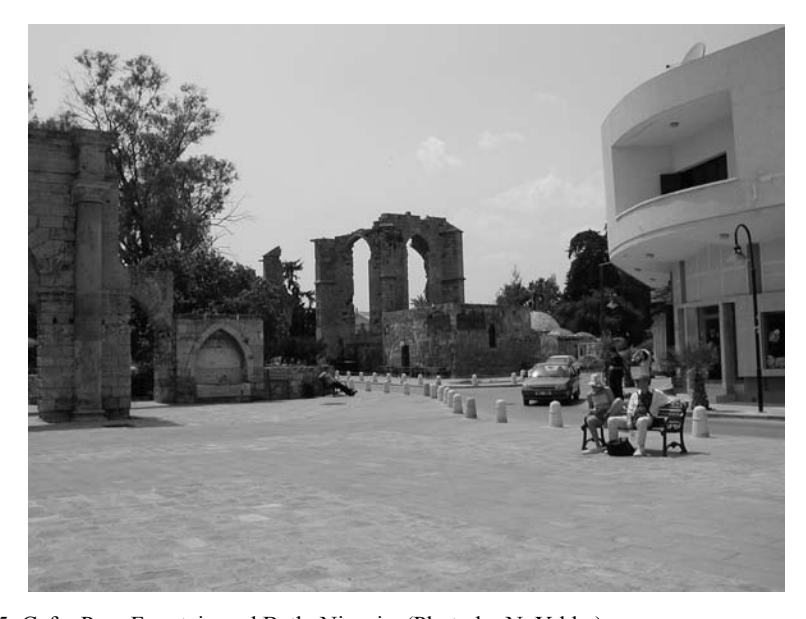
Fig. 5: Cafer Paşa Fountain and Bath, Nicosia.