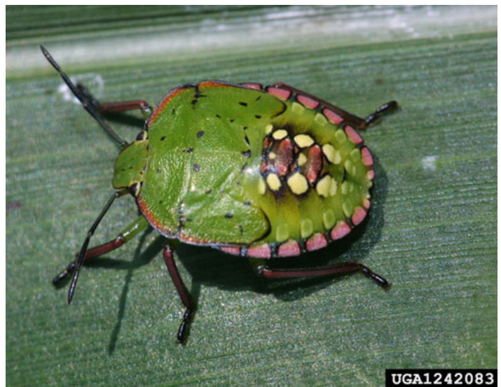
Figure 9. Fifth instar nymph of the southern green stink bug, Nezara viridula (Linnaeus).