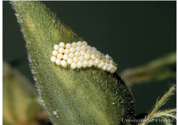
Figure 4. Eggs of the southern green stink bug, Nezara viridula (Linnaeus).

The eggs are firmly glued to each other and to the substrate. The eggs are white to light yellow in color and barrel shaped with flat tops with a disc shaped lid. There are 28 to 32 finger-like projections around the lid called chorial processes. The egg is 1/20 of an inch in length and 1/29 inch wide. The incubation time for the eggs is five days in the summer and two to three weeks in early spring and late fall. As incubation continues the eggs turn pinkish in color.