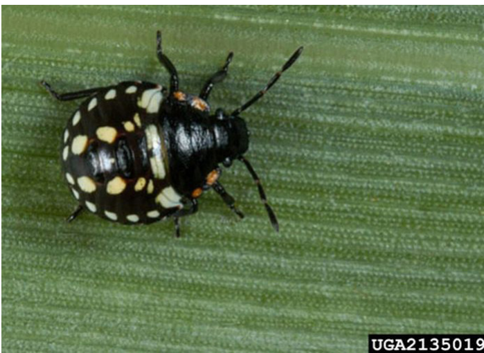
Figure 7. Third instar nymph of the southern green stink bug, Nezara viridula (Linnaeus).