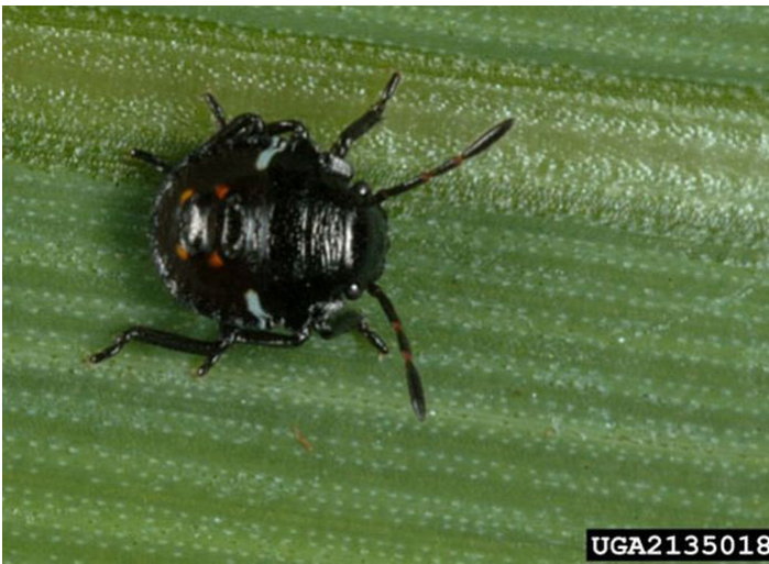
Figure 6. Second instar nymph of the southern green stink bug, Nezara viridula (Linnaeus).