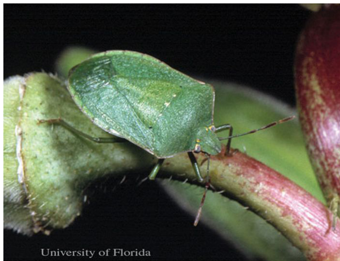
Figure 1. Adult southern green stink bug, Nezara viridula (Linnaeus).

The southern green stink bug, Nezara viridula (Linnaeus), is in the order Hemiptera or “true bugs.” Stink bugs are in the family Pentatomidae, and adults are recognized by their shield-shape, five-segmented antennae, and their malodorous scent. The southern green stink bug is a highly polyphagous feeder, attacking many important food crops.