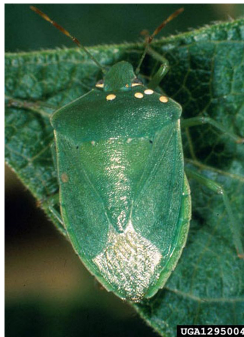
Figure 12. Adult southern green stink bug, Nezara viridula (Linnaeus), with four visible parasitoid eggs.