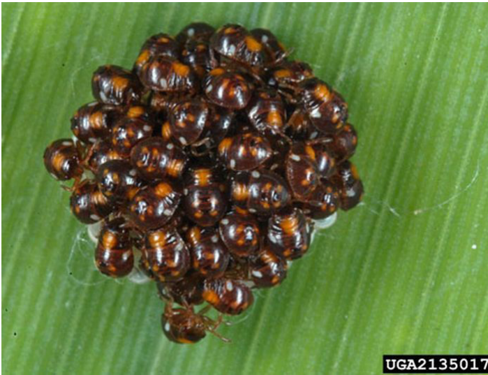
Figure 5. Recently emerged first instar nymphs of the southern green stink bug, Nezara viridula (Linnaeus).