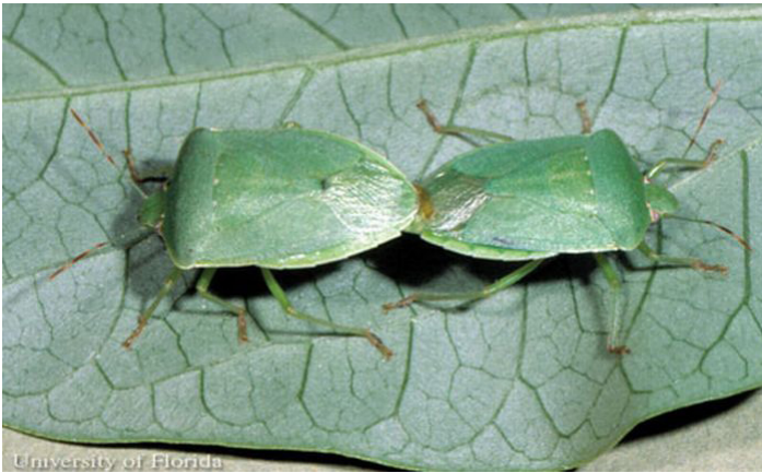
Figure 2. Mating pair of adult southern green stink bugs, Nezara viridula (Linnaeus).