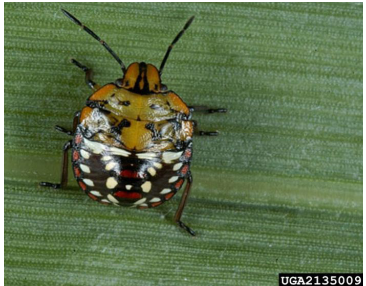
Figure 8. Fourth instar nymph of the southern green stink bug, Nezara viridula (Linnaeus).