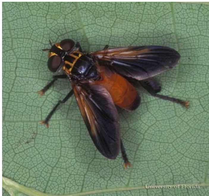
Figure 11. Adult Trichopoda pennipes , a tachinid fly that parasitizes the southern green stink bug, Nezara viridula (Linnaeus).

wasp, Trissolcus basalis , parasitizes eggs. These two parasites have also been introduced as biological control agents in other areas, such as Australia and Hawaii, to control the southern green stink bug. California used Trissolcus basalis in an effort to control its southern green stink bug population.