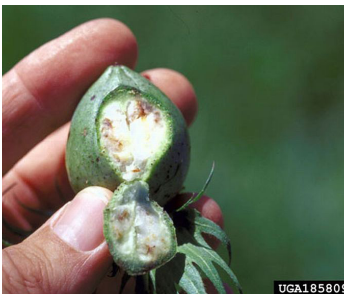
Figure 10. Feeding damage to cotton boll by the southern green stink bug, Nezara viridula (Linnaeus).

The southern green stink bug has piercing-sucking mouthparts. The mouth consists of a long beak-like structure called the rostrum. Salivary fluid is pumped down the salivary duct and liquefied food is pumped up the food canal. All plant parts are likely to be fed upon, but growing shoots and developing fruit are preferred. Attached shoots usually wither, or in extreme cases may die. The damage on fruit from the punctures is hard brownish or black spots. These punctures affect the fruit's edible qualities and decidedly lower its market value. Young fruit growth is retarded and it often withers and drops from the plant. In addition to the visual damage caused by southern green stink bug feeding, the mechanical transmission of tomato bacterial spot may also result.