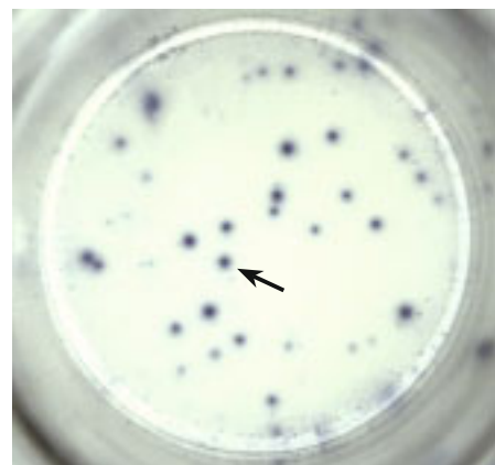
Fig. 2. Peripheral blood mononuclear cells were isolated and suspended in RPMI 1640 with 10% fetal calf serum at a density of 1×10 6 cells/mL. 100 µL of cell suspension and 10 µg/mL phytohemagglutinin were added into wells coated with anti-IFN-γ or IL-4 antibody and were incubated for 20 h. Spots corresponding to cytokine-secreting cells are indicated by arrow. IFN: interferon; IL: interleukin.

Data are presented as mean±standard deviation. BB536: Bifidobacterium longum BB536; IFN-γ: interferon-γ; IL-4: interleukin-4.